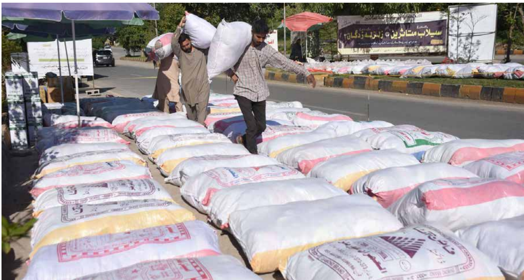
ISLAMABAD: Volunteers of Jamia Masjid Rahmat-ul-Lil Aalameen are placing the grocery and clothes for Eid outside Mosque at Sector F-8 to load in trucks to supply in Sindh for the affected of Flood.