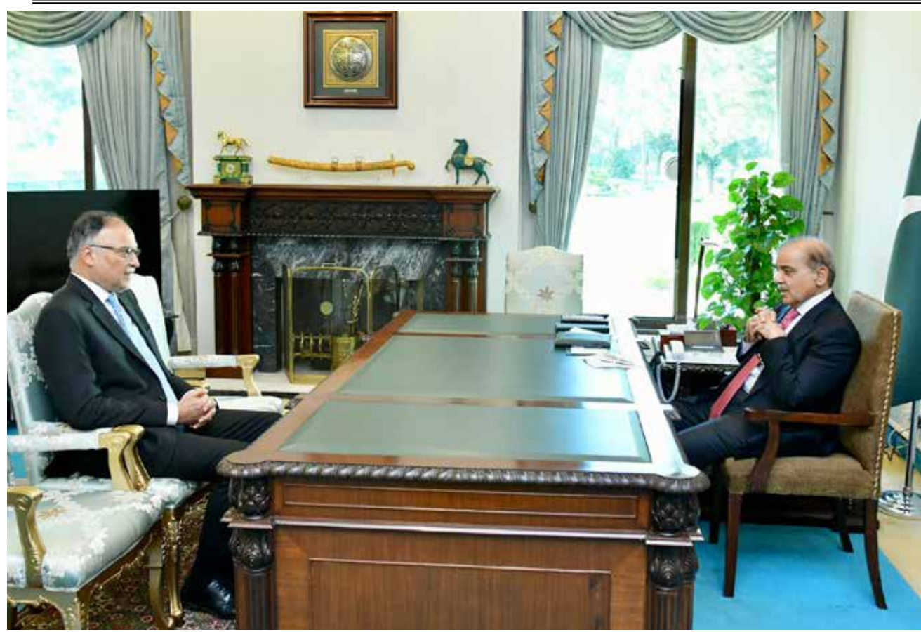
ISLAMABAD: Federal Minister for Planning and Development Ahsan Iqbal calls on Prime Minister Shehbaz Sharif.