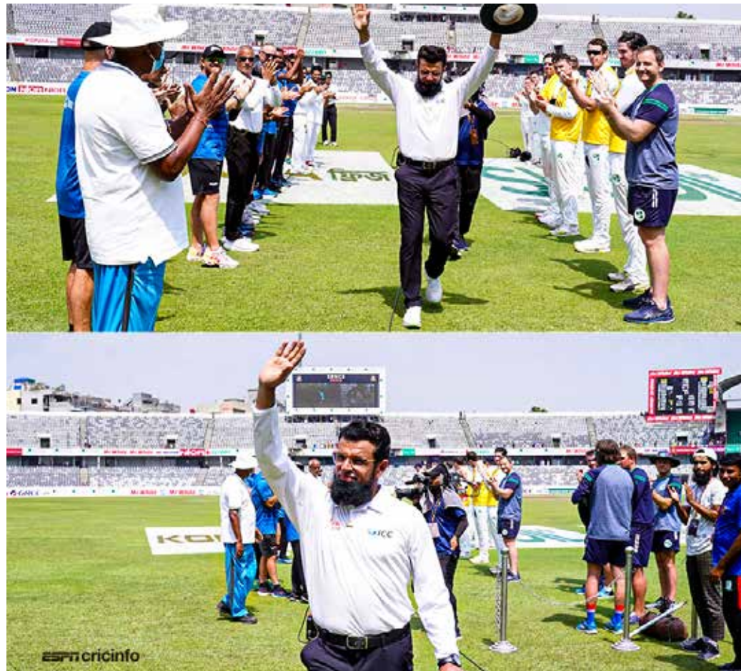
Dar officiated a total of 438 international matches over the course of his illustrious career.

DHAKA: Renowned Pakistani umpire Aleem Dar received a guard of honour after officiating in his last Test match as an ICC Elite Panel umpire during the fixture between Bangladesh and Ireland in Mirpur on Friday. Bangladesh won the match on the final day by seven wickets after successfully chasing down a target of 138 runs. Dar's exit from the elite panel after 19 years was confirmed by the ICC on March 16 in a press release. "Dar has had a long and celebrated career as an international umpire. He made his international debut in 2000 and quickly rose through the ranks, with his sound decisions in matches earning him acclaim from the players and fans," the ICC said. "Dar was appointed to the ICC International Panel of Umpires in 2002 and officiated at the 2003 ICC Men's Cricket World Cup in South Africa. Dar continued his rise as he was appointed as a member of the Elite Panel of ICC Umpires in 2004. He was the first Pakistani to be appointed to the Elite Panel," it added.