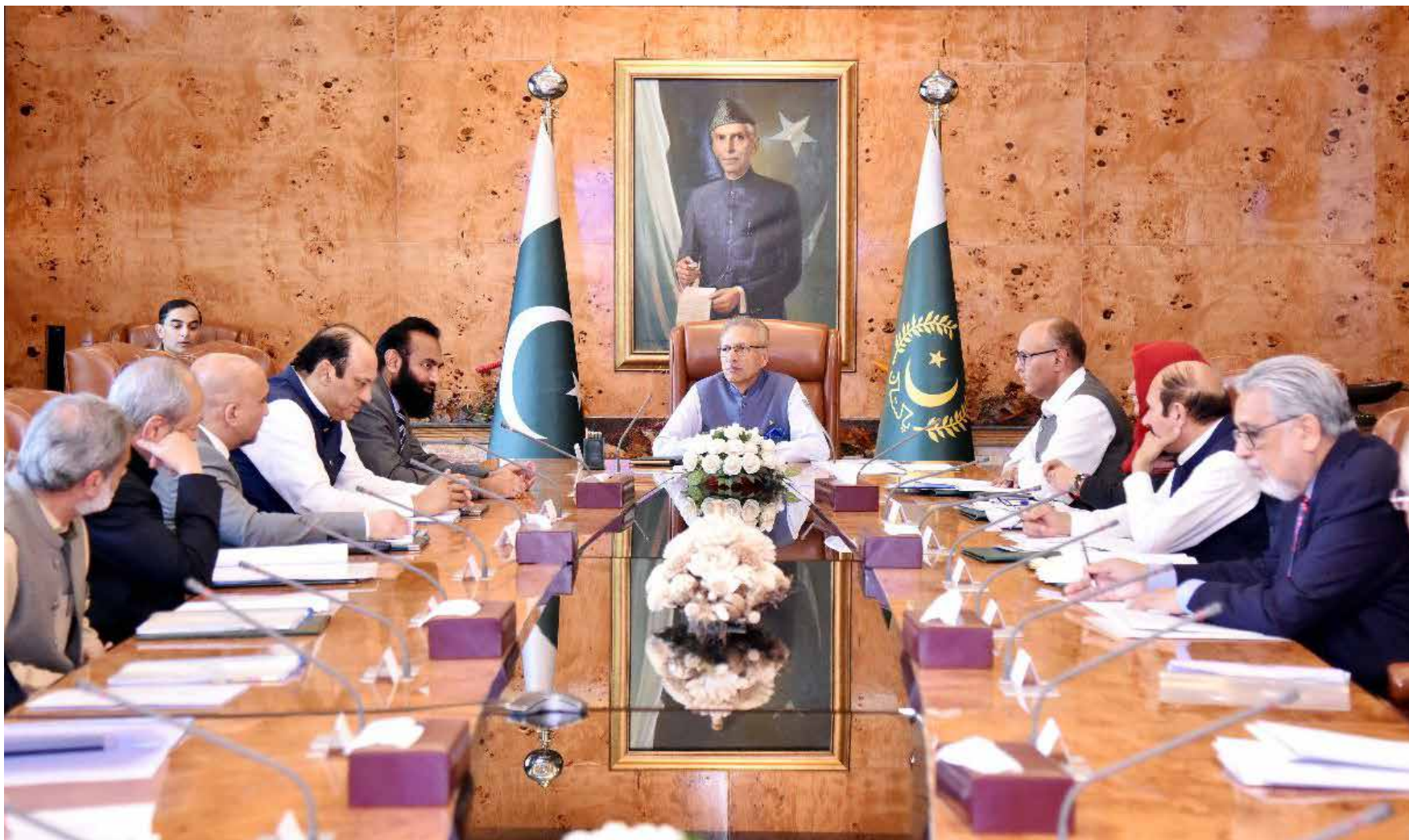
ISLAMABAD: President Dr Arif Alvi chairing the 4th meeting of the Senate of the Health Services Academy (HSA), at Aiwan-e-Sadr, Islamabad.—DNA

On the other hand, decrease was observed in the prices of tomatoes (14.96%), onions (12.66%), LPG (3.73%), pulse gram (1.20%), vegetable ghee 2.5 Kg (0.71%), garlic (0.16%) and mustard oil (0.03%). During the week, out of 51 items, prices of 27 (52.94%) items increased, 07 (13.73%) items decreased and 17 (33.33%) items remained stable. The year-on-year trend depicted an increase of 44.49%. The increase was witnessed in prices of cigarettes (165.88%), wheat flour (131.72%), gas charges for Q1 (108.38%), diesel (102.84%), eggs (98.34%), tea Lipton—DNA