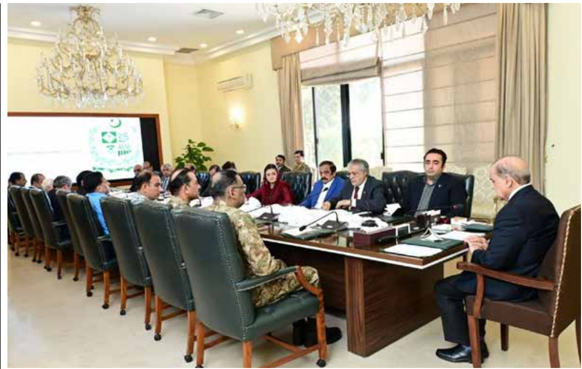
ISLAMABAD: Prime Minister chairs a meeting of National Security Committee.