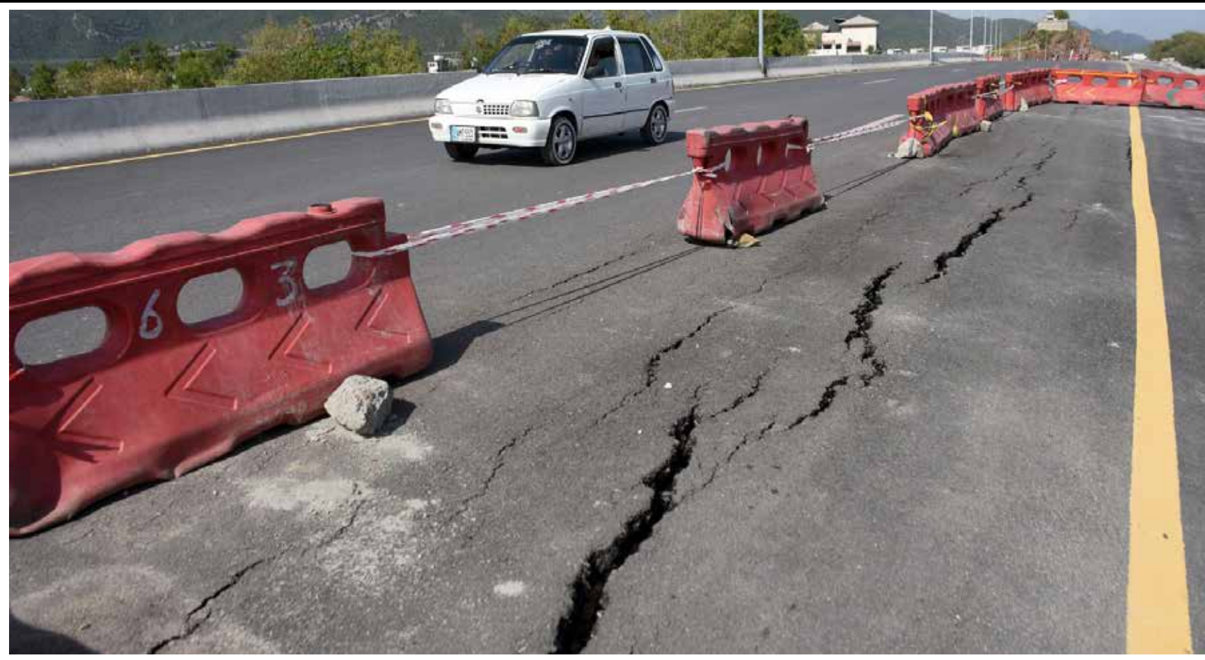
ISLAMABAD-April10: A view of cracks in the newly constructed Khayaban-e-Margalla Road as it is start destroying before opening properly for the traffic, which is the open sign of the usage of Low quality material during construction.