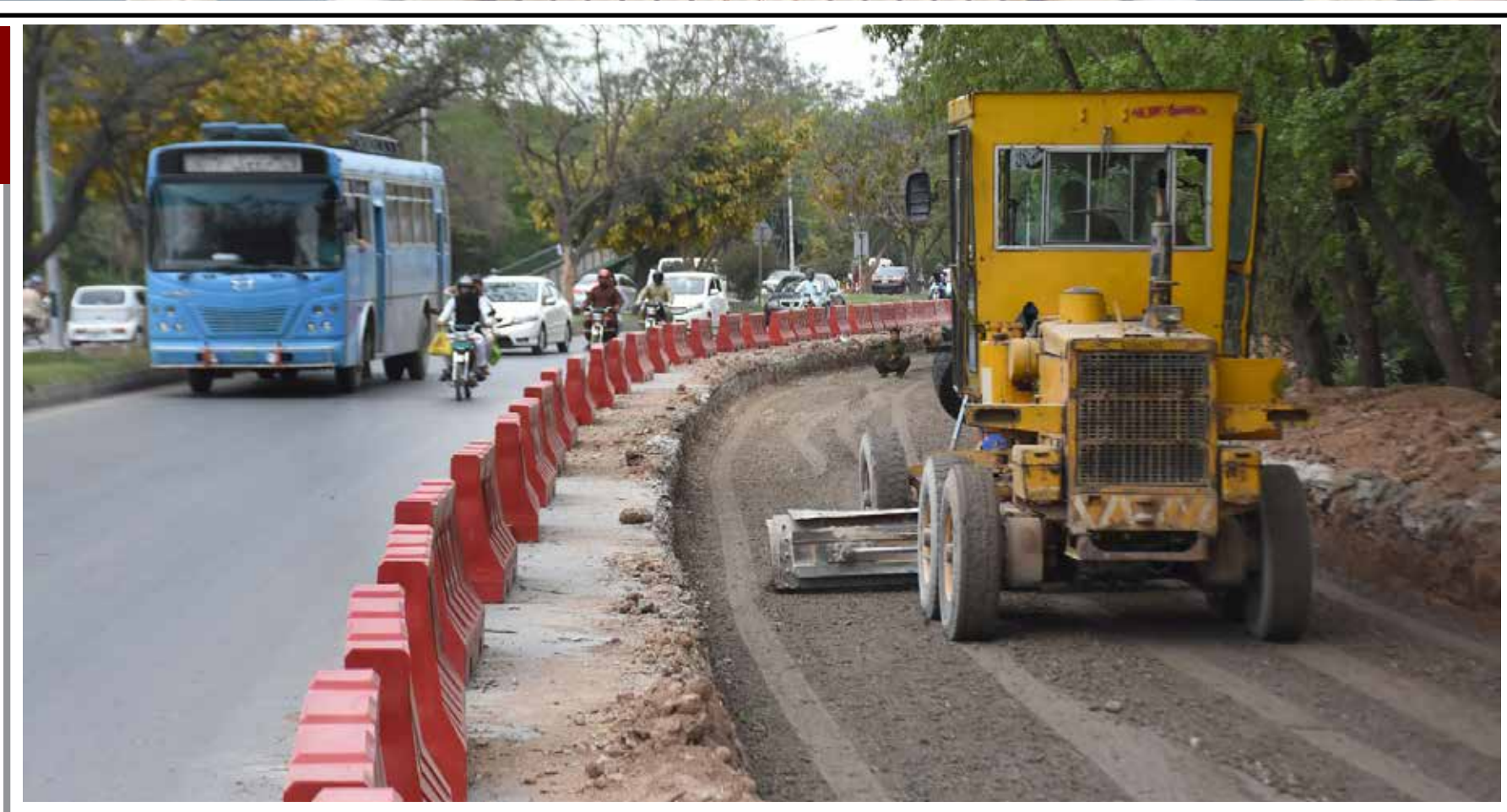
ISLAMABAD: Labourers busy in carpeting of Park Road, on Monday.