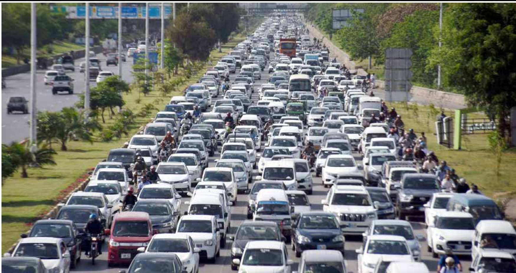
ISLAMABAD: April 19- A large number of the vehicles are stuck in massive traffic jam at Faisal Avenue as people are trying to reach home before Iftari, in Federal Capital.