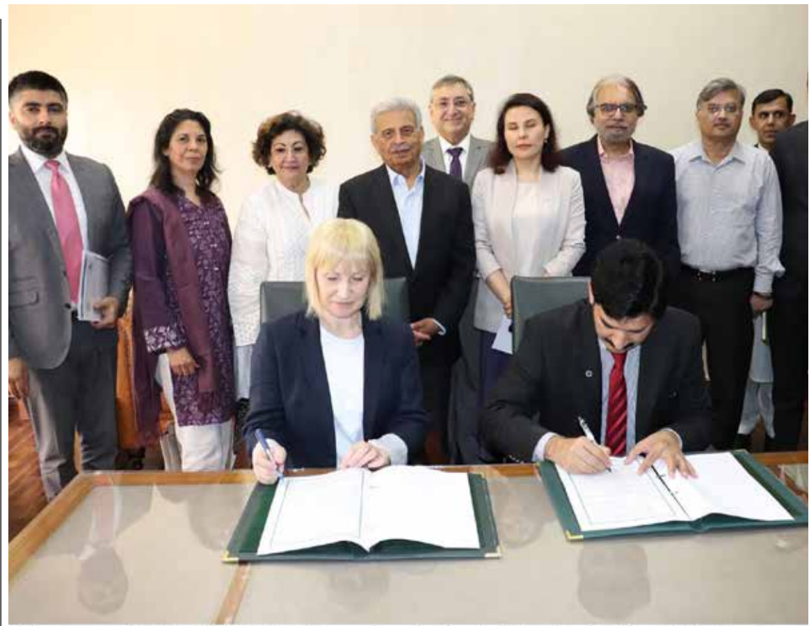
In the presence of Federal Minister Rana Tanveer Hussain, Russian Federation, Ministry of Education signed a MoU with Ministry of Federal Education and Professional Training for strengthening of long-term and constructive relationships in Education between both countries.