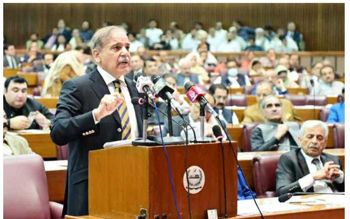
ISLAMABAD: Prime Minister Shehbaz Sharif addresses a session of National Assembly. - DNA

PM reiterates 'One China' policy in call to Li Qiang