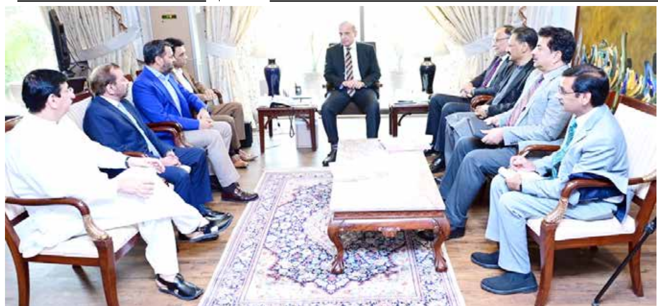
ISLAMABAD: Prime Minister Shehbaz Sharif in a meeting with a delegation of MQM-Pakistan.

ter and electricity. Communications have been sporadically disrupted. The UN said it "received reports of tens of thousands of people arriving in the Central African Republic, Chad, Egypt, Ethiopia and South Sudan". Foreign governments have taken advantage of the fragile truce to organise road convoys, flights and ships to get thousands of their citizens out of Sudan. But some have warned their evacuation efforts are dependent on the lull in fighting holding. China deployed warships on Thursday to evacuate its citizens.