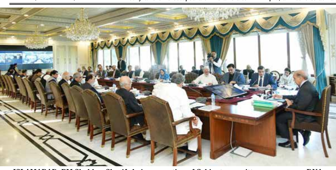
ISLAMABAD: PM Shehbaz Sharif chairs a meeting of Cabinet committee on energy. - DNA

"If we want to achieve zero deforestation by 2030, we need registered Indigenous reserves." Under four years of Bolsonaro, who had vowed to not cede "one more centimeter" of land to Brazil's Indigenous communities, average annual deforestation had increased by 75 percent compared to the previous decade. Bolsonaro instigated policies that favored the agriculture and logging industries, which are mostly responsible for deforestation. - APP