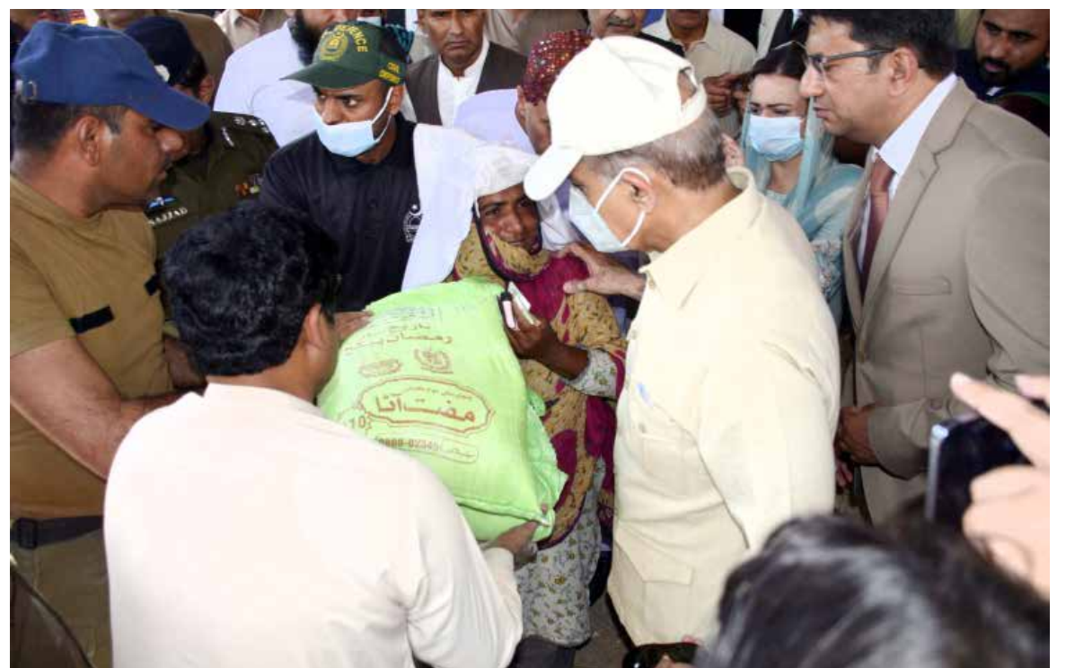
DERA GHAZI KHAN: Prime Minister Shehbaz Sharif visits Free Flour Distribution Point.

3 terrorists killed in Bajaur IBO: ISPR Milantants were killed on April 11 during an intense exchange of fire