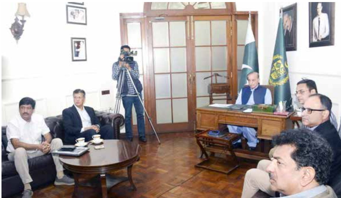
LAHORE: Prime Minister Shehbaz Sharif chairs a meeting to review countrywide wheat procurement drive.

ISLAMABAD: Former chief justice of Pakistan (CJP) Mian Saqib Nisar has expressed displeasure over Defence Minister Khawaja Asif's press conference, asking the PML-N leader "to stay within limits", media reported. In a statement, the former chief justice has lambasted Khawaja Asif and Pakistan Muslim League-Nawaz for "speaking lies", saying that these people will hide their faces if he starts speaking truth.