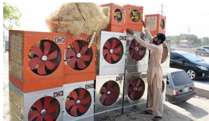
ISLAMABAD: A shopkeeper is displaying Room Air Coolers outside his shop along the IJP road, to attract customers as due to the increasing temperature the demands of such appliances are increased in Federal Capital.

ISLAMABAD: Chairman of Carpet Training Institute (CTI) Ijazur Rehman said that due to non-availability of government patronage and unfavorable conditions, Pakistan's traditional khadi finished products and hand-woven carpets industry is failing to capture its desired share of the over $30 billion global export trade. In a statement issued here on Sunday, Ijazur Rehman said these products have been the unique identity and heritage of Pakistan in the world that I why urgent steps are needed to rebuild it as a proud national industry. He said they invite the private sector to utilize the facilities available at the Carpet Training Institute under the Joint Venture and to promote employment opportunities through modernized Khadi. He further said that unfortunately, due to continuous neglect at the government level, this industry of handmade carpets of Pakistan is suffering from a severe condition.