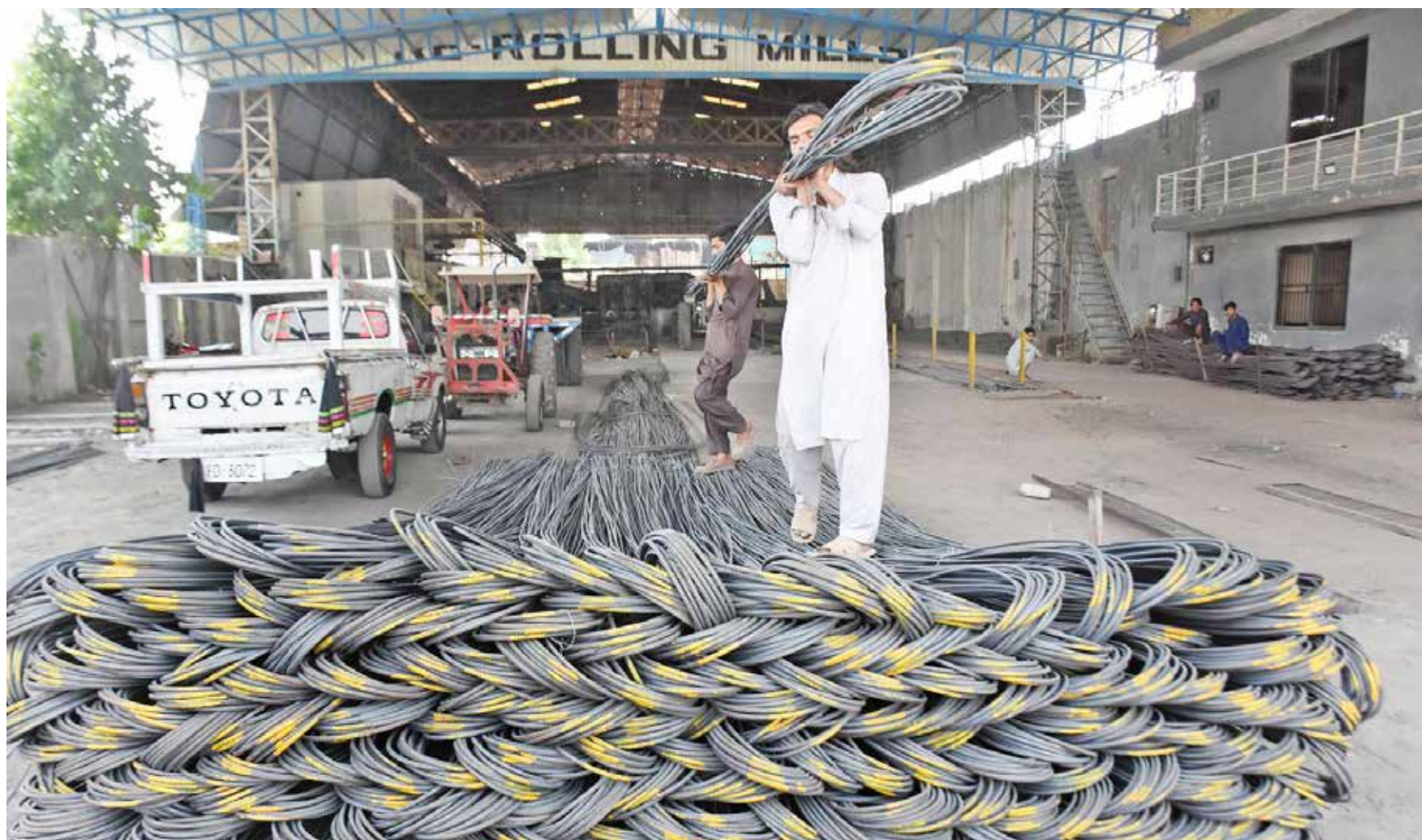
ISLAMABAD: Laborers are busy in their work at Steel Mill in Industrial area of Capital City, to earn daily wages for the livelihood of their families, unaware from the International Labor Day, Which is commemorating annually on 1st May, for the rights of Labor around the World.