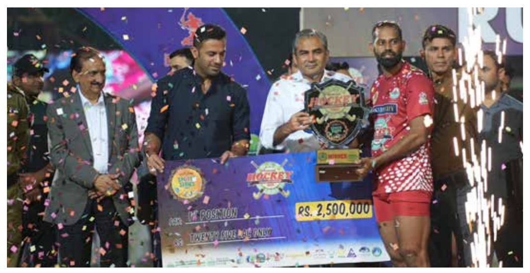
is supported and appreciated by the entire nation," he wrote. Lahore Division beat Faisalabad Gladiators in the final to lift the trophy. The win-