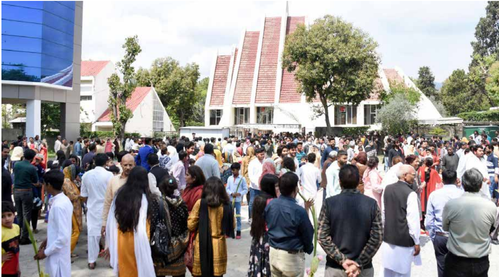
ISLAMABAD: A large number of the Christens devotees are attending procession to mark their religious event 'Palm Sunday' at Fatimah Church in Sector F-8 as it is a Christian moveable feast that falls on Sunday before Easter.

He also urged the legal community "to play a role in the country's history". The constitutional crisis in Pakistan deepened as the ruling coalition in the Centre, led by PML-N, hinted that it would not accept the decision of the three-member SC bench hearing the polls delay case. Shah Mahmood Qureshi claimed the PML-N leadership has decided to attack the Constitution, while Interior Minister Rana Sanaullah has hinted at directly attacking judges. The PML-N has accelerated its efforts to pressurize the Supreme Court of Pakistan, the PTI leader alleged, adding the PML-N is harassing judges in order to pressurize them.