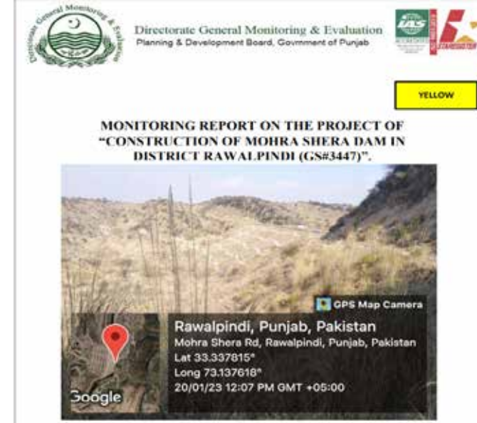
Construction is in progress of the dam started on 17th Jan, 2015 and is expected to be completed on 31st Dec, 2023.

To meet the shortage of water, small, madam and large dams are being constructed across the country by the federal government. Monitoring of development projects at the federal and provincial levels is ongoing to ensure that the construction of dams is being done according to the standards or not. Monitoring and evaluation Departments issue reports after monitoring. Through observations said that the construction of the development projects is being done according to the prescribed standards or the rules and regulations are being violated. MOHRA SHERA DAM Near Mohra SHERA village at about 20 Km South West of Mandra town Tehsil Gujar Khan District Rawalpindi.