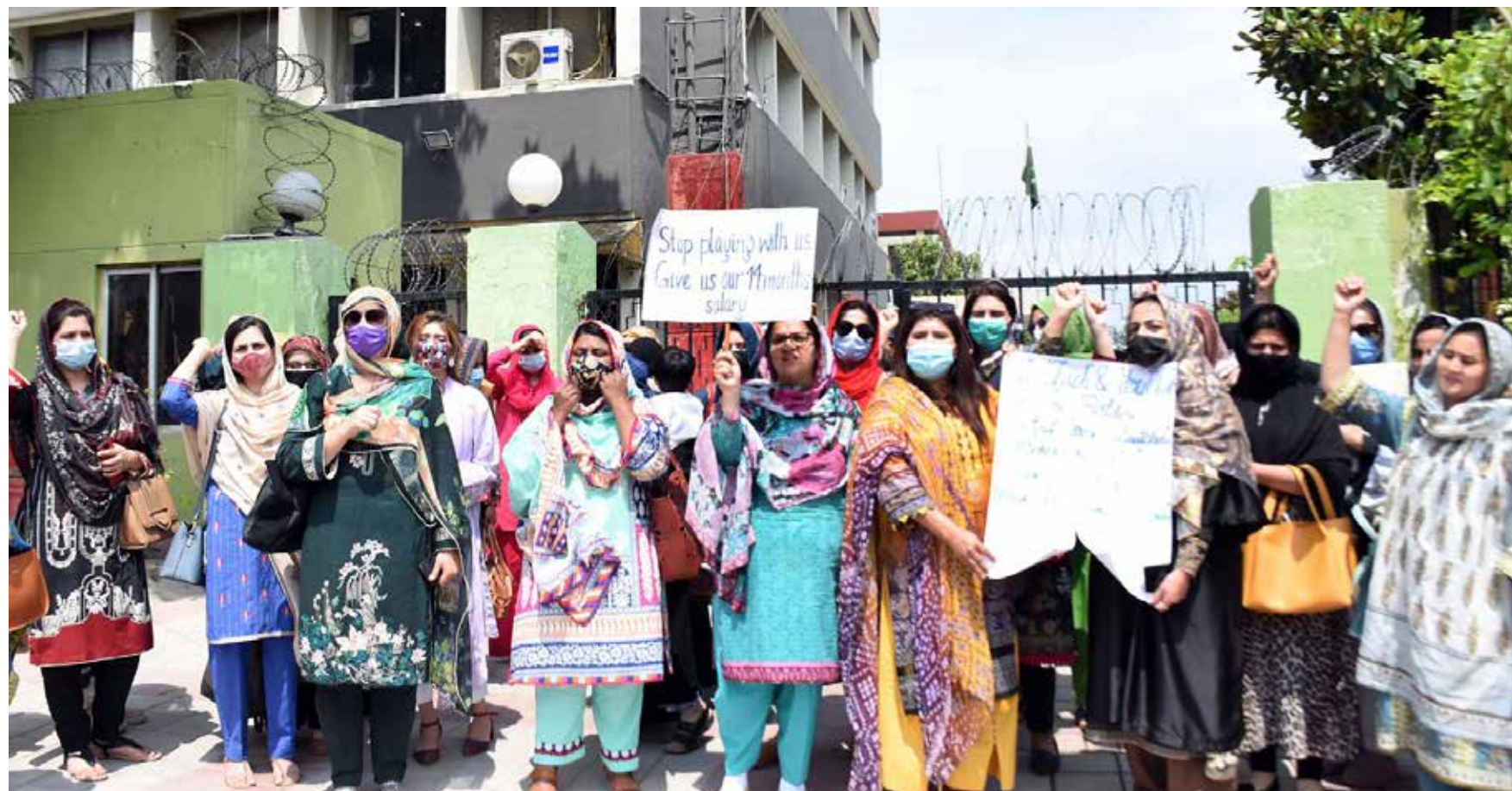
ISLAMABAD: May 02- Contract Base Female Teachers holds placards and shouting slogans during protest outside Federal Directorate of Education, for issuing of their salaries, which are pending from more than 11 months, in Federal Capital.