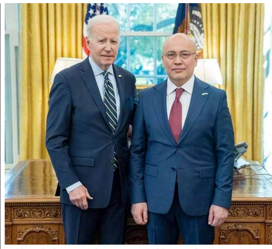
WASHINGTON: Uzbek Ambassador of USA Furqat Sidikov meeting with the US President Joe Biden after presenting his credentials. Ambassador Furqat has also served as Uzbek ambassador to Pakistan. Before his appointment as Ambassador to USA he was serving in the Ministry of Foreign Affairs as the First Deputy Minister of Foreign Affairs.