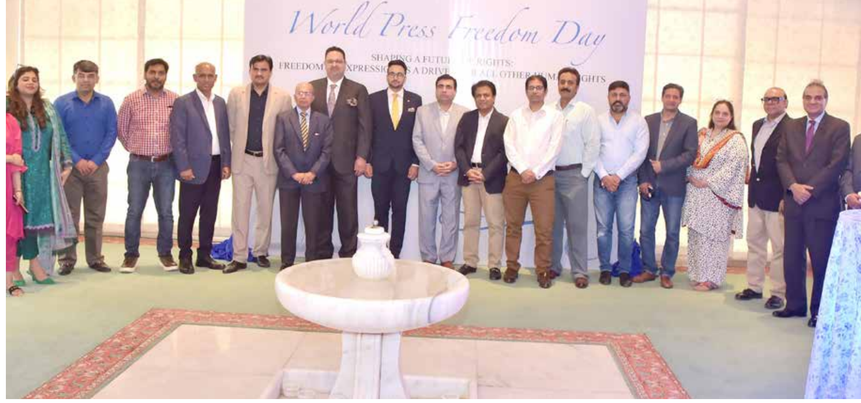
ISLAMABAD: Serena Hotels hosted a luncheon meeting with the senior journalists of Islamabad to mark the Press Freedom Day.