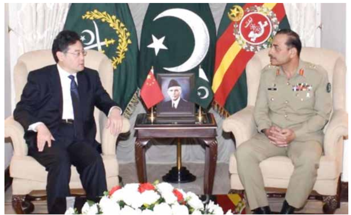
RAWALPINDI: General Syed Asim Munir, COAS in a meeting with Chinese State Councillor and Foreign Minister Qin Gang.