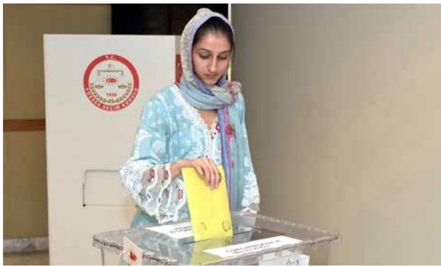
ISLAMABAD: Ambassador of Türkiye Mehmet Pacaci and Türkiye nationals living in Pakistan cast their votes in the Presidential election of Türkiye, at the Türkiye embassy in Islamabad.