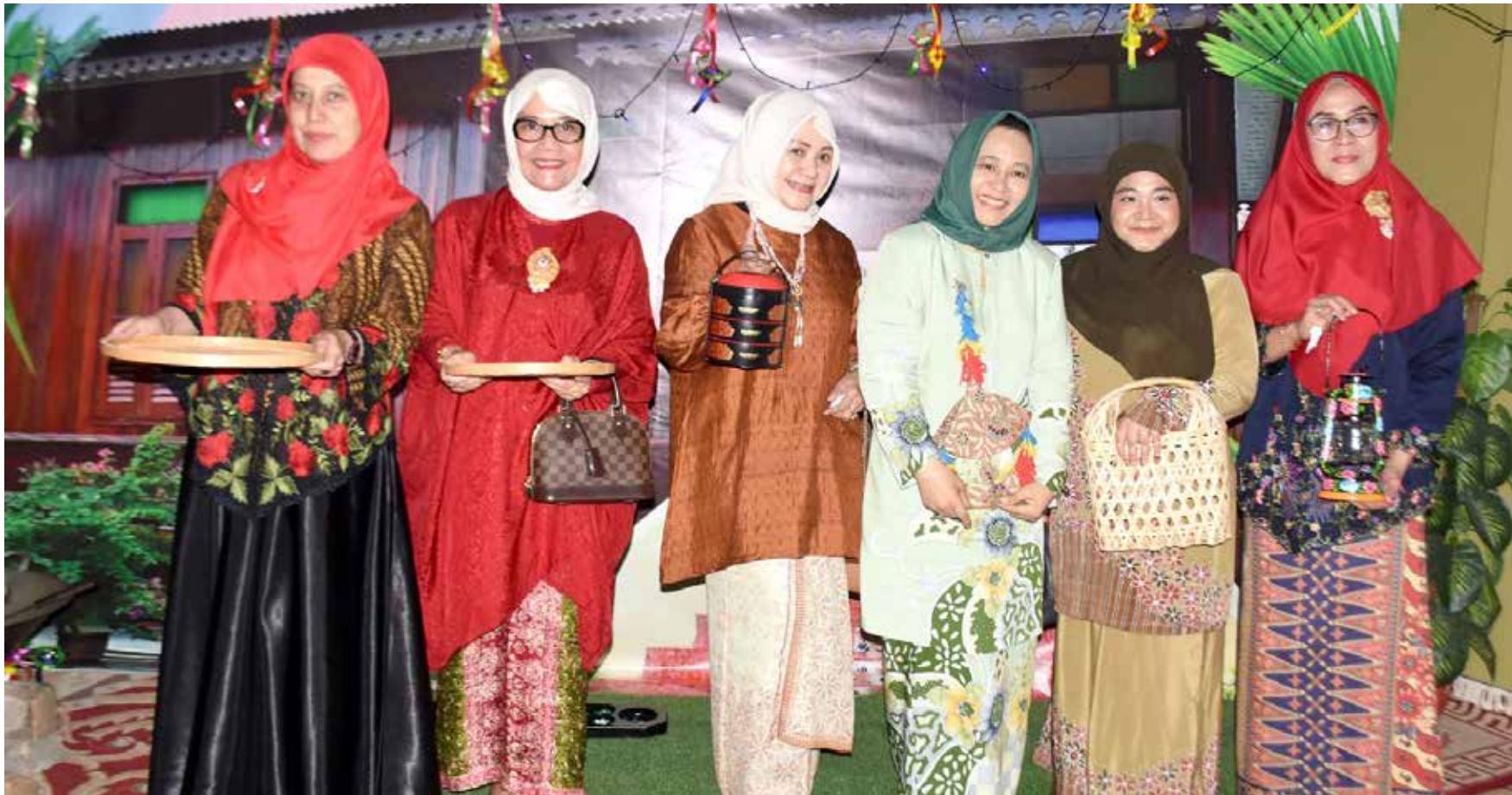
ISLAMABAD: Wives of the ASEAN countries diplomats posing for a picture on the occasion of the open house event organized by the Malaysian High Commission.