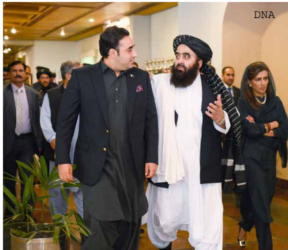
ISLAMABAD: Foreign Minister Bilawal Bhutto welcomes Afghan Foreign Minister at the Ministry of Foreign Affairs.