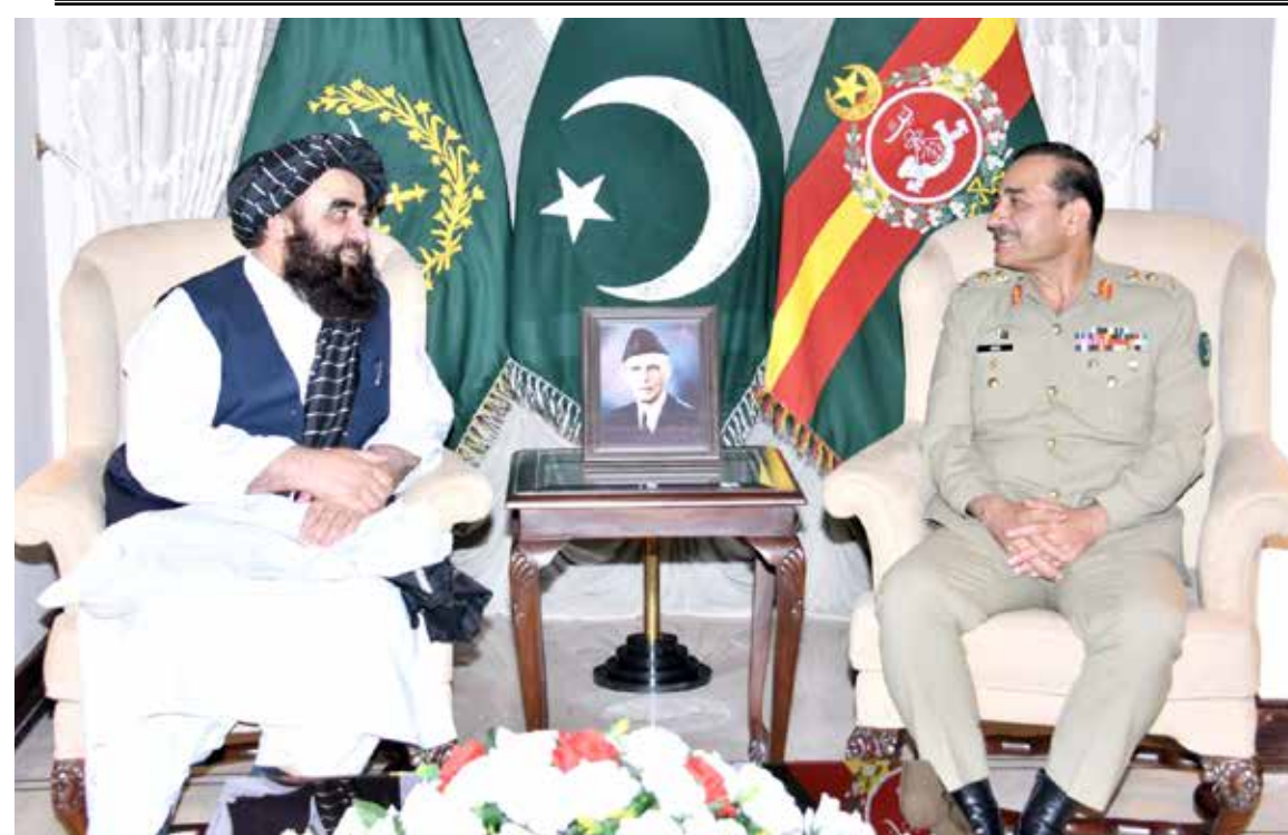
RAWALPINDI: Afghan Interim Foreign Minister Amir Khan Mutaqqi calls on Chief of Army Staff General Asim Munir. - DNA

NEW DELHI: At least 30 people have been killed in ethnic clashes in the north-eastern Indian state of Manipur, officials say. The violence began earlier this week after a rally by indigenous communities against moves to grant tribal status to the main ethnic group in the state. Mobs attacked homes, vehicles, churches, and temples. Some reports put the death toll as high as 54. Around 10,000 people have reportedly been displaced. Thousands of troops have been sent in to maintain order. A curfew is in place in several districts and internet access has been suspended. Neighbouring states have begun evacuating their students from Manipur, which is in India's northeast and close to the border with Myanmar. The army says it is bringing the situation under control but the Hindu-nationalist BJP-led government in the state has been accused of not doing enough to prevent the violence. Members of the Meitei community, who account for at least 50% of the state's population, have been demanding inclusion under the Scheduled Tribe category for years. India reserves government jobs, college admissions and elected seats at all levels of government for communities under this category to rectify historical wrongs that have denied them equal opportunities. This status would give the Meiteis access to forest lands and guarantee them a proportion of government jobs and places in educational institutions.