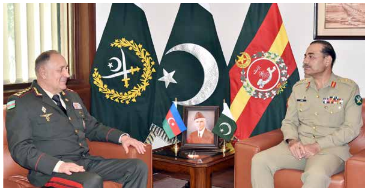
RAWALPINDI: Colonel General Karim Valiyev, 1st Deputy Minister of Defence of Republic of Azerbaijan and Chief of General Staff of Azerbaijan Army, calls on Chief of Army Staff (COAS) General Syed Asim Munir, at the GHQ, on Tuesday.