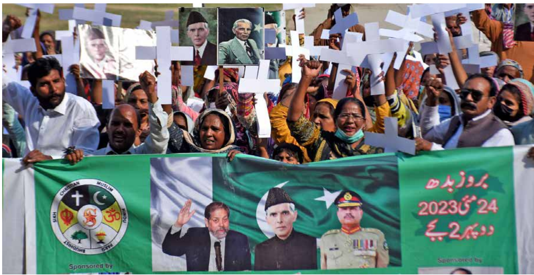
ISLAMABAD: Members of Christen Community holds rally at G-7 Markaz to show solidarity with Pak Army.

The additional amount will be received from KE consumers from May to July 2023. The NEPRA announced the decision on a petition filed by the federal government seeking equal tariff across the country.—DNA