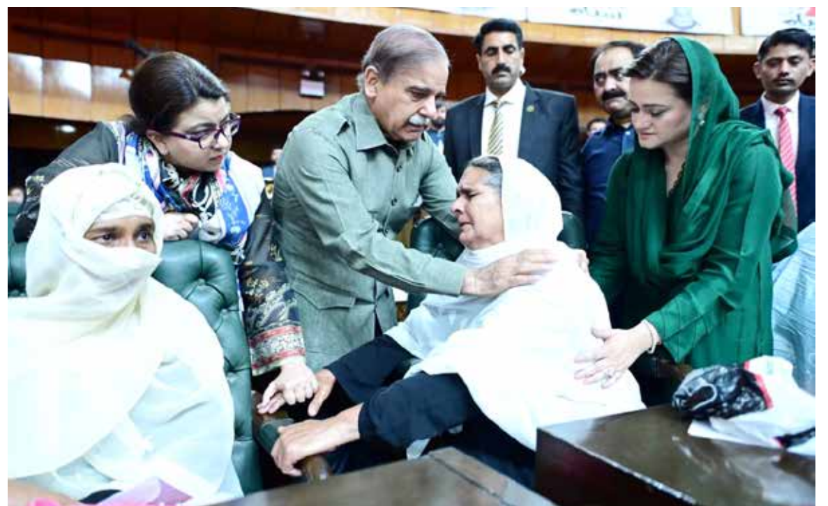
ISLAMABAD: Prime Minister Muhammad Shehbaz Sharif meeting the families of Shuhada at Azmat-e-Shuhada Convention. - DNA