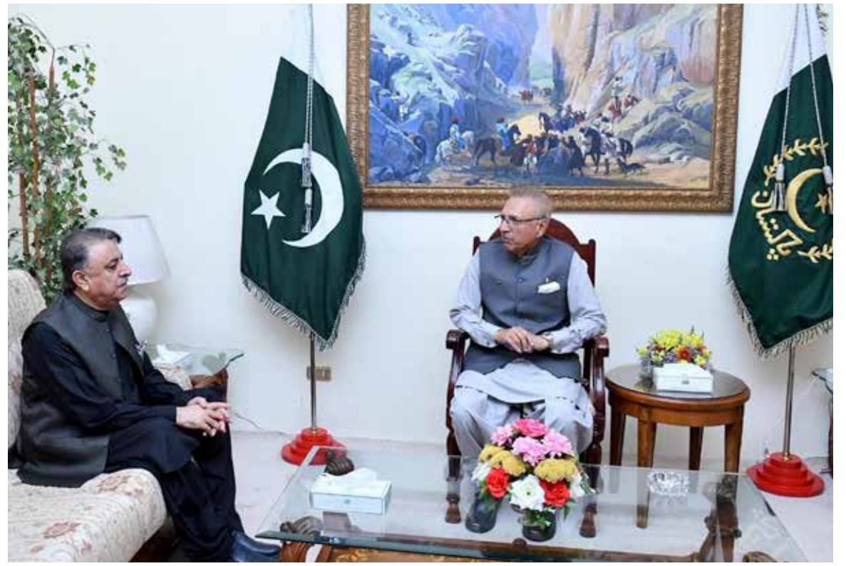
QUETTA: President Dr. Arif Alvi in a meeting with the Governor of Balochistan, Malik Abdul Wali Kakar, at Governor House, Quetta.