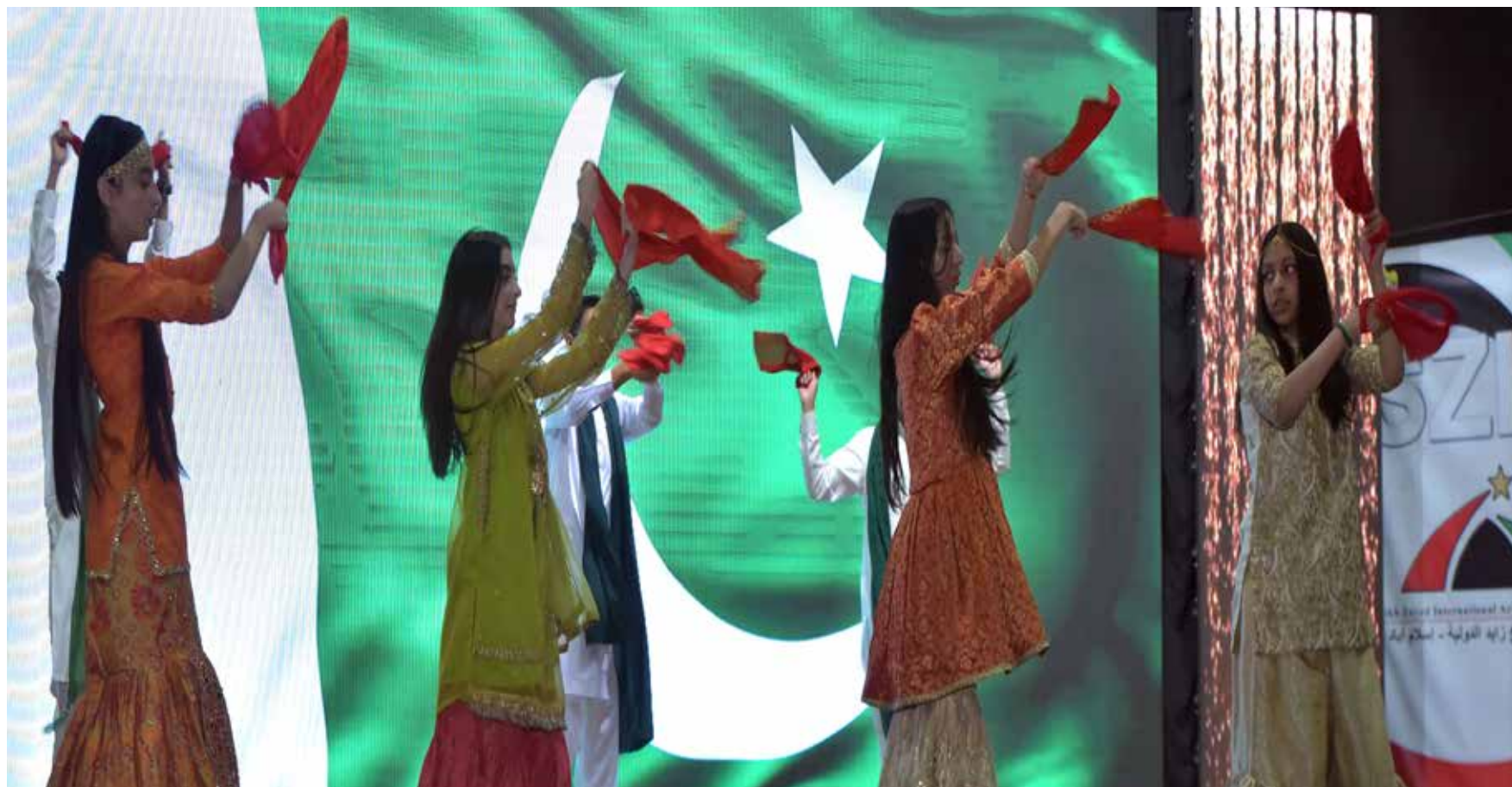
ISLAMABAD: Students perform during a cultural show on the occasion of prize distribution ceremony held at Sheikh Zayed International Academy.