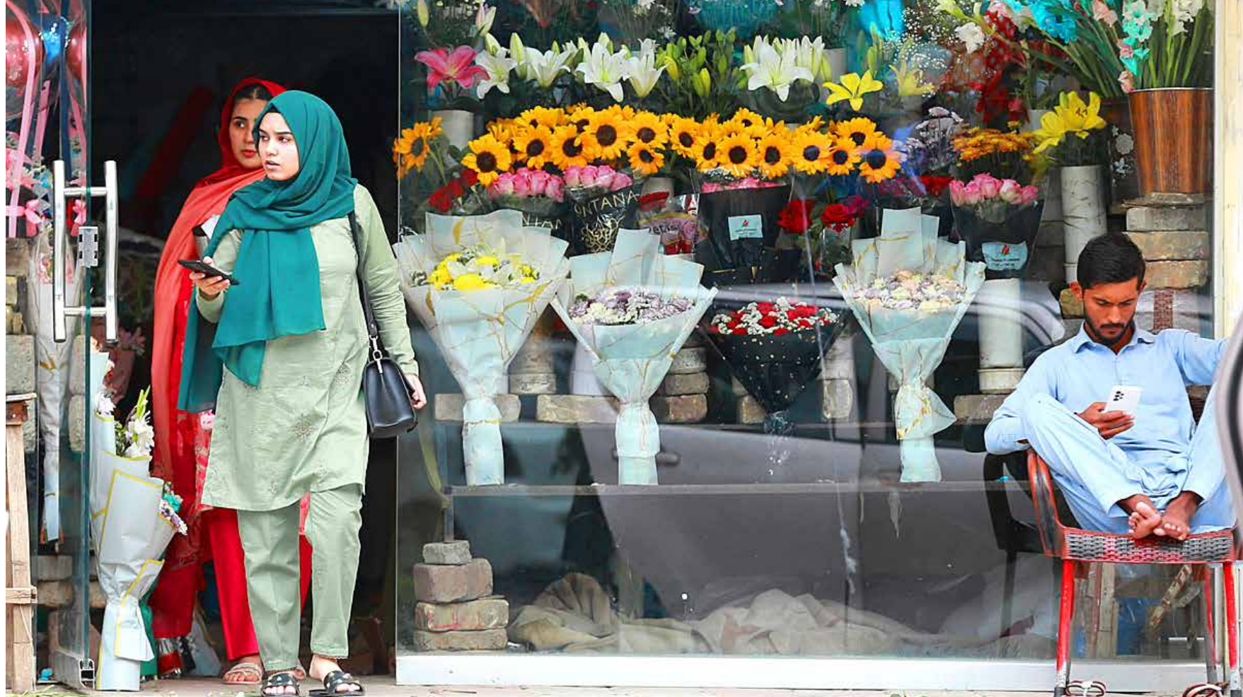
ISLAMABAD: A vendor displaying bouquet of flowers at his shop to attract customers at Jinnah Super Market.—APP

However, according to the Forex Association of Pakistan (FAP), the buying and selling rates of dollars in the open market stood at Rs313 and Rs316, respectively. The price of the Euro decreased by 97 paises to close at Rs305.02 against the last day's closing of Rs305.99, according to the State Bank of Pakistan (SBP). The Japanese Yen remained unchanged and closed at Rs2.03, whereas an increase of 38 paises was witnessed in the exchange rate of the British Pound, which traded at Rs352.58 as compared to its last day's closing of Rs352.20. The exchange rate of the Emirates Dirham and the Saudi Riyal came down by 03 paises and 02 paises to close at Rs77.69 and Rs76.08; respectively.—APP