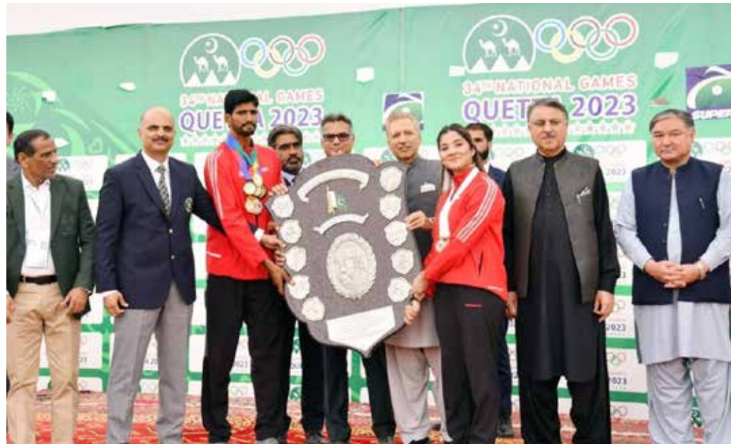
About Balochistan, the president said the province was rich with natural and mineral resources and commended all the governments for their efforts to utilize them for the progress and prosperity of the province. The president further stressed that for physical health, regular exercise and other sports

QUETTA: President Dr Arif Alvi on Tuesday said that sports activities always led to healthy competition by promoting discipline and character building, especially among the young people. Addressing the concluding ceremony of 34th National Games, the president said that by holding national sports event, a message was given to the entire world that Balochistan was a peaceful province. The president observed that different genres of games always helped in promotion of mental health, character building, team work, and healthy competition at different levels. He said Quaid e Azam and Fatima Jinnah always encouraged young people of the country to take part in healthy activities and stressed upon imbuing the spirit of unity, faith and discipline in all walks of life. Mohtarma Fatima Jinnah paid special focus on girls guide to strengthen the organizational discipline, he added.