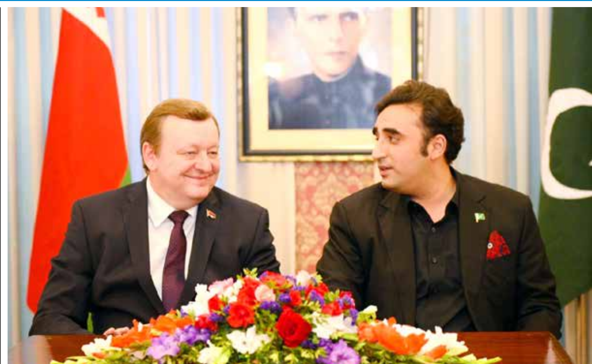
ISLAMABAD: Foreign Minister of Belarus Sergei Aleinik meets with Foreign Minister Bilawal Bhutto Zardari at the Foreign Office.