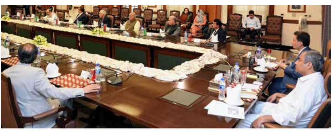
LAHORE: Interim Chief Minister Punjab, Mohsin Nagvi and Chief Election Commissioner Sikandar Sultan Raja presiding over a briefing session about the May 9 incidents at the CM Office.

The minister said that Qatari citizens would be provided visa facility on arrival in Pakistan. The two countries agreed to continue full cooperation to deal with internal and security challenges. The minister said there was an eternal relationship of trust between the people of the two countries and he thanked Qatar for financial assistance to flood victims in Pakistan during Geneva conference. He said that Qatar had always supported Pakistan and expressed his best wishes for the Emir of Qatar. The ambassador expressed special thanks to Pakistan for the security arrangements provided in the football World Cup.-APP