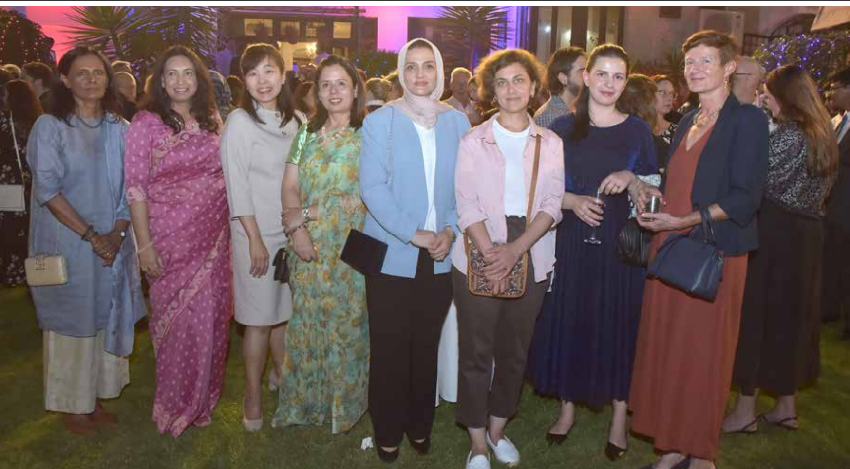
ISLAMABAD: Wives of diplomats posing for a picture on the occasion of the Constitution Day reception of Norway.