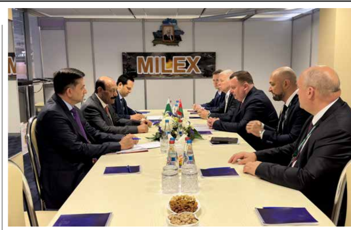
MINSK: Pakistan Minister of Defense Production, Muhammad Israr Tareen and Belarusian Minister of State Authority for Military Industry holds a productive meeting at #Milex2023 in Minsk. Both Sides discussed current military cooperation and outlined steps for future collaborations.- DNA

ness in the Indo-Pacific region, as well as confirming the importance of the Taiwan Strait for global peace and stability. – APP