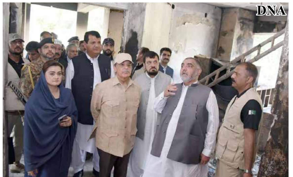
PESHAWAR: Prime Minister Muhammad Shehbaz Sharif visits the building of Radio Pakistan, which was burnt during May 09 incidents.

Membership of Kayani, Mazari others terminated