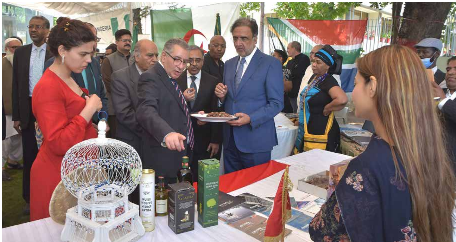
ISLAMABAD: Adviser to Prime Minister on Kashmir Affairs Qamar Zaman Kaira tastes Tunisian cuisines at the Tunisian staff on the occasion of the Africa Day celebrations.