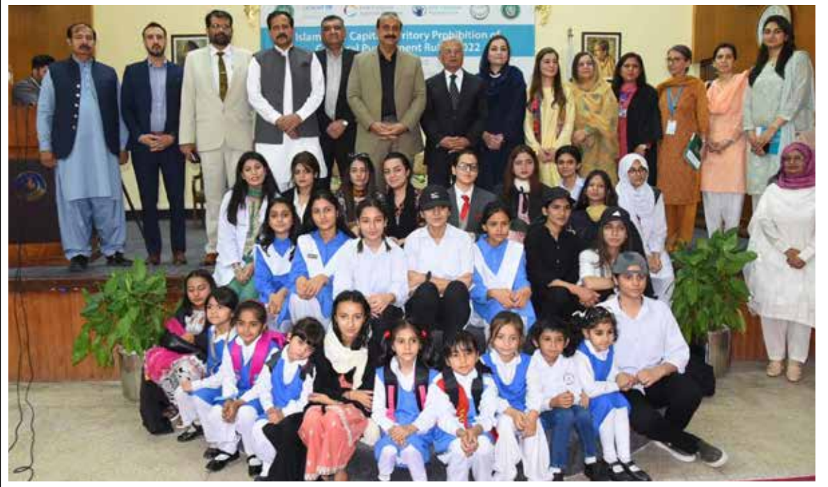
ISLAMABAD: The Ministry of Federal Education and Professional Training, Ministry of Law & Justice, Parliamentary Caucus on Child Rights, and UNICEF Pakistan came together in a momentous collaboration to successfully launch the "Islamabad Capital Territory Prohibition of Corporal Punishment Rules, 2022.