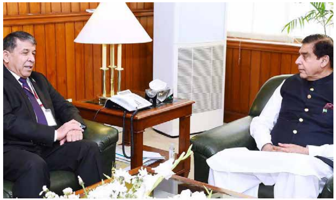
ISLAMABAD : Deputy Chairman of Majlis Oli of the Republic of Tajikistan calls on Speaker National Assembly Raja Pervez Ashraf at Parliament House.

made by prominent parliamentarians on the floor of the house was also displayed. The Constitution was included in the educational curriculum to educate youth about the importance, role and rights guaranteed by it. A wall of unsung heroes of democracy was inaugurated by Foreign Minister Bilawal Bhutto Zardari to commemorate the role, and the fight of people to preserve, further and restore democracy in Pakistan. A monument was also inaugurated at the Constitution Avenue to commemorate the golden jubilee of the Constitution. The Old Assembly Hall at the State Bank building was declared as a national heritage on April 10 this year. Exhibition of historic milestones, speeches and newspaper articles from Dawn and Jang newspapers from 1973 were also displayed at the Parliament.