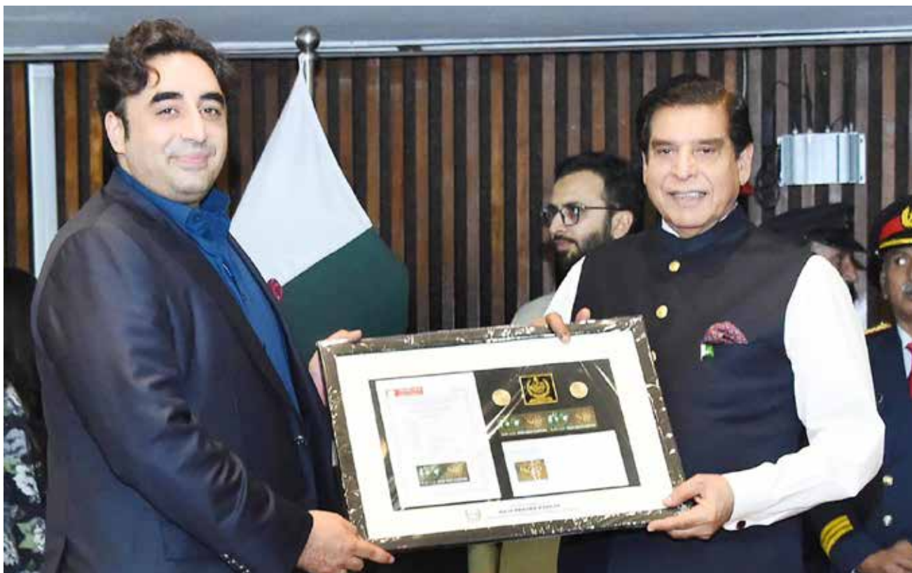
ISLAMABAD: Speaker National Assembly Raja Pervaiz Ashraf presenting Commemorative Stamp and Coin to Federal Minister of Foreign Affairs Bilawal Bhutto Zardari at Parliament House.