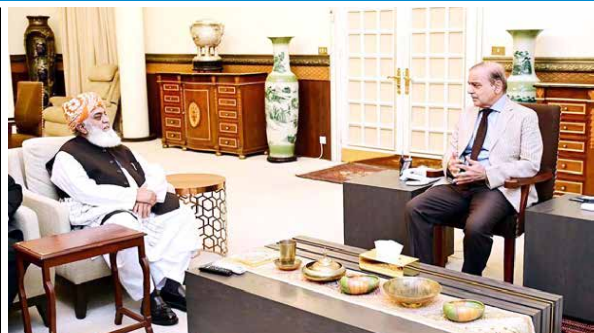
ISLAMABAD: JUI Chief Maulana Fazal Ur Rehman calls on Prime Minister Shehbaz Sharif. Both leaders discussed prevailing political situation.

Bilawal urges PTI to forgo violence PPP against arrests of politicians