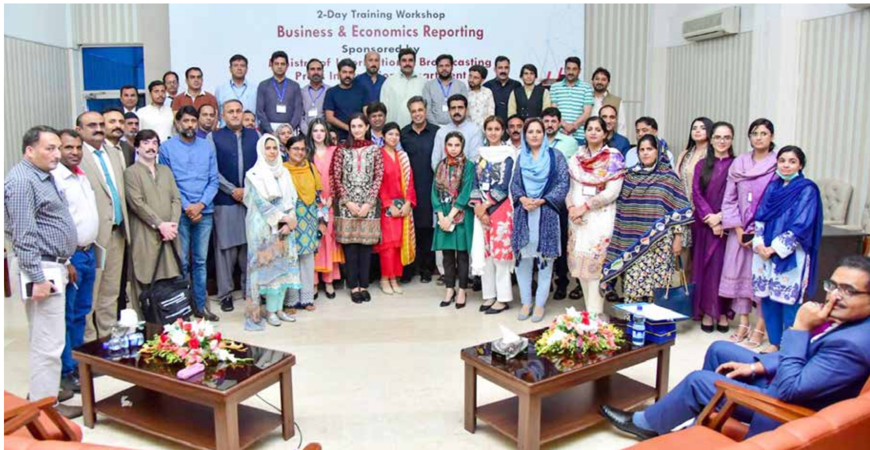
ISLAMABAD: A two-day Training workshop on Business and Economics Reporting under the aegis of Pakistan Information Center (PIC) a project of Press Information Department (PID) Islamabad.

General (R) Janjua said the 21st century belonged to the Asia region that was home to 59.36 percent of the global population, with consumer markets, human resource, natural resources, development scope and connectivity potential. He mentioned that as per global reports, by 2030 the United States' economy would lag behind China which would be leading the world. "China is the second largest economy of the world and possesses maximum foreign currency reserves with the largest trade volume in the world." The US, he said, in that situation had to meet a triple crisis comprising its economy buildup and maintenance against China, mitigating all its challenges and retaining a reliable superpower status. He proposed that Asian countries, particularly Pakistan, should reimagine their security cooperation in the prevailing scenario.—Agencies