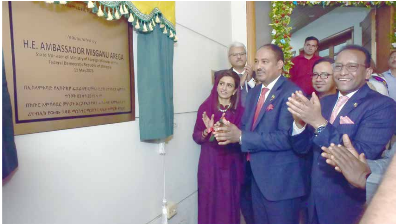
ISLAMABAD: State Minister for Foreign Affairs Hina Rabbani Khar, State Minister for Foreign Affairs of Ethiopia Ambassador Misganu Arega, Ambassador of Ethiopia to Pakistan Jemal Beker and others inaugurating the Ethiopian embassy in Islamabad.

She lauded the services of a new Ethiopian ambassador in Islamabad Jemal Beker Abdula, who made a mark in his short eight months. In his remarks, Ethiopian Minister of State for Foreign Affairs Mesganu Arega said that the opening of the Ethiopian Embassy marked a new history in the diplomatic, political, economic, and social cooperation between the two countries. He said the commencement of Ethiopian Airlines flight to Karachi would connect Pakistan with the "Land of Or-