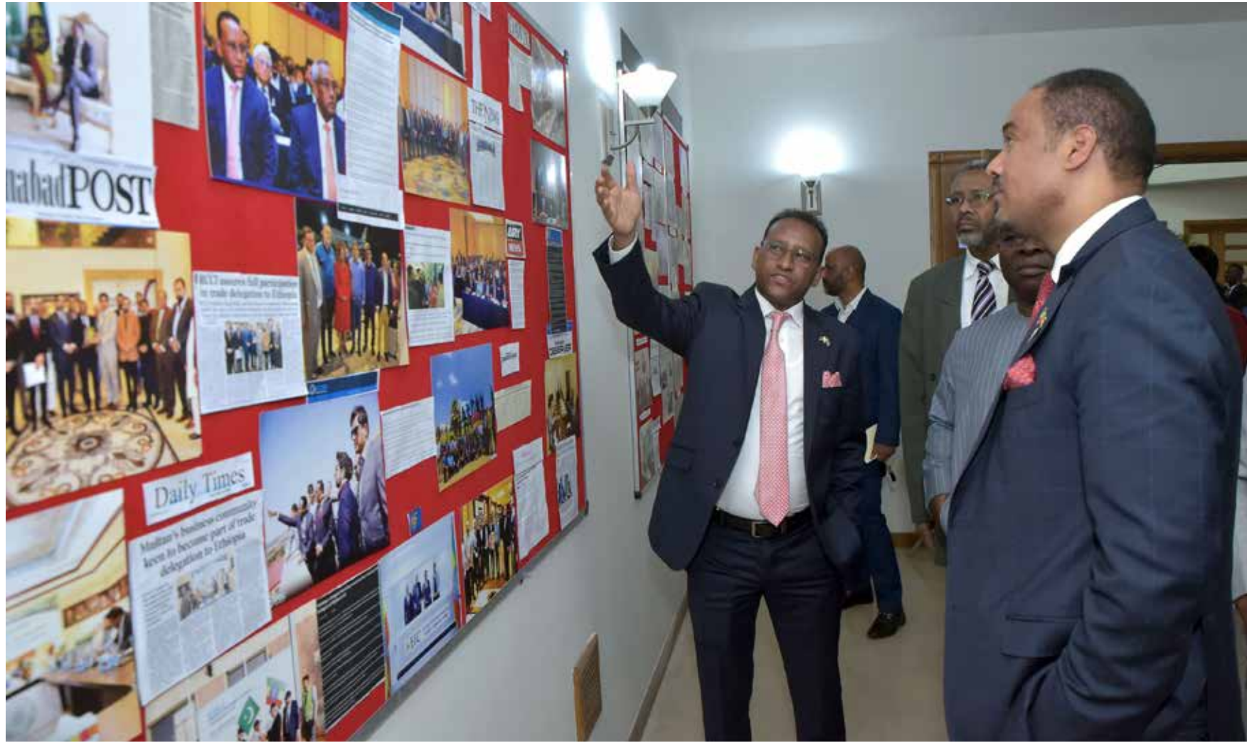
ISLAMABAD: State Minister of Foreign Affairs of Ethiopia Ambassador Misganu Arega witnesses coverage of the Ethiopian embassy event in various newspapers, on the occasion of the formal inauguration of the Ethiopian Embassy in Islamabad.—DNA

In a series of tweets, she lambasted the PTI leadership for triggering violence across the country after the arrest of its party chairman. Senator Rehman said the leadership of PTI could have controlled the violent protests in time, but it was a pity that the violence of the agitating workers was not even condemned. She added that the PTI leadership told the violent protesters to "set fire, burn, break up" but later showed indifference to the violent activists instead of stopping them. "Systematic attacks on sensitive institutions, public and private properties. This was not the reaction of a political party at all.—APP