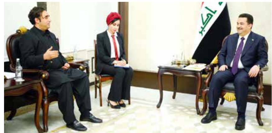
BAGHDAD: FM Bilawal Bhutto Zardari called on PM of Iraq Mohammed Shia Al Sudani and conveyed best wishes to the leadership and people of Iraq. They agreed to further strengthen multidimensional cooperation and to further cement brotherly ties between Pakistan and Iraq.

BAGHDAD: Pakistan and Iraq have resolved to take bilateral ties "to new heights and expand cooperation in diverse areas", said Foreign Minister Bilawal-Bhutto Zardari after his meeting with Iraqi President Abdul Latif Rashid on Monday. "Today, I called on HE Dr Abdul Latif Jamal, president of Iraq. Resolved to take Pakistan and Iraq relations to new heights and expand cooperation in diverse areas,