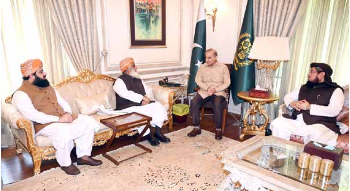
ISLAMABAD: JUI-F President Molana Fazlur Rehman calls on Prime Minister Shehbaz Sharif.