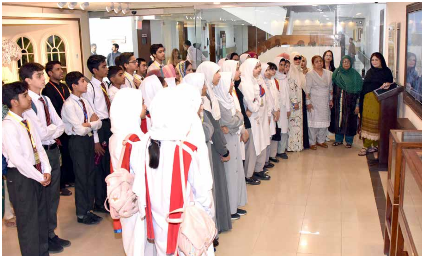
ISLAMABAD: Students of the international Islamic University Schools, I-8 Campus, Islamabad visiting Senate Museum at Parliament House.—DNA

ISLAMABAD: Pakistan Railways has generated revenue worth Rs. 5,269,315 through utilizing its 23 saloons and inspection coaches for commercial purposes, during the last three years (2020-22). "At present Pakistan Railways has only 23 saloons and inspection coaches with different dignitaries of the country who are entitled to use these saloons when needed," an official in the Ministry of Railways told APP. Giving the details of the saloons, he said that two highly luxurious coaches have been allocated for the Prime Minister's Secretariat while four coaches have been allocated for the Minister for Railways, Secretary/Chairman of Railways and another senior official in the Ministry. The official said only one saloon has been allocated to the federal government while one saloon each has been allocated to the Governors of Sindh, Balochistan, Punjab and the provincial governments.—APP