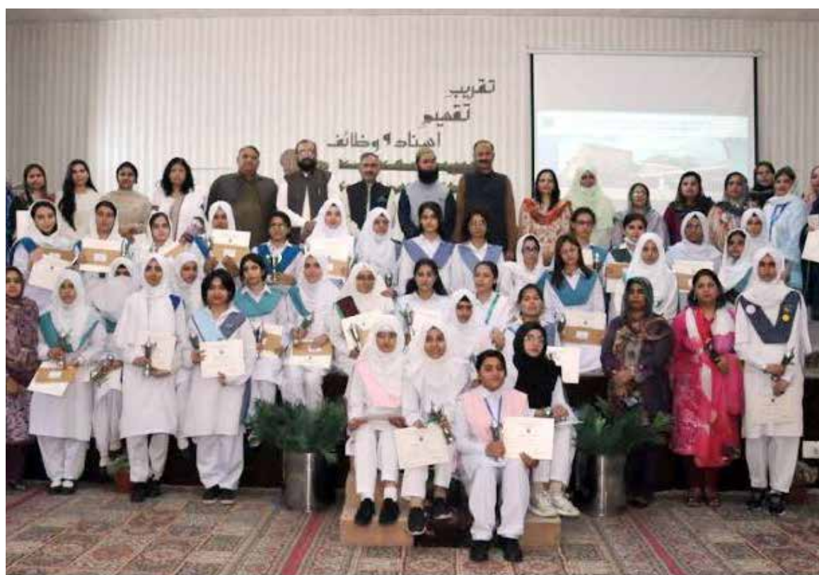
ISLAMABAD: Students along with their college staff posing for a camera shot on the occasion of certificate distribution ceremony organized at a girls college, on Monday.