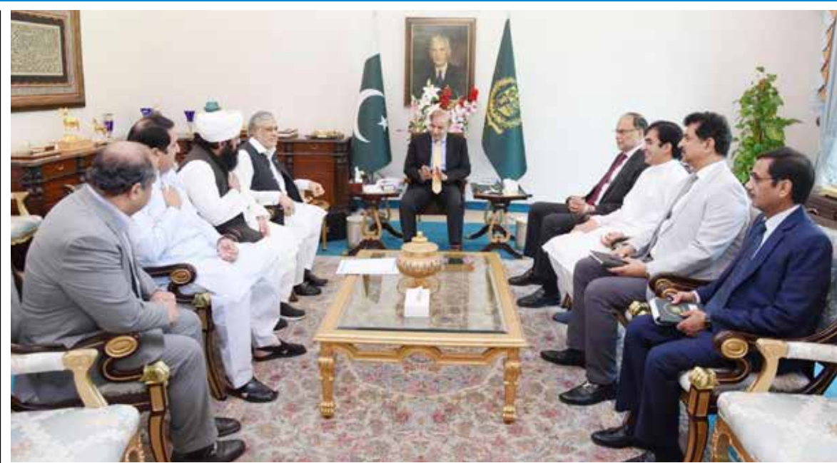
ISLAMABAD: A delegation of MNAs from KP merged districts call on Prime Minister. – DNA