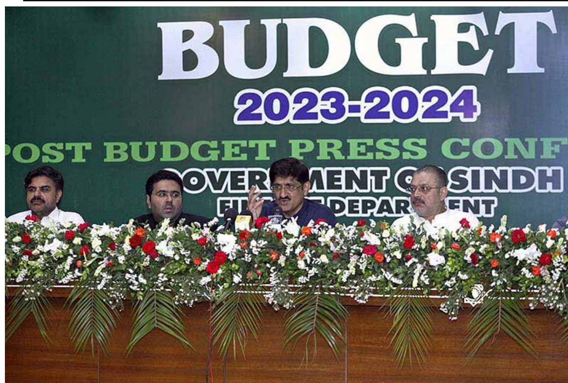
KARACHI: Sindh Chief Minister Syed Murad Ali Shah holding a post-budget press conference at the Sindh Assembly's auditorium. —APP

CAIRO: Egypt has announced a new policy requiring all citizens of neighbouring Sudan to obtain visas before crossing the border as a United States and Saudi Arabia-brokered ceasefire took effect in the Sudanese capital, Khartoum. The Egyptian foreign ministry imposed the new regulations on Saturday, justifying the move as a crackdown on "illegal activities" including fraud. The decision was a reversal of a longstanding exemption for children, women and elderly men. More than 200,000 Sudanese nationals have entered Egypt, most of them through land crossings, since fighting broke out two months ago between the army, led by General Abdel Fattah al-Burhan, and the paramilitary Rapid Support Forces (RSF), commanded by Burhan's former deputy Mohamed Hamdan Daglo.—APP