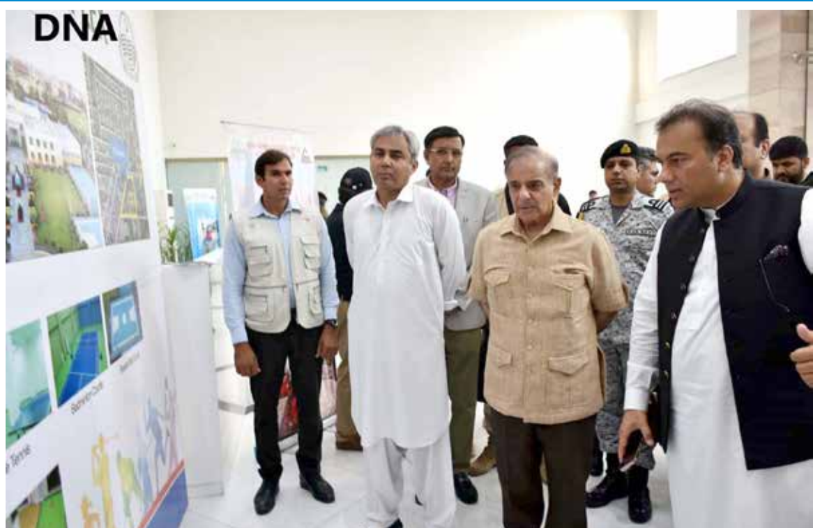
LAHORE: Prime Minister Shehbaz Sharif being briefed about Sabzazar Sports Complex.