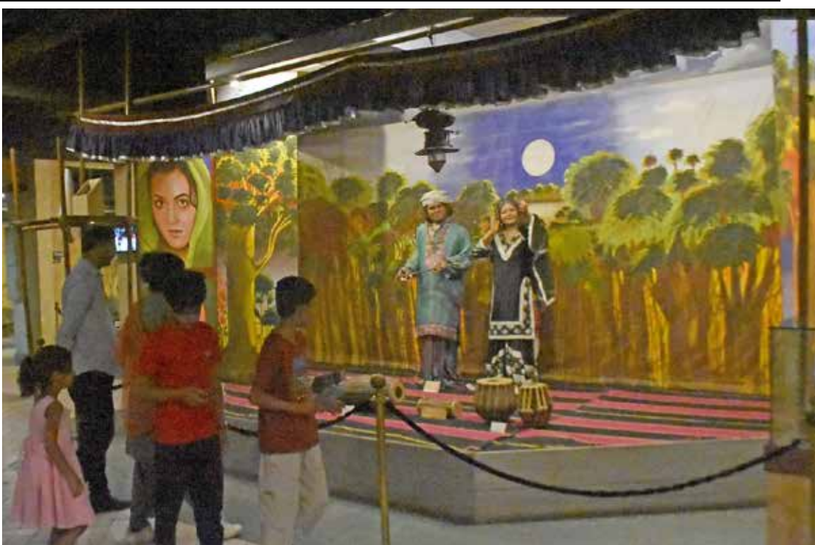
ISLAMABAD: Youngsters are taking interest in different traditional monuments of Pakistan's Culture, at Lok Versa Museum as the museum consists of several buildings as well as an outdoor museum which can accommodate up to 3000 visitors.