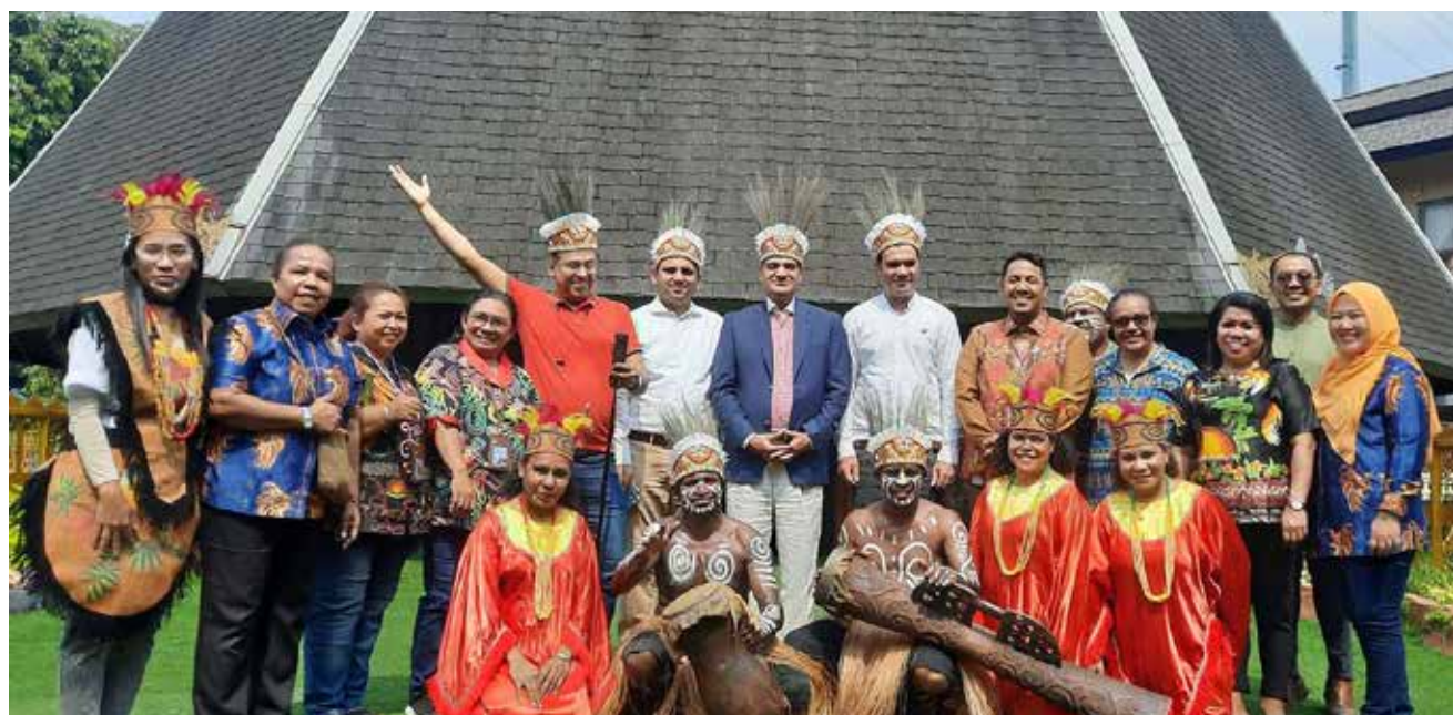
JAKARTA: Members of the Pakistani media delegation posing for a picture with the natives of the Papua region after the cultural performance, at Taman Mini.

ing and impressive. It is accurate to say that those who have not visited Taman Mini have visited nothing!!