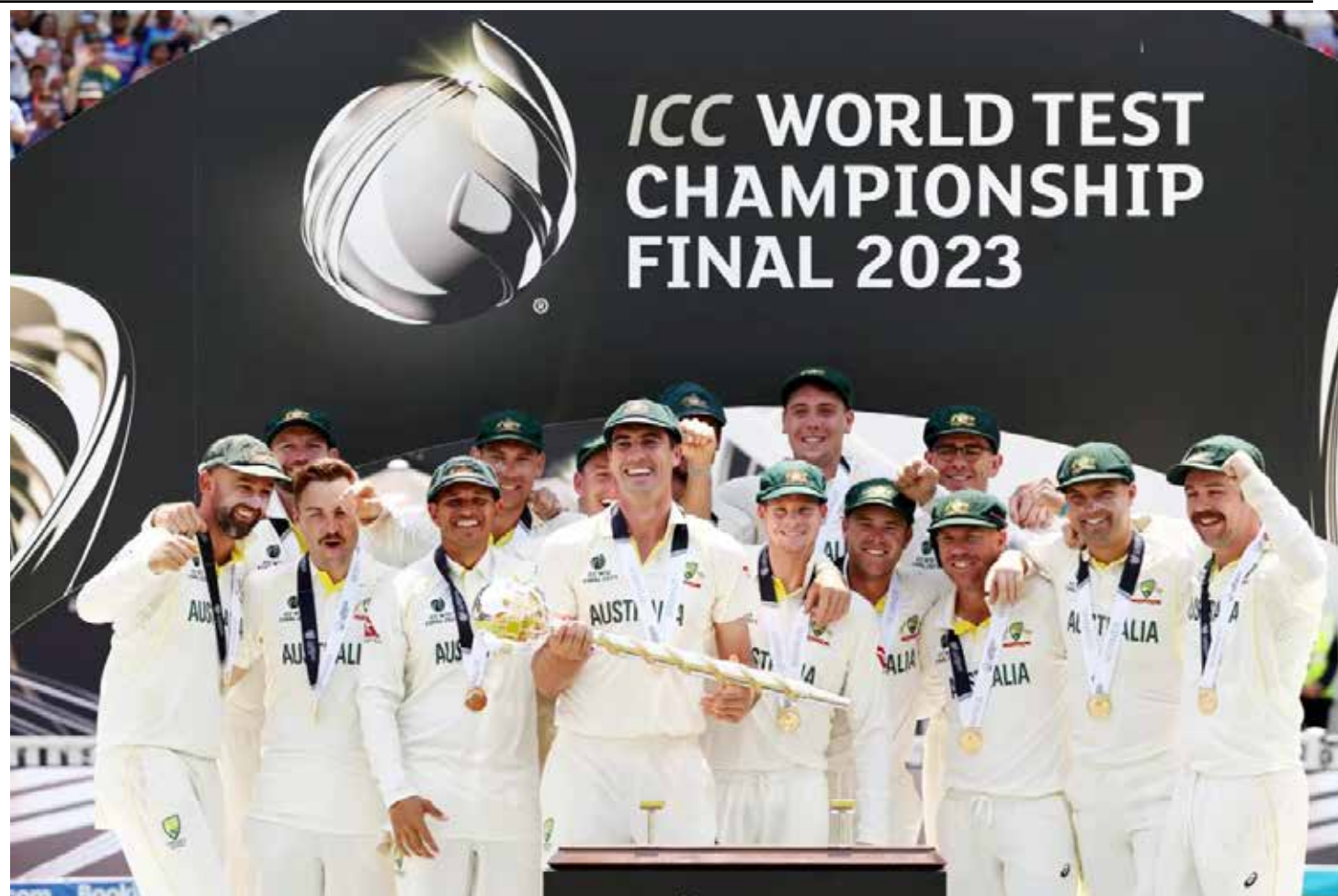
LONDON: Victorious Australian players celebrating after winning the World Test Championship final against India.

LONDON: England pacer Stuart Broad believes that his fellow seamer James Anderson is still addicted to cricket at 40 and only getting better with age. The duo is likely to play a key role for England in the upcoming Ashes, which begins on June 16 at Edgbaston. Anderson is England's top wicket-taker in red-ball cricket with 685 wickets and became the oldest player to top the ICC Test rankings earlier this year. "Jimmy's incredibly competitive. That's his number one strength," Broad said on the Legends of the Ashes podcast, a 10-part series from Global launching on June 15. "He's probably the most competitive person I've seen bar Jos Buttler in any sport that he plays. But he's very driven. He's an addict to cricket, to be honest. He's an addict to training, an addict to getting better, improving all the time. — Agencies