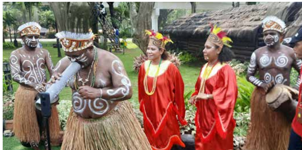
JAKARTA: Natives from Papua region presenting a special performance for the Pakistani media delegation.

The Pakistan media delegation comprising senior journalists and a Vlogger is currently on a visit to Indonesia as part of the Indonesia Embassy Familiarization trip organized in collaboration with the Ministry of Tourism of Indonesia. FAMTRIP is a regular feature of the Indonesian