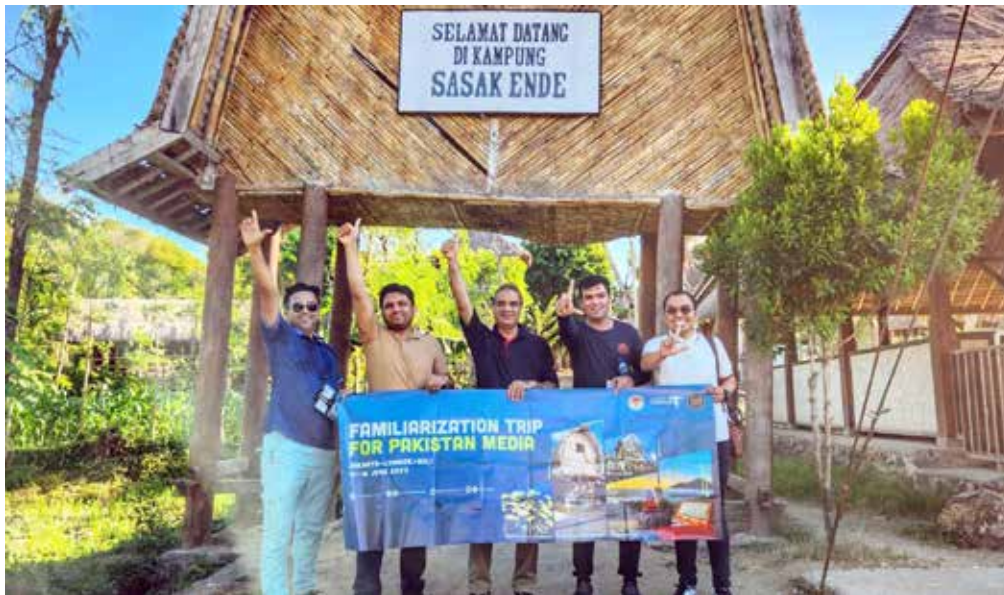
LOMOBK: The Pakistan media delegation posing for a picture during visit to the Ende village.