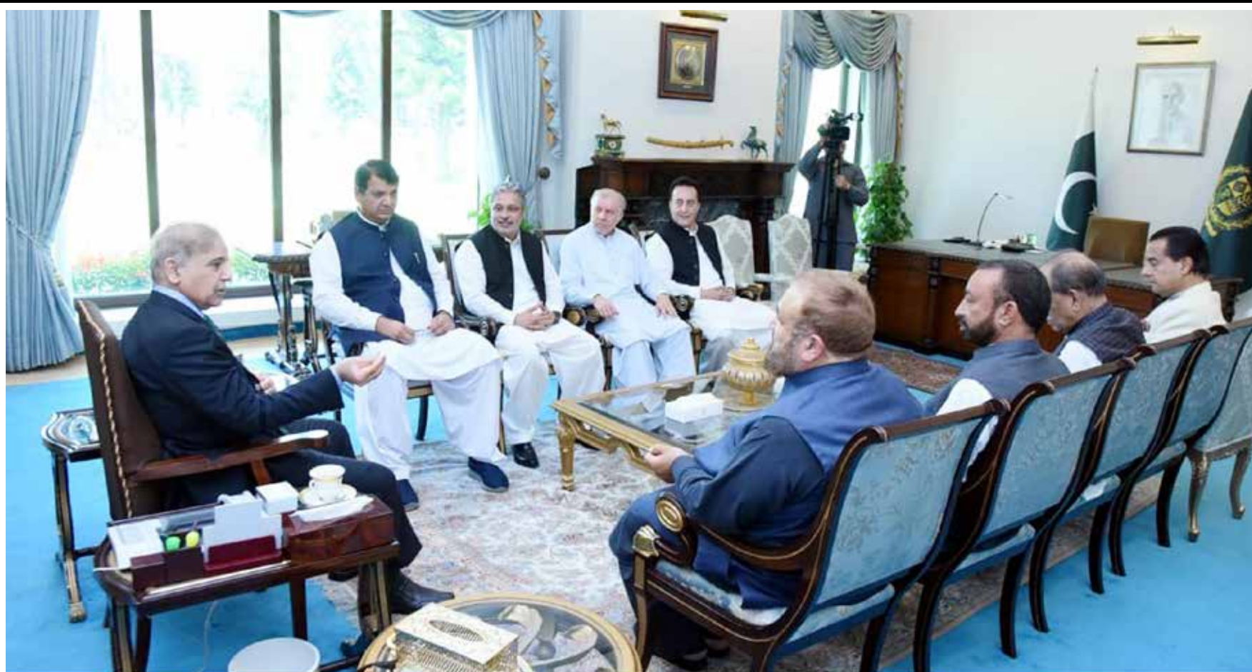
ISLAMABAD: A delegation of PMLN leadership from Khyber Pakhtunkhwa calls on Prime Minister Muhammad Shehbaz Sharif in Islamabad. — DNA