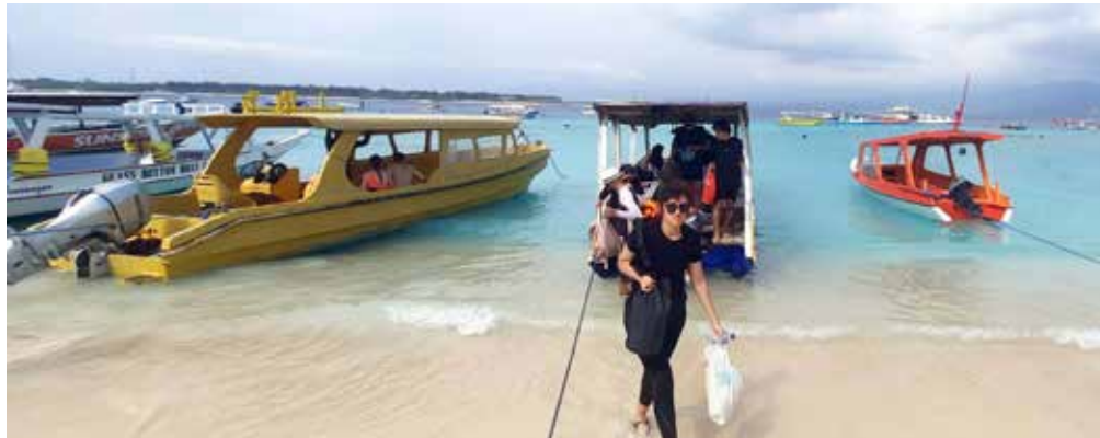
GILI ISLANDS: Members of Pakistan delegation disembark at the picturesque Gili Islands.