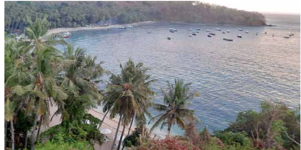
LOMBOK: An enchanting view of the Lombok Island captured from the Kayana resort by the writer. More Pictures on the Back Page.

tion of this village may not be more than 200 inhabitants yet it presented a true picture of traditional Indonesian countryside lifestyle. People were welcoming and hospitable. As is a tradition and culture even in Pakistani villages as well that hospitality is spontaneous and whole-hearted. The idea of such model villages is quite rare but unique and an instant tool of disseminating information about the cultural heritage of the respective countries. This is an area where Pakistan also needs to collaborate with Indonesia in order to promote its culture and village life. As various reports suggest, in recent years, Lombok has been developing its tourism infrastructure to accommodate increasing visitor numbers. The international airport in Lombok, Lombok International Airport (LOP), serves as the main gateway to the island, with regular flights from major Indonesian cities and some international destinations. Overall, Lombok offers a mix of natural beauty, cultural experiences, and outdoor activities, making it a popular destination for those seeking a tropical getaway in Indonesia. Access to Lombok is very easy. If you are already in Bali, you can take a ferry from Padangbai or Gilimanuk to Lombok. The ferry ride takes around 4-5 hours depending on the route and sea conditions. There are both public and private ferry services available. The public ferry is more economical, while private fast boats offer a quicker journey but happen to be a little bit expensive.