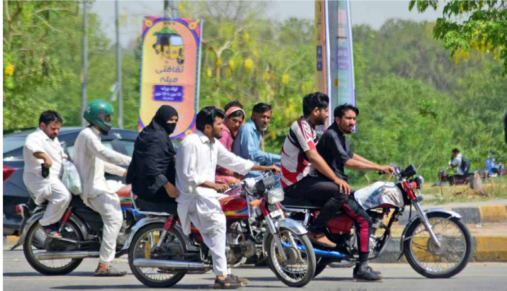
ISLAMABAD: Bikers are riding bikes without wearing helmet at Jinnah Avenue, which needs the attention of concern authorities.

ISLAMABAD: Federal Minister for Communications Maulana Asad Mehmood was overjoyed as Pakistan Post moved up to seven spots in the 2022 World Postal Rankings, released by Universal Postal Union (UPU). Mehmood who was the chief guest at the inauguration ceremony of "UMS-Overnight" Service by Pakistan Post here on Tuesday, said Pakistan Post has reached 155th position from 162 in the world ranking, and further improvements would be made in order to reach new heights. Pakistan Post has moved up to seven spots under his tenure in the Postal Ranking Index which is based on four pillars namely reliability, delivery, relevance and flexibility. Speaking about the "UMS-Overnight" Service, he said Pakistan Post