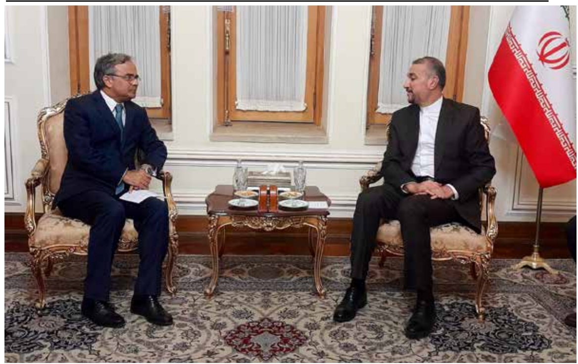
TEHRAN: Foreign Secretary of Pakistan, Asad Majeed Khan meets Foreign Minister of Iran, Amirabdollahian. Both sides discussed matters of mutual interest.

months. The U.S. and Saudi Arabia said in a joint statement that the military and its rival paramilitary group, the Rapid Support Forces, agreed to halt fighting and "refrain from seeking military advantage during the cease-fire." Sudan plunged into chaos after months of worsening tensions.—APP