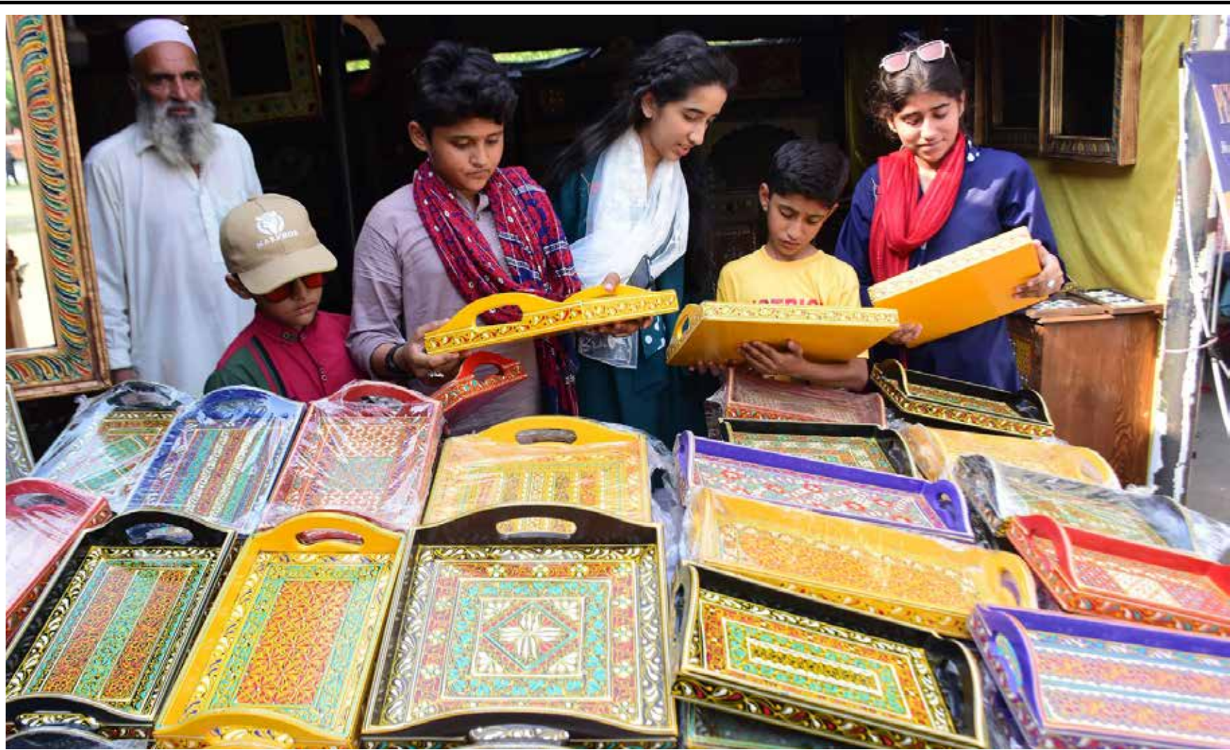
ISLAMABAD: A family is buying traditionally designed trays from stall during "Sakafti Mela" at Lok Versa in Federal Capital.

PESHAWAR: Where climate change issue is affecting the whole world, its impacts in Pakistan are also increasing by each passing year as according to a study Pakistan is among the list of countries vulnerable to climate change if timely measures are not taken. As many other measures are necessary to mitigate the effects of climate change, the most important one is to grow more trees besides controlling deforestation. No doubt, there are many other challenges being faced by the country but this issue requires special attention of the current governments, both central and provincial. Keeping in view the gravity of the issue, the Khyber Pakhtunkhwa government has taken numerous measures for sustainable growth and preservation of forest resources of the province by ensuring careful utilization and protection of forest lands. "Considering forests a rich treasure of the province, the government is giving due consideration to its protection and sustainable growth through different measures including setting up of enclosures, protection from fire. —APP