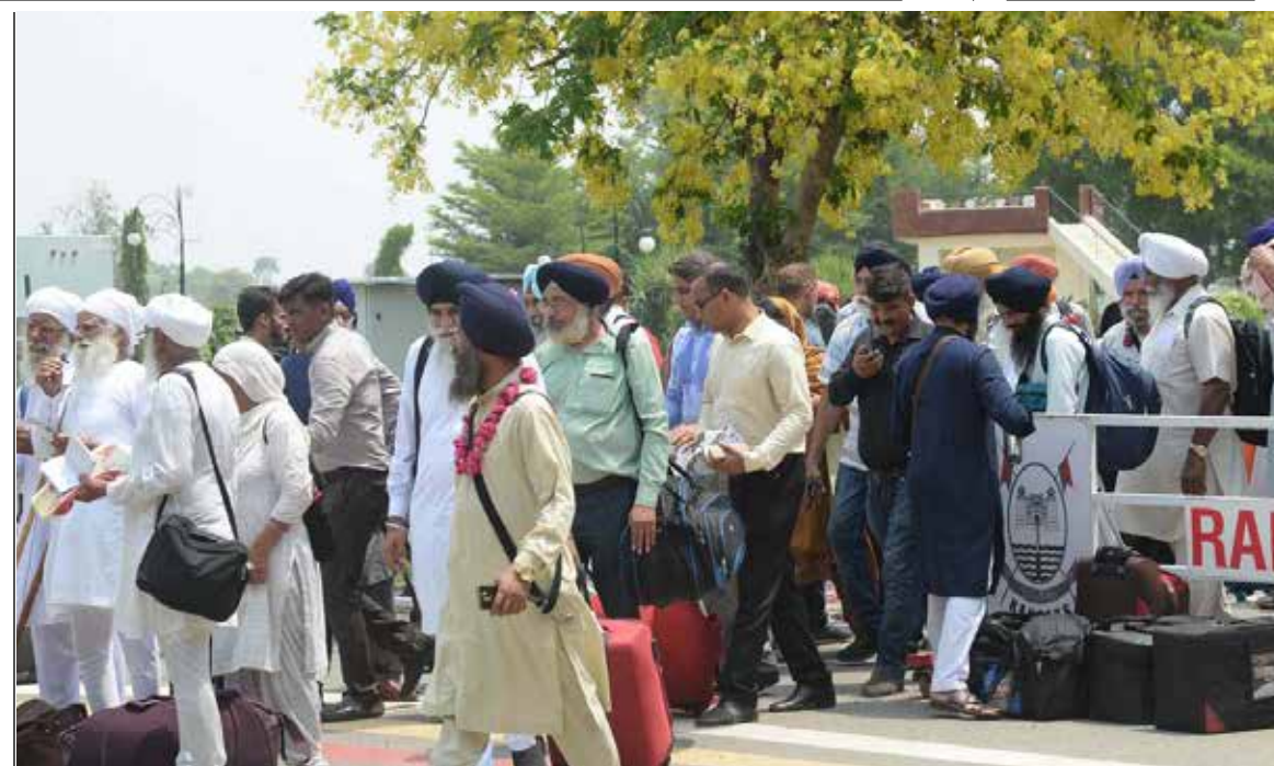
LAHORE: A delegation of Indian Sikh pilgrims are coming to Pakistan via Wagah borde to join the death anniversary of Maharaja Ranjeet Singh.

PESHAWAR: Chairman Senate, Sadiq Sanjarani here Wednesday stressed upon students to focus on innovative trends to compete in the existing scenario of science and technology and added that the culture of innovations would help us to achieve goals of progress and development. He was addressing the 27th Convocation in Ghulam Ishaq Khan (GIK) Institute of Science and Technology at Topi, district Swabi. The convocation was attended by ambassadors, parliamentarians, educationists, vice-chancellors and parents of students.—APP