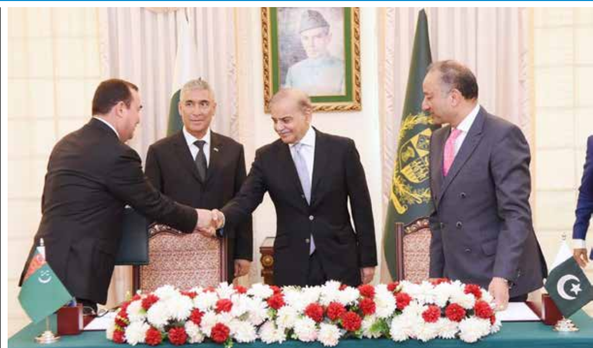
ISLAMABAD: Maksat Babayev, State Minister of Turkmenistan and Head of Turkmen Gaz and Minister of State for Petroleum of Pakistan Dr. Musaddiq Malik signing TAPI Joint Implementation Plan meanwhile Prime Minister Muhammad Shehbaz Sharif witnesses the signing.

'Shar killed over enmity' Latif Khosa exposes propaganda, claims Khan