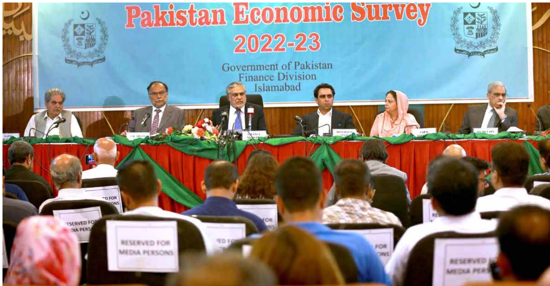
ISLAMABAD: Federal Minister for Finance and Revenue Senator Ishaq Dar presents Economic Survey for fiscal year 2022-23 during a press conference.