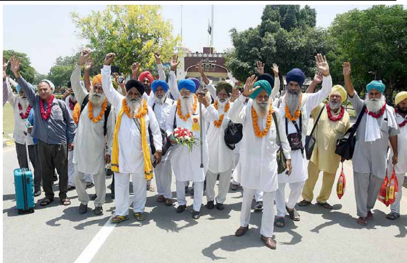
LAHORE: Evacuee Trust Property Board (ETPB) members warmly welcomed to the Sikh pilgrims at Wagah as a large number of Sikh Yatees arrived in Pakistan through Wagha Border to participate in religious rituals on the occasion of Joor Mela.

ANNECY: A Syrian national wounded four young children and an adult in a knife attack in a park in the southeastern French town of Annecy on Thursday, police said, and some of the victims were in critical condition. A police spokesman said the attacker was a 31-year old Syrian asylum seeker who carried Swedish identity documents and a Swedish driving license. He entered France legally and was not known to security agencies. His motives were unclear, an investigative source said, adding that anti-terrorism authorities had not been asked to lead the investigation at this stage. French Interior Minister Gerald Darmanin, who travelled to Annecy with Prime Minister Elisabeth Borne, said on Twitter that the attacker had been arrested. BFM TV showed footage of several policemen overpowering an individual in the park. Two children and one adult were in life-threatening condition, while two children were less seriously hurt, police said. The wounded children were aged between 22 months and 3 years, they said. One of the wounded children was a British national, British foreign minister James Cleverly said.