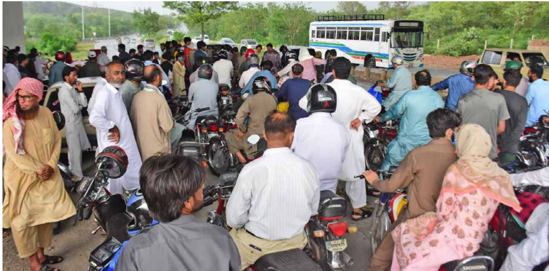
ISLAMABAD: A large number of bikers takes shelter under flyover at Murree Road during heavy rain fall of Pre-monsoon spell.