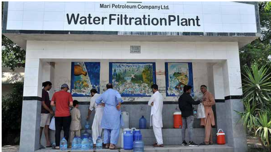
ISLAMABAD: People fill their pots with clean drinking water from water filtration plant in I-8 Sector.

COPHC is also investing in environmental protection and making Gwadar beautiful. COPHC has committed to plant one million plants across Gwadar in addition to cleanliness drives. It is good to note that COPHC planted 400000 plants across the port and Gwadar city within one year of commitment. State Grid Cooperation is another Chinese company, which is investing in multiple initiatives. The company not only took care of employees but also contributed generously to support the government and community in the fight against COVID-19. It donated ventilators, monitors, protective clothing, masks, and other medical equipment or materials to the Pakistani government, communities, and hospitals. Moreover, State Grid Cooperation also distributed 40 tons of rice, flour, and other materials among the marginalized communities in the provinces of Punjab and Sindh. It helped many families avert the negative implications of lockdown during COVID-19.