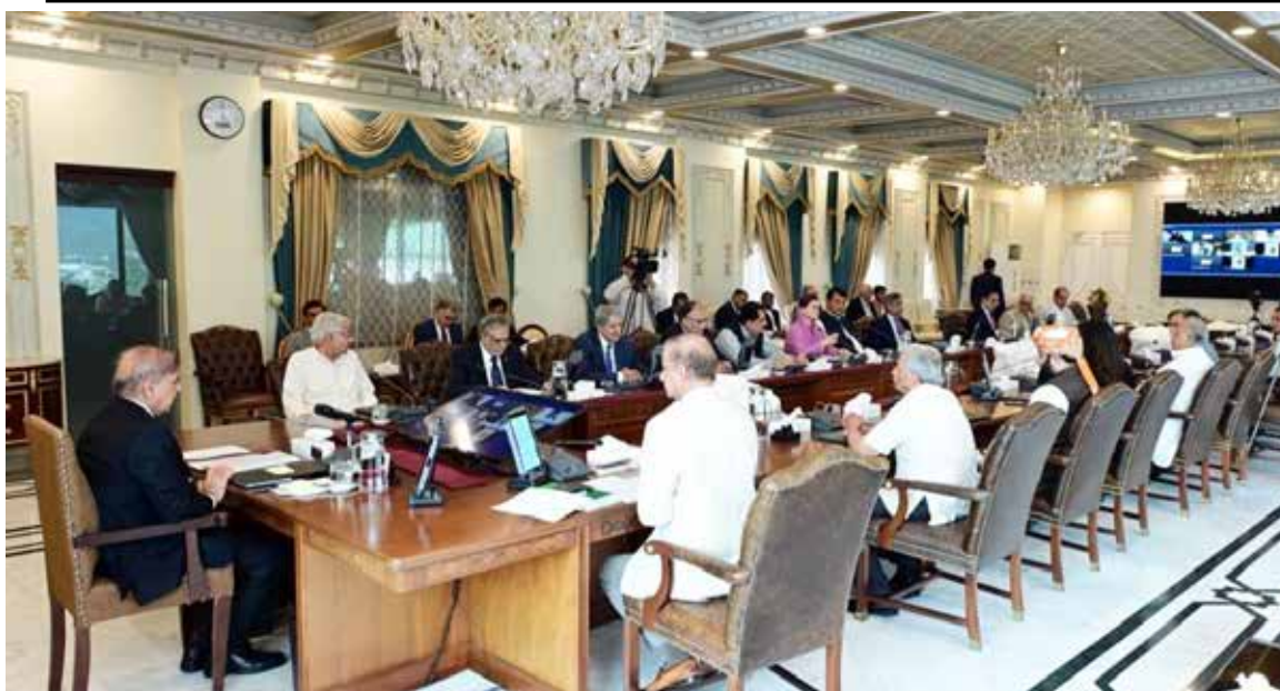
ISLAMABAD: Prime Minister Shehbaz Sharif chairs a meeting of federal cabinet.

stability to the country despite difficult economic circumstances. She further assured the Finance Minister that the Chinese government would continue to support Pakistan.