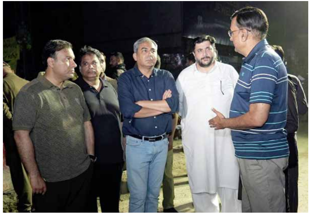
LAHORE: Caretaker Chief Minister Punjab Mohsin Naqvi inspecting the construction work on his visit to the under-construction Akbar Chowk flyover project.