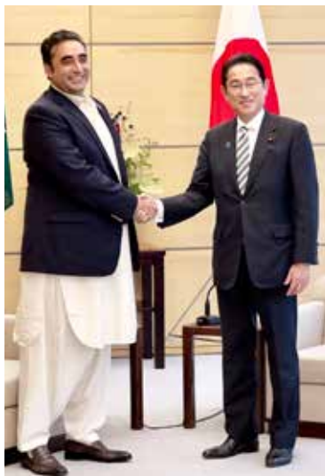
TOKYO: Foreign Minister Bilawal Bhutto Zardari calls on the Japanese Prime Minister Fumio Kishida.

ISLAMABAD: Pakistan and Japan on Monday agreed to further deepen and enhance their mutually beneficial bilateral cooperation in multiple areas including trade, investment, human resource development and exchange, IT, tourism and agriculture sectors. "We have also jointly agreed to explore the possibility of working together on targeted programs with higher impact in the domains of solarization, desalination and water purification and housing and infrastructure rebuilding in the floods affected areas in Pakistan, Foreign Minister Bilawal Bhutto Zardari said in a joint press statement along with his Japanese counterpart Yoshimasa Hayashi in Tokyo. Earlier the two ministers held a meeting in a cordial environment. Both the Ministers appreciated the free bilateral relations while expressing readi-