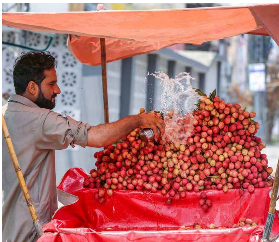
RAWALPINDI: A street vendor busy in watering seasonal fruit leechi to keep it fresh at Murree Road.

long water supply line from plant site to Gwadar city's main water supply network has also been laid down, he added. Completion of 1.2 MGD Water Desalination Plant, spreading over approximately one acre land area, reflects China's support for poor people of Gwadar desperately longing for clean water over the last many years. Besides drinkable water being supplied to people of Gwadar through water reservoirs, 1.2 MGD Water Desalination Plant project will be another source of clean water that will help meet the water demand of the Gwadar city and Gwadar port.