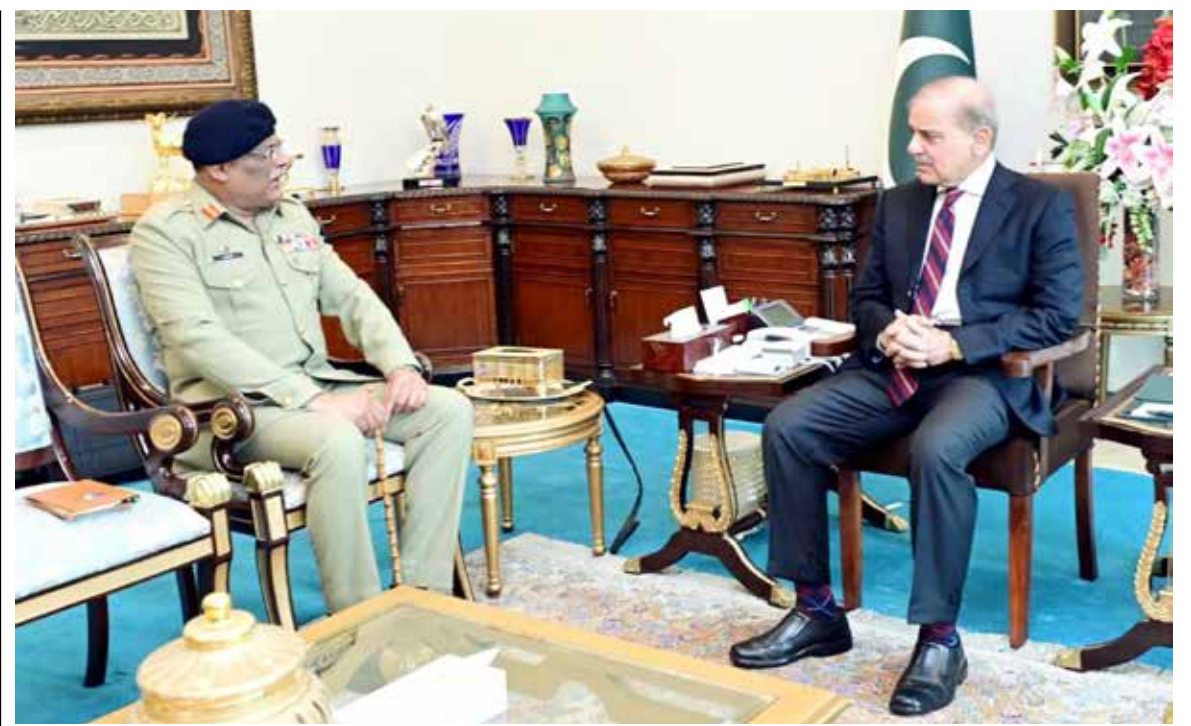
ISLAMABAD: Chairman Joint Chiefs of Staff Committee General Sahir Shamsah Mirza calls on Prime Minister Muhammad Shehbaz Sharif.