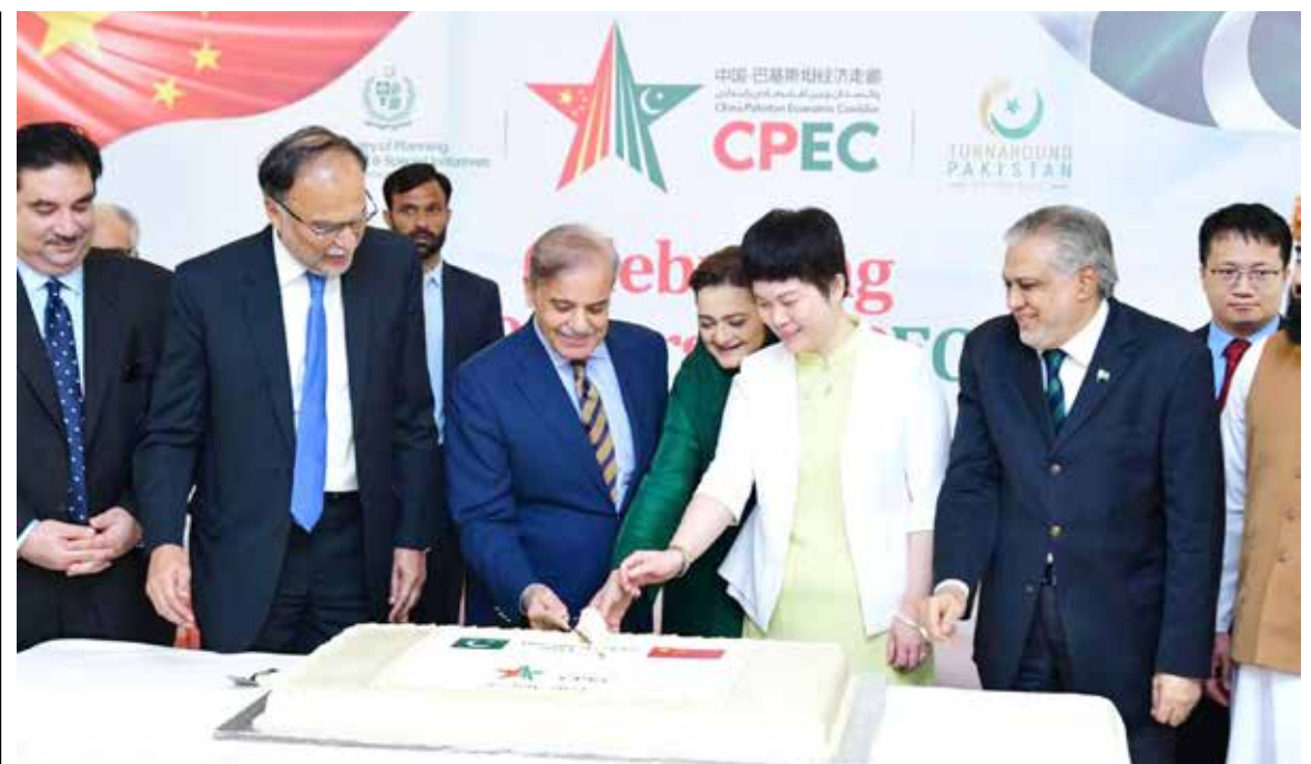
ISLAMABAD: Prime Minister Muhammad Shehbaz Sharif, chargé d'affaires of the Chinese Embassy in Islamabad Ms Pang Chunxue, and Federal Ministers cutting a cake marking the 10th anniversary of the signing of the agreement for CPEC.