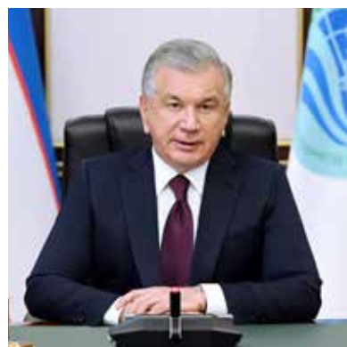
President of Uzbekistan Shavkat Mirziyoyev

TASHKENT, UZBEKISTAN: The incumbent President of Uzbekistan Shavkat Mirziyoyev is set to be elected as the President of Uzbekistan as the opinion polls, till filing of this report on Sunday night, had put him ahead of his three rival candidates. President Mirziyoyev after his election is to spur the reform process approved by the people of Uzbekistan in the recently held referendum. The list of voters includes more than 19.5 million citizens, according to the Central Election Commission of Uzbekistan. 10,784 polling stations opened across the country. The voting process began at 8:00 am and ended at 8:00 pm local time. The final results shall be announced within 10 days. Uzbekistan held a national referendum a couple of months ago in which a new set of reforms was approved by the people of Uzbekistan. After the referendum the incumbent President decided to seek a fresh mandate from people therefore he called early Presidential elections. The last presidential election was held in October 2021. The president wanted to implement the new reforms by taking people of Uzbekistan on board that is why he decided to seek a fresh mandate so that he could pursue the reform process vigorously. A large number of foreign observers, journalist, members of the civil society have been invited to monitor the presidential election. A sizeable group comprising prominent personalities is also in Tashkent to monitor the elections.