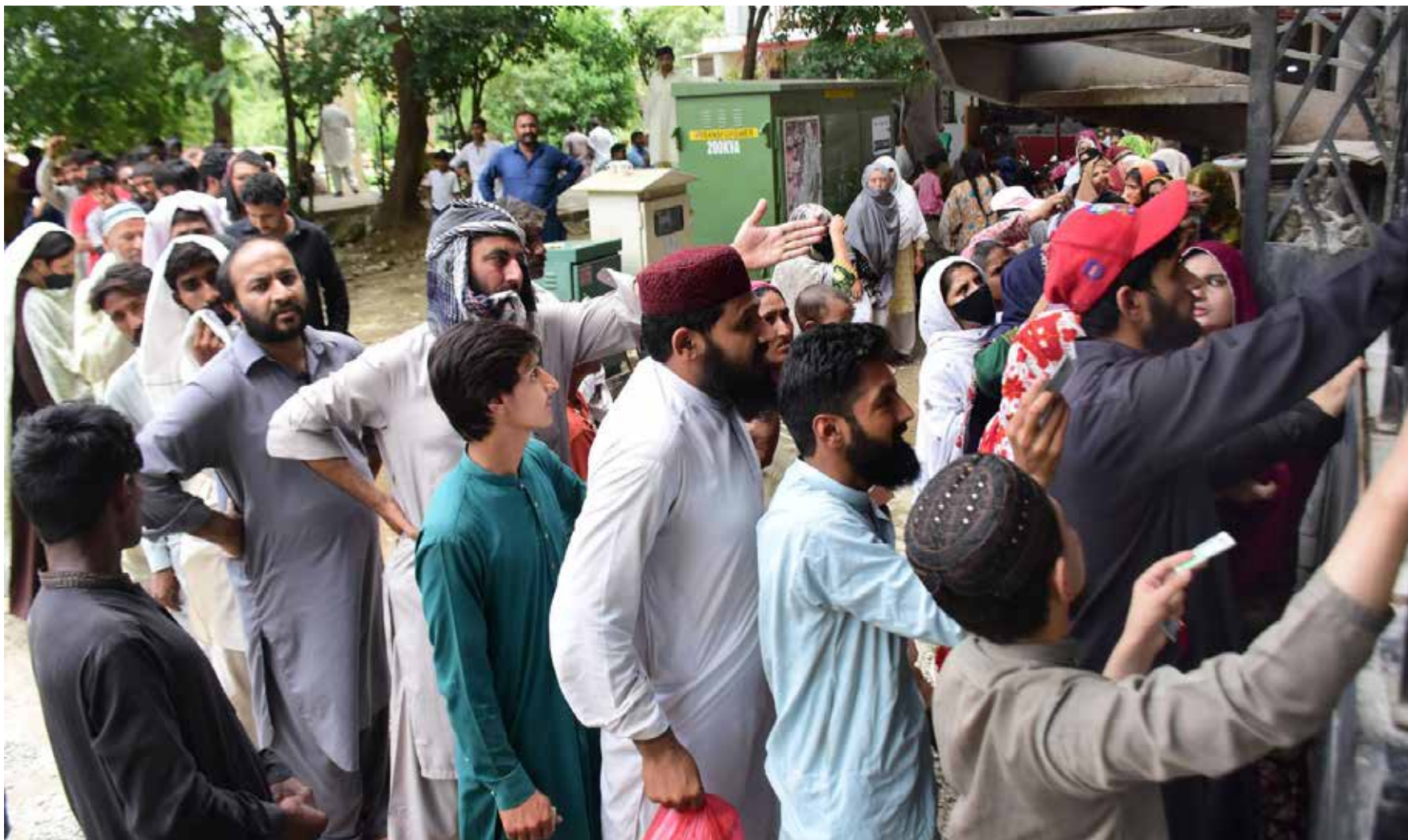
ISLAMABAD: People are stand in queue for registration at low price floor counter at Utility Store in Sitara Market as due to extremely high inflation, common people are suffering a lot across the Country.—Online

ISLAMABAD: The All Parties Hurriyat Conference (APHC) has said that Kashmiris are determined to carry on their struggle for the liberation of their motherland from Indian yoke. The APHC spokesman in a statement issued in Srinagar in the Indian illegally occupied Jammu and Kashmir (IIOJK) on Sunday, said the killings, arrests and torture cannot defeat the Kashmiris' urge for freedom and they are ready to face Indian bullets but will not surrender. According to Kashmir Media Service, the Modi regime cannot defeat the spirit of Kashmiri people to win freedom and they have no option but to fight Indian illegal occupation. Kashmiris will continue sacrificing their lives till freedom from Indian clutches, he added. The APHC spokesman said that Kashmiri people were united to defeat India's nefarious designs in IIOJK and salute to the Kashmiri people for refusing to accept Indian hegemony. He maintained that the ongoing people's struggle against Indian tyranny would remain a golden page in Kashmir's history and the day was not far when Kashmiris would see the dawn of freedom. India's brutal military occupation of Kashmir is a challenge to the international community.—APP