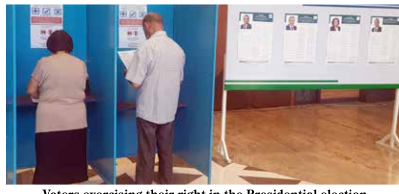
Voters exercising their right in the Presidential election

Voting across the landlocked country of around 36 million people began at 8:00 am local time which continued uninterrupted till 8 pm. In some areas voting concluded even before time. The Uzbek government had made elaborate arrangements for the Uzbek Diaspora living in various countries. The Uzbek missions in various countries were turned into the polling station and the process was completed well before the holding of the Presidential election on July 9, 2023. Under the rule of President Shavkat Mirziyoyev, Uzbekistan has strengthened traditional relations with Beijing and Moscow. Both Pakistan and Uzbekistan also enjoy excellent relations. The recent visit of the Uzbek President to Pakistan had further strengthened this relationship. Pakistan values its relations with Uzbekistan, rooted in religious affinity, common values, geo-strategic