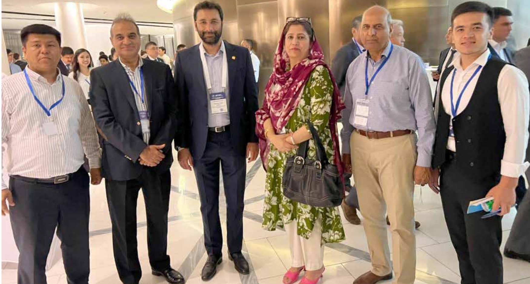
ISLAMABAD: Pakistani Senators Faisal Saleem Rehman, Sitara Ayaz, Editor Daily Islamabad POST/DNA and Centreline magazine Ansar Mahmood Bhatti and others posing for a picture during a reception hosted by the Central Election Commission of Uzbekistan. The media and parliamentary delegation is in Uzbekistan for the coverage of the Presidential elections.