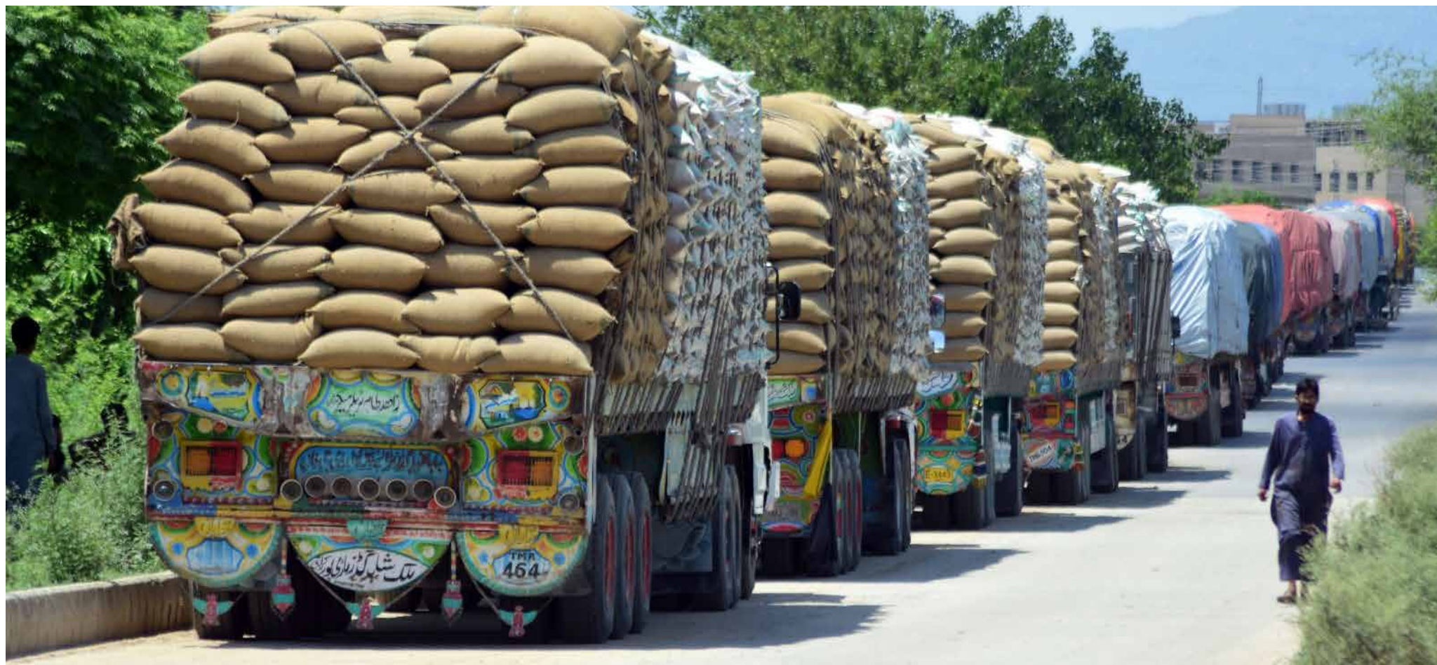
ISLAMABAD: A view of the trucks parked outside Floor mills at Sector 1-11 as waiting for laborers to unload them, in Federal Capital.