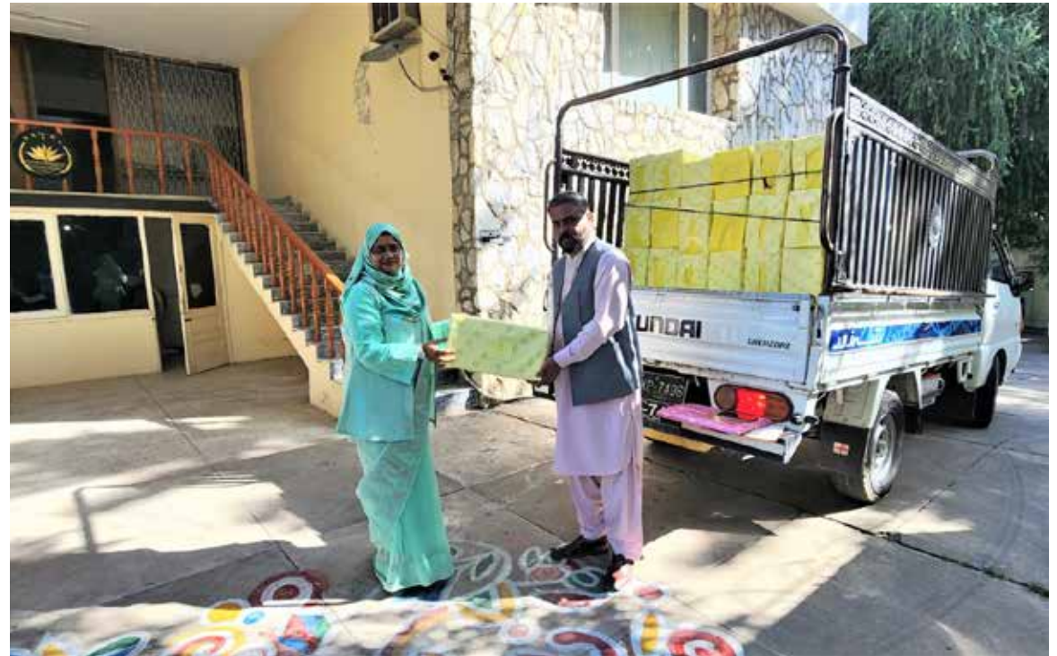
ISLAMABAD: Prime Minister of Bangladesh Sheikh Hasina has sent 1500 Kgs of special Bangladeshi mangoes as gift to the Prime Minister of Pakistan, Mian Muhammad Shehbaz Sharif. The mangoes were handed over by the Bangladesh High Commission to the Ministry of Foreign Affairs. —DNA

and thoroughly enjoyed the first 3D Pakistani production. The film contains OSTs from Ali Zafar, SanamMarvi, Ali Noor, Grehan the band amongst others. Transporting viewers into a magical world filled with wonder, adventure, and valuable life lessons, the film follows the captivating journey of young Allahyar, a brave boy who must overcome his fears and join forces with an unlikely group of magical creatures to save