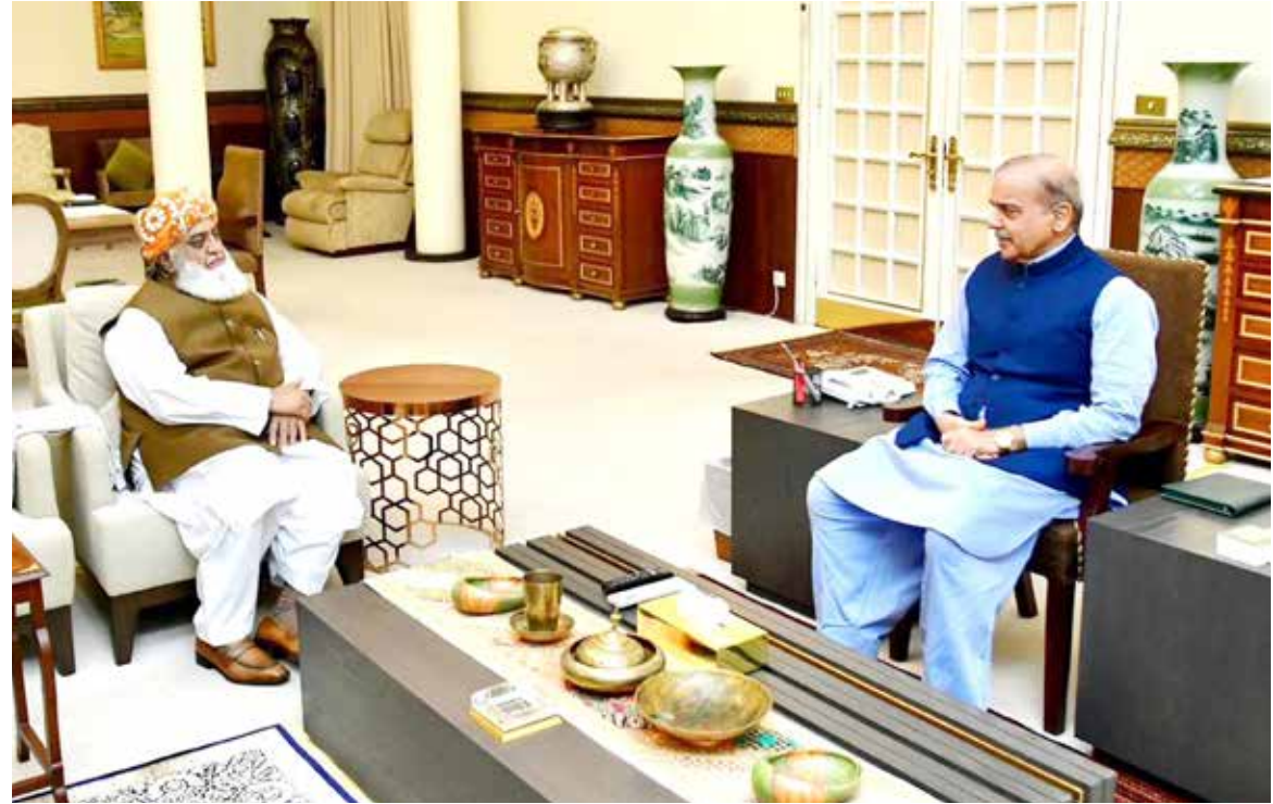
ISLAMABAD: JUI-F President Molana Fazlur Rehman calls on PM Shehbaz Sharif.

said this is the only person who desecrated the memorials of martyrs and is involved in the attacks on military installations and other buildings including Radio Pakistan. Murrimum Aurangzeb said the PML-N leadership always appeared before the courts and faced the trumped up cases registered during the PTI tenure. She, however, said the PTI Chairman is making hue and cry to deflect accountability. She said the PTI Chairman should appear in courts and respond in corruption cases including Toshakhana, foreign funding and Al-Qadir Trust. The Information Minister said the PTI Chairman is a black spot on our politics who incites people for violence and preaches terrorism. Responding to a question, the Information Minister said Prime Minister Shehbaz Sharif over the last one year has made efforts to stabilize the economy and provide relief to the common man. She said the economic revival plan rolled out by the government will benefit the people. To another question, the Information Minister said the government will complete its constitutional tenure. She said the party, which has always given relief to the people, eliminated terrorism and stabilized the economy is not running from elections.