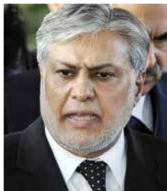
tended heartfelt appreciations to Chinese Ministry of Finance, Ministry of Foreign Affairs, Peoples Bank of China and Chinese

ness. The minister congratulated BOC President and his team for extensive efforts in opening the branch and also appreciated cooperation by Pakistan authorities and finance ministry in this regard. The minister also congratulated Deputy Governor Peoples Bank of China, his team and officials of China embassy. Ishaq Dar said that BOC, Industrial and Commercial Bank of China (ICBC), China Development Bank and Peoples Bank of China were all great financial partners of Pakistan. He said Pakistan had been passing through a turbulence phase during the last one year and ex-