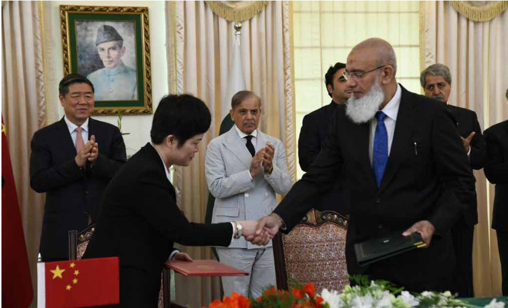
ISLAMABAD: Prime Minister Muhammad Shehbaz Sharif and Vice-Premier of State Council of China, He Lifeng witnessing the signing ceremony of agreements/MoUs regarding cooperation between the two countries in various fields.—DNA

TRIPOLI, Libya: A new Libya can only be built through an electoral process and the country's future should not depend on the House of Representatives and High Council of State, the UN envoy for Libya said Sunday. Abdoulaye Bathily made the remarks during a speech at the Forum of Elders and Dignitaries of Fezzan in the capital Tripoli, according to local media outlets. Bathily said the UN mission was working to support Libyans to find solutions to the crisis without favoring one party over the other and that when a new government is elected, stability could prevail in the country. He said the country's future should not depend on the House of Representatives and the High Council of State but on the aspirations of the people.—DNA