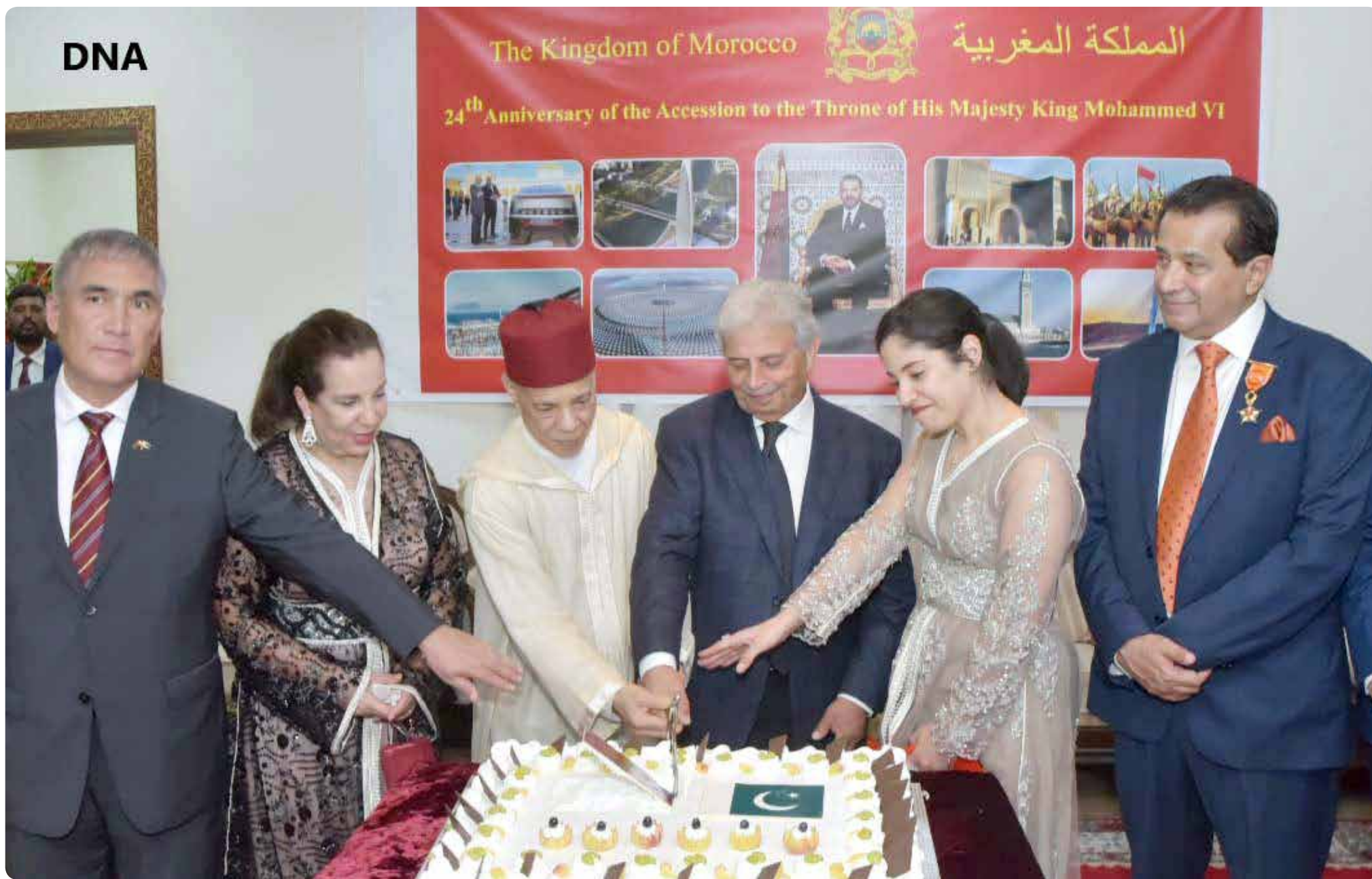
ISLAMABAD: Chief guest Rana Tanveer Hussain Federal Minister for Education, Ambassador of Morocco Mohammed Karmoune and others cutting cake to celebrate the 24th Anniversary of the Accession to The Throne of King Mohammed VI of Morocco.