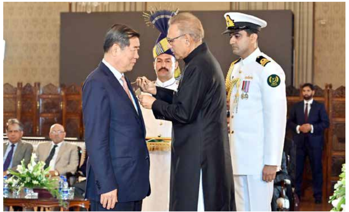
ISLAMABAD: President Dr Arif Alvi confers the Hilal-e-Pakistan award on Chinese Vice Premier He Lifeng.