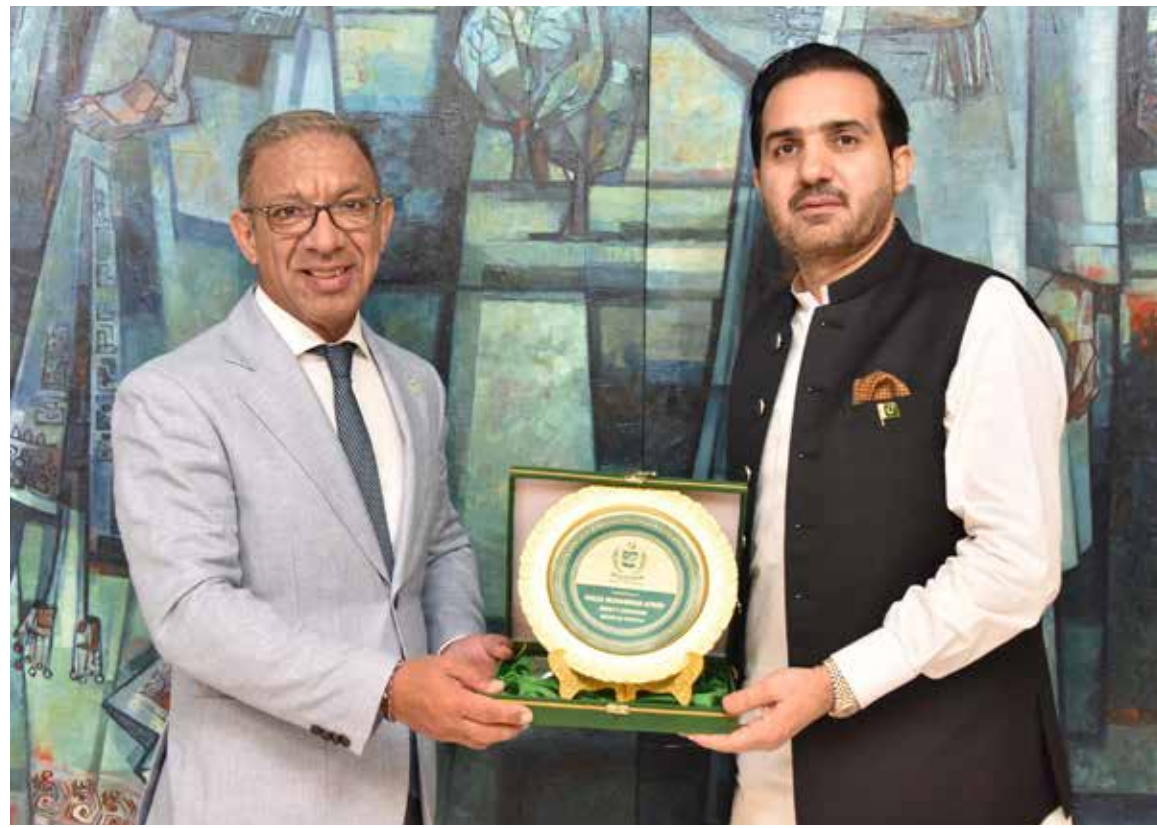
ISLAMABAD: Deputy Chairman Senate, Mirza Muhammad Afridi presenting souvenir to President of the Inter-Parliamentary Union (IPU), Mr. Duarte Pacheco at Parliament House.—DNA

Governor shared that Pakistan was already benefiting from RMB adding that during his (Dar's) last visit to China under the leadership of Prime Minister Mian Muhammad Shehbaz Sharif, he had proposed enhancement of facility upto RMB 50 billion. He expressed the hope that cooperation between the two countries in terms of economic and diplomatic ties would reach to new heights. He said both the countries were helping each other on all international and domestic issues in the world forum like United Nations Security Council, UN General Assembly and all other forums.