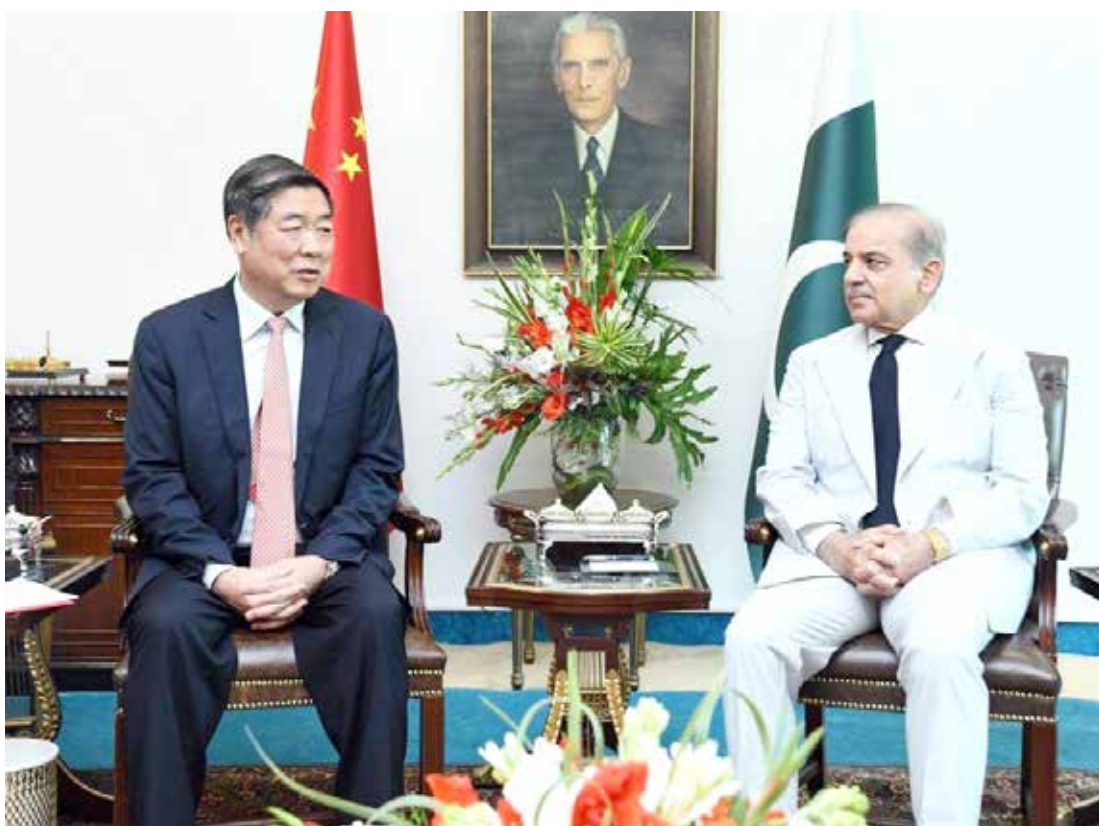
ISLAMABAD: Prime Minister Shehbaz Sharif meets Chinese Vice Premier He Lifeng.

BEIJING: Chinese President Xi Jinping, also the military's commander-in-chief, on Monday appointed a new head of the armed force overseeing the nation's conventional - and nuclear - missiles, one day before the anniversary of the People's Liberation Army. Wang Houbin, former deputy commander of the navy, was named the new head of the PLA Rocket Force, and Xu Xisheng, its new political commissar, with both men acquiring the top rank of general, according to state media. Until his move to the PLA Rocket Force, Wang had been deputy commander of the navy since 2020. He was previously also the deputy chief of staff at the Navy. Xu was formerly the deputy political commissar of the Southern Theatre Command, one of the PLA's five theatre commands. State media did not say where the PLA Rocket Force's previous chief, Li Yuchao, was reassigned or state his whereabouts. The new appointments came a day ahead of the 96th anniversary of the PLA's founding on Aug. 1. Xi has repeatedly urged the military to deepen war and combat planning to increase the chances of victory in actual combat to safeguard China's sovereignty and territory. China says it is committed to a defensive nuclear strategy, and pledges to no first use of nuclear weapons. It says it will also not use or threaten to use nuclear weapons against non-nuclear weapon states or nuclear weapon free zones.