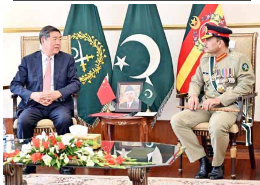
RAWALPINDI: Visiting Chinese Vice Premier He Lifeng meets General Syed Asim Munir, COAS. Both reiterated the desire to further enhance and strengthen bilateral relations in all fields.

DNA ISLAMABAD: Minister of State for Petroleum, Musadik Malik, termed the forthcoming mineral conference titled "Dust to Development" as a journey of prosperity that eventually extricate Pak from the quagmire of economic challenges. The financial value of Pakistan's minerals amounted to 6.1 trillion dollars, surpassing the total net worth of corporate giants such as Apple, Amazon and Google, minister said while addressing a press conference here. He said that 'Dust to Development' was the commencement of a new era of mining in Pak as its scope was not limited to mining, but smelting and export as well.