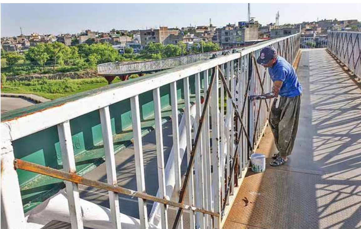
ISLAMABAD: A painter busy in painting a pedestrian bridge on Islamabad Expressway.

The ECNEC also considered and approved a project of Government of KPK titled "Khyber Pakhtunkhwa Rural Investment & Industrial Support Project (RIISP) to be executed by Govt. of Khyber Pakhtunkhwa in District Bajur, Khyber, Kurram, Mohmand, North Waziristan, Orakzai, South Waziristan, and erstwhile FR regions at a cost of Rs. 110,700 million including IDA loan of USD 300 million from World Bank and Govt. of Khyber Pakhtunkhwa share of Rs. 29,700 million (in kind). The project will be completed in two phases i.e. Phase-I is six years (2023-2029) and Phase-II is also six years (2029-2031).