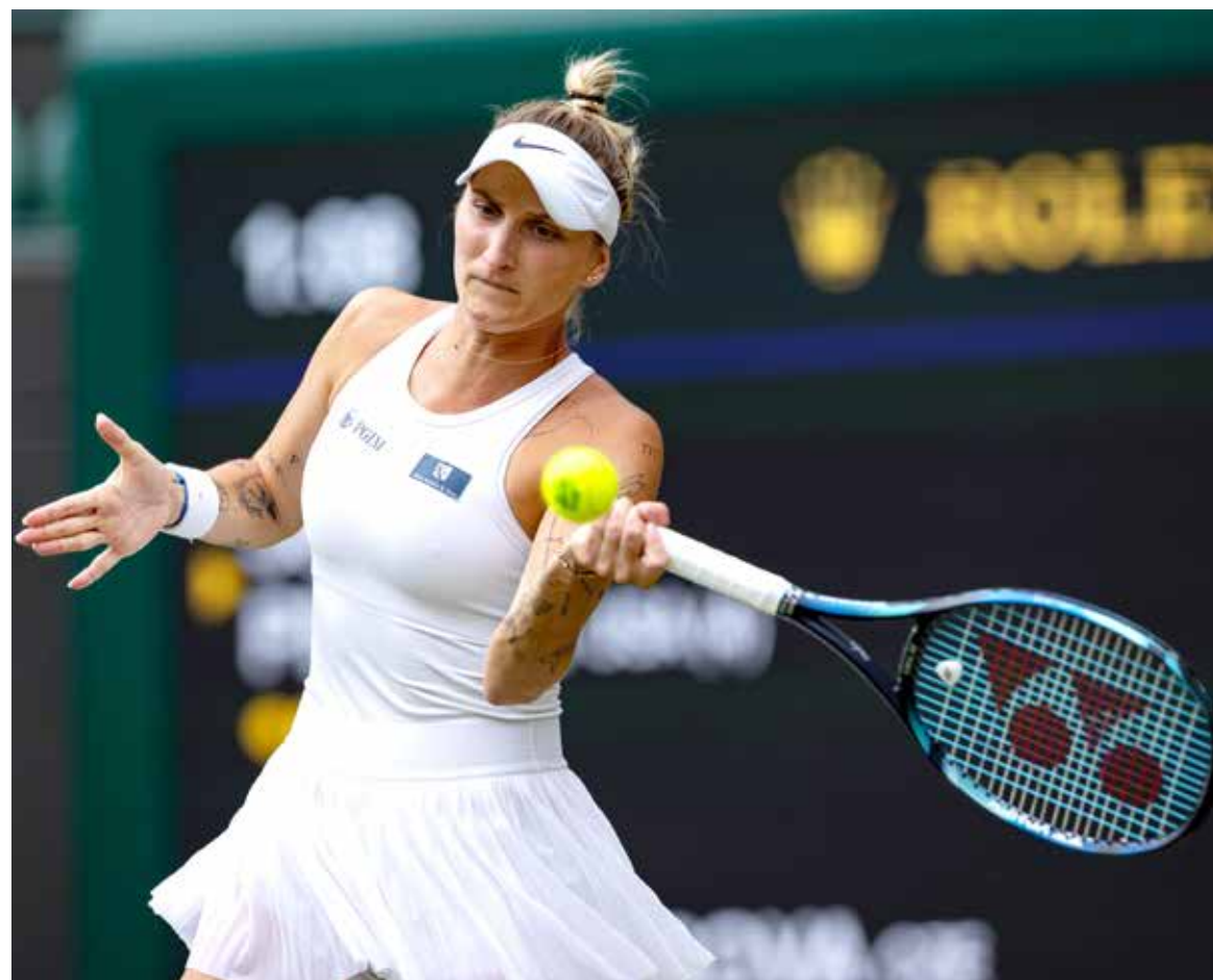
LONDON: Marketa Vondrousova in action during her match against Pegula in Wimbledon 2023.

sured that Gardner won the award in the women's category. "Thank you to everyone who voted me the ICC Women's Player of the Month. "To win an Ashes Test match at Trent Bridge was a special moment for our team and I'm happy I was able to contribute towards the win. "Winning a Test match overseas is one of the biggest challenges in cricket, it's certainly a game that we will remember for a long time to come. "The women's Ashes series has seen record-breaking crowds in England, it's an exciting time for our sport and I'm thrilled to be part of it." Gardner won her third Player of the Month award after beating Tammy Beaumont of England and Hayley Matthews of the West Indies.