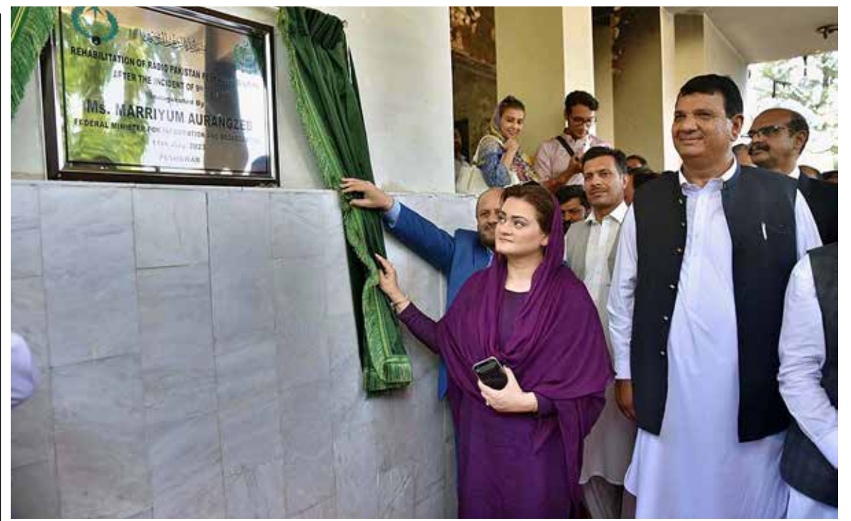
PESHAWAR: Federal Minister for Information and Broadcasting Ms. Marriyum Aurangzeb inaugurating Rehabilitation of Radio Pakistan Peshawar building after the incident of 9th May.