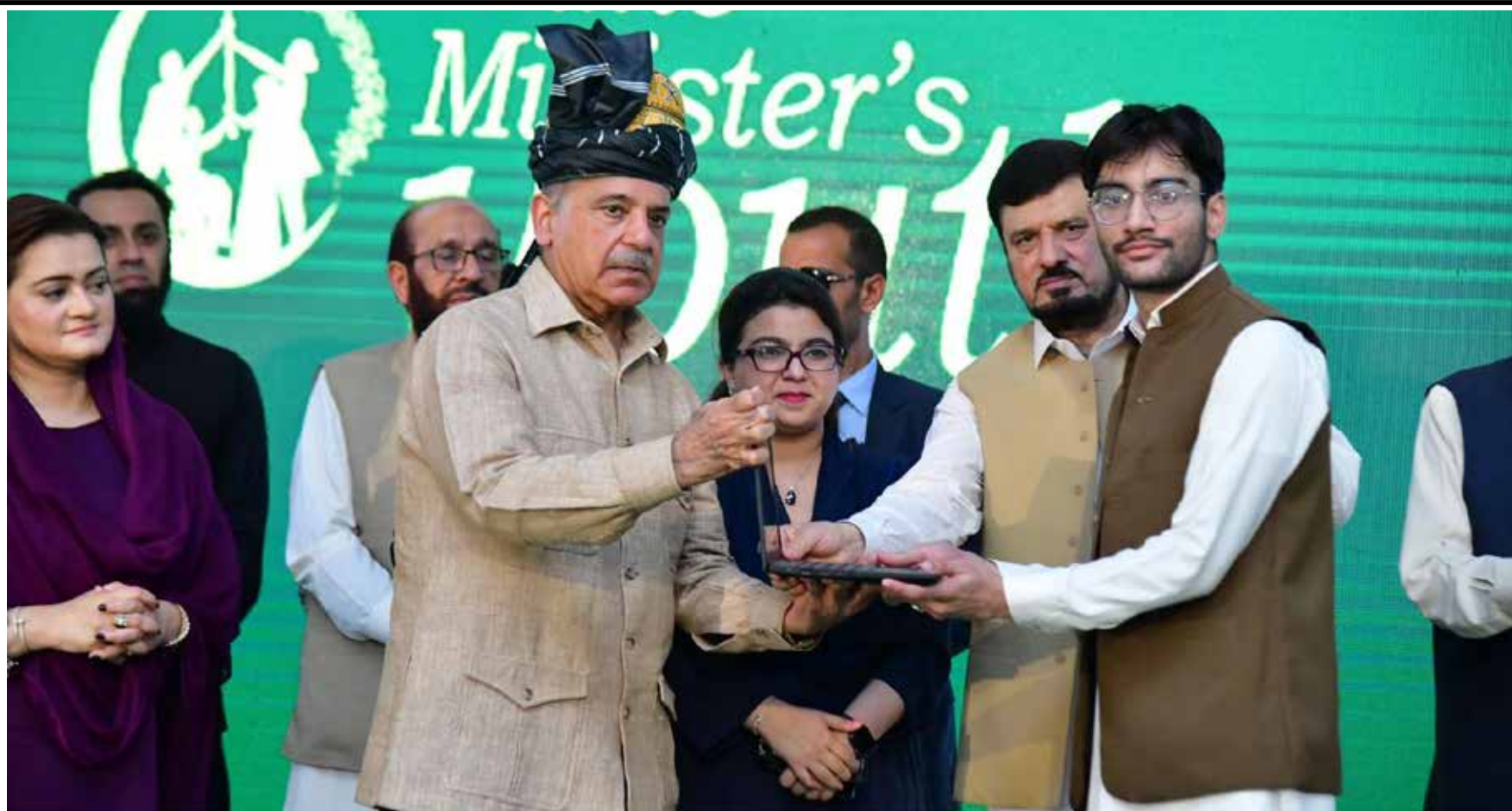
PESHAWAR. Prime Minister Muhammad Shehbaz Sharif distributes Laptops on merit basis among high achieving students under the Prime Minister's Youth Laptop Scheme 2023. —DNA