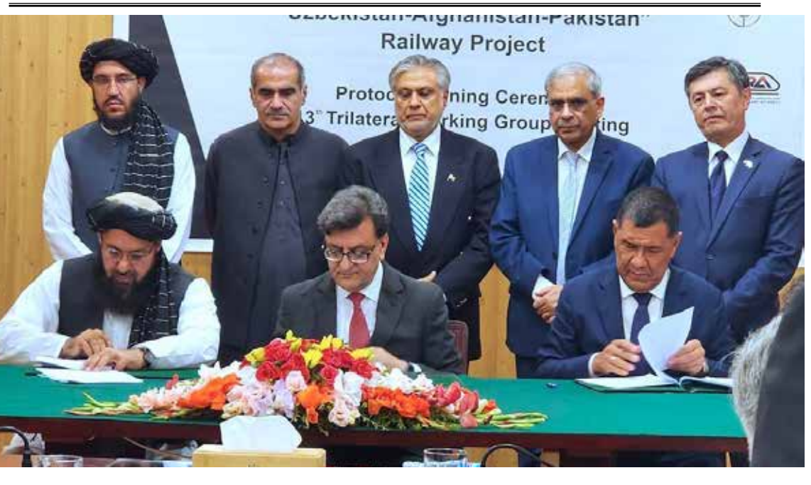
ISLAMABAD: Federal Minister of Finance, Ishaq Dar, Khwaja Saad Rafique, Ambassador of Uzbekistan and Afghan Charge d'affairs are witnessing the signing of Pakistan, Uzbekistan, Afghanistan joint protocol to connect Uzbek rail network with Pakistan.

friendship and exceptional cooperation between the two nations. He underscored the fact that Italy, too, is profoundly affected by the devastating consequences of climate change.–APP