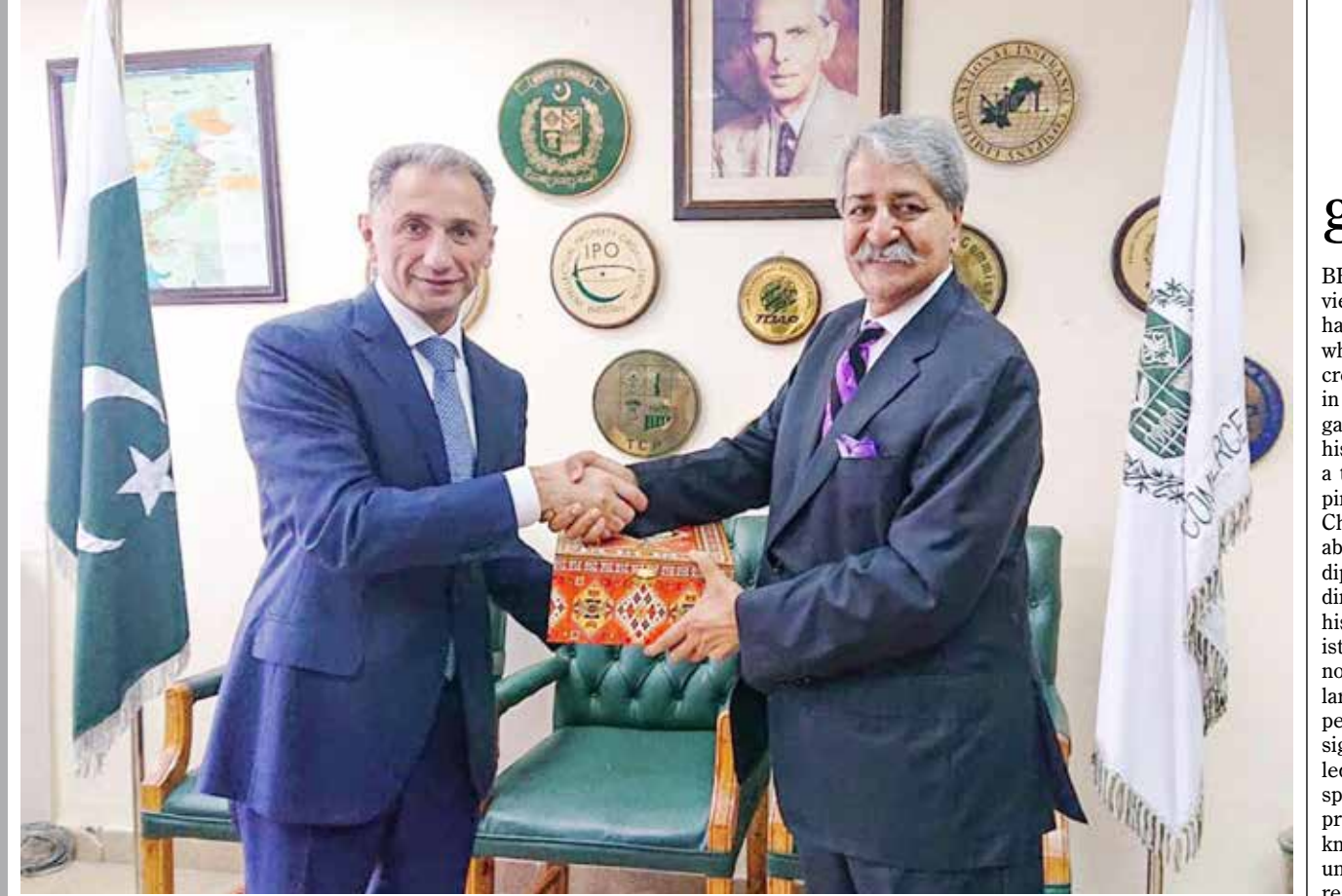
ISLAMABAD: Syed Naveed Qamar Federal Minister for Commerce and Azerbaijan Minister of Digital Development & Transport, H.E Rashid Nabiyev, exchanging souvenir.

ISLAMABAD: Pakistan Tehreek-e-Insaf (PTI) Imran