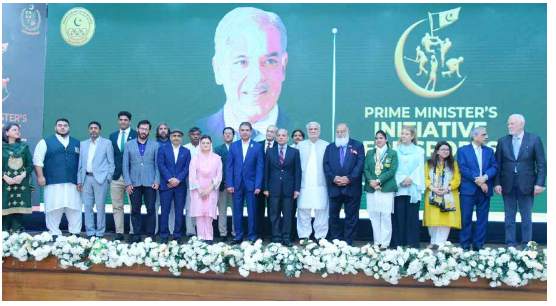
ISLAMABAD: Prime Minister Muhammad Shehbaz Sharif and other dignitaries in a group with Pakistan's leading sportspersons.

Recalling Pakistan's at the COP27, the fo role minister said the outcome of the meeting had not been possible without the support form other participating countries. Foreign Minister Bilawal extended gratitude to the friendly countries for their support to Pakistan enabling it to reach the agreement with International Monetary Fund. He told the gathering that the country was heading towards elections and for any government, only way to deliver was to focus on goals and aims by strengthening the institutions including the federal and provincial parliaments.