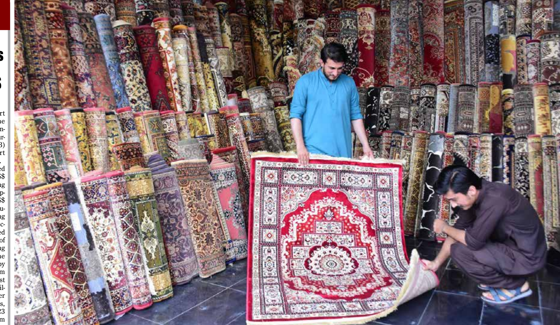
ISLAMABAD: A man is buying traditional Carpet from shopkeeper at Weekly Tuesday Market of H-09 in Federal Capital.