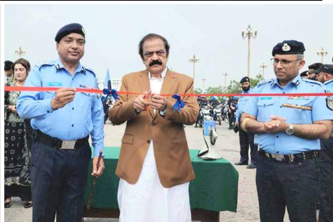
ISLAMABAD: Federal Minister for Interior Rana Sana Ullah Khan cutting Ribbon during the inauguration of Dolphin force in Islamabad. IGP Dr. Akbar Nasir and DIG Shoeb Khurram Janbaz are also seen in the picture.