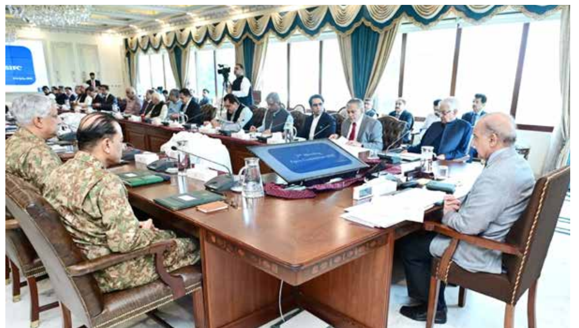
ISLAMABAD: Prime Minister Shehbaz Sharif chairs 2nd Apex Committee Meeting of Special Investment Facilitation Council SIFC. Chief of Army Staff, Chief Ministers, Federal and Provincial Ministers are also attending. — DNA

ISLAMABAD: Prime Minister Shehbaz Sharif on Friday called upon the Organization of Islamic Cooperation (OIC) and the civilized world to come forward and take steps to put an end to the abominable practice of desecration of the holy books. "The attitudes that incite religious hatred, promote violence and encourage terrorism and militancy, need to be checked," he said in a tweet. The prime minister said no civilized society would allow the desecration of holy personages, symbols and divine books in the name of freedom of expression. "The grant of permission to desecrate the Holy Quran, Torah & Bible is part of a sinister, vile and despicable agenda whose sole aim could be to threaten world peace," he said. The prime minister said: "We should not let a handful of Satanic characters undermine our shared values of peace, and tolerance, pluralism."