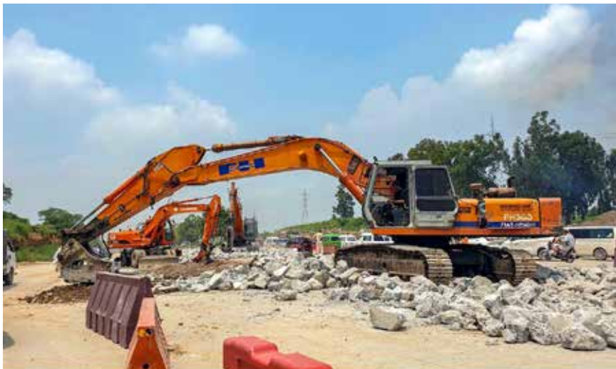
ISLAMABAD: Heavy machinery being used to expand lanes on Islamabad Expressway.