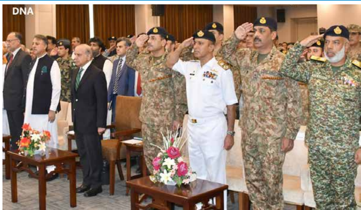
GWADAR: Prime Minister Muhammad Shehbaz Sharif, Chief of Army Staff General Asim Munir and others listening to the national anthem during a ceremony in Gwadar.

ISLAMABAD: Four leading Pakistani state-owned companies signed memorandum of understanding (MoU) to collaborate on $10 billion Greenfield Refinery project that will be jointly developed with Saudi Aramco at the strategic Gwadar port in Balochistan. The MoU signing ceremony took place at the head office of Oil and Gas Development Company Limited (OGDCL) on Thursday, according to an official statement. The Pakistani state-owned entities, Oil and Gas Development Company Limited (OGDCL), Pakistan State Oil (PSO), Pakistan Petroleum Limited (PPL), and Government Holdings Private Limited (GHPL), will collaborate through a joint investment strategy, statement added.