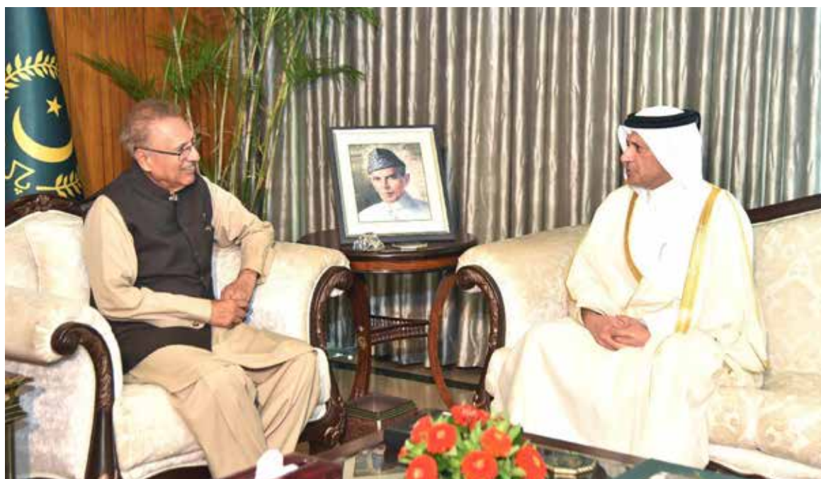
ISLAMABAD: The outgoing Ambassador of Qatar to Pakistan, Sheikh Saoud Bin Abdulrahman Faisal Al-Thani, called on President Dr Arif Alvi, at Aiwan-e-Sadr.