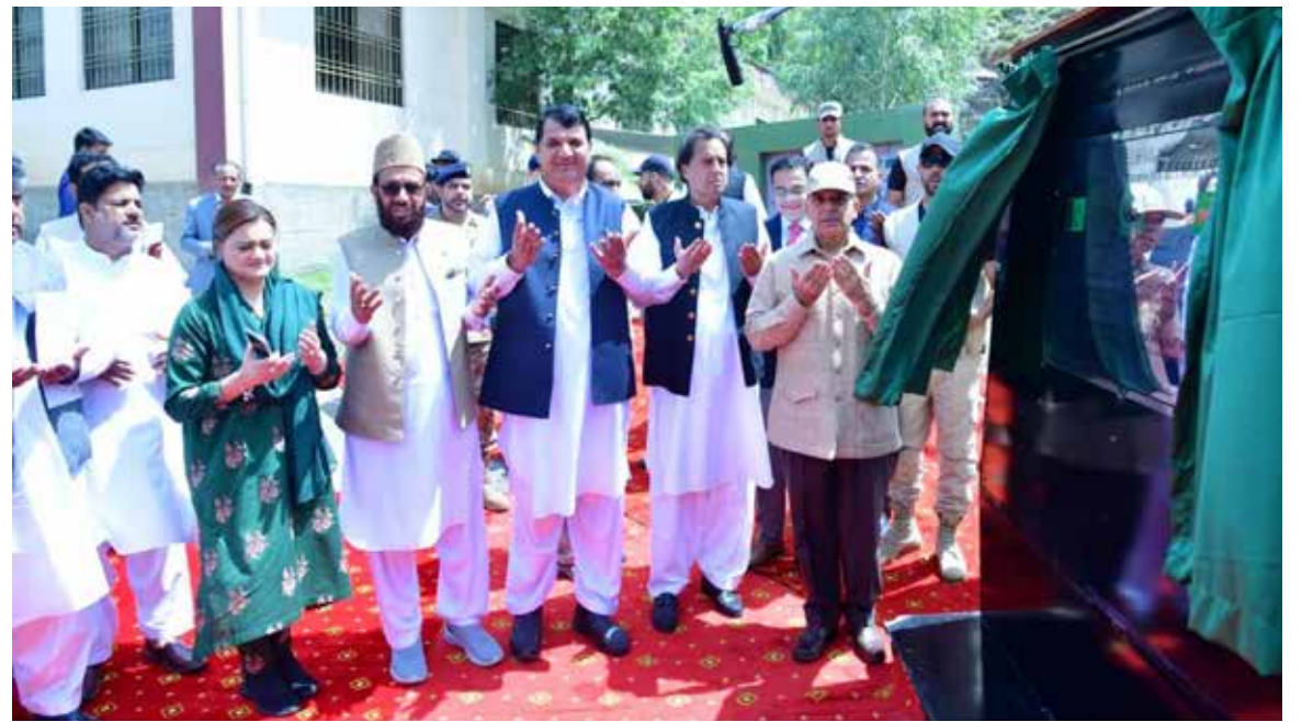
TORGHAR: Prime Minister Muhammad Shehbaz Sharif laying the foundation stone of the RCC Bridge on the River Indus that will connect Torgghar with Buner district.

Nawaz' acquittal a victory of public: Marriyum