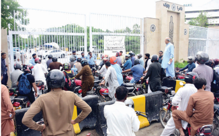
ISLAMABAD: A large number of the employees of Diplomatic Enclave are suffering from a week due to the Government Policy regarding the entering of Bikes to Constitution Avenue from 1st Muharram till 10th, in Federal Capital. - Online

PRONGYANG: In yet another attempt to show strength amid rising regional tensions, North Korea launched two ballistic missiles off the east coast Monday, according to the South Korean military, as US nuclear-capable submarine enters Seoul's naval base. The Japanese defence ministry also reported a launch of ballistic missiles by North Korea, both of which fell outside its exclusive economic zone (EEZ). The ballistic missile firing comes as the region is witnessing heightened tensions with Korea exchanging nuclear threats and the US expressing its resolve against Pyongyang if its allies were attacked. Both the US and its allies are increasing their military cooperation to meet any aggression from North Korea, with military drills and combat readiness. Last week, US nuclear-capable submarine arrived in South Korea coast citing tensions with North Korea. North Korea responded aggressively with a nuclear threat saying such a deployment could meet the criteria for its use of nuclear weapons on Seoul. The United States said it was consulting closely with its allies about the North Korean missile launches, which it described as being destabilising. - Agencies