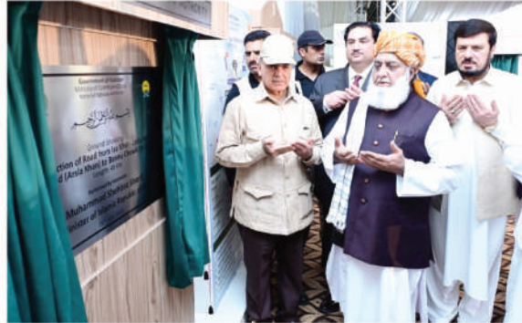
DERA ISMAIL KHAN: Prime Minister Muhammad Shehbaz Sharif inaugurates and lays the foundation stone of various infrastructure development projects.