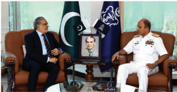
ISLAMABAD: Chief of Naval Staff Admiral Muhammad Amjad Khan Niazi exchanging views with Federal Minister for Finance & Revenue Senator Ishaq Dar at Naval Headquarters.

port, narcotics was recovered from the possession of a Riyadh-bound passenger, resident of Upper Dir, going on flight NP-753. In third operation, 93.2 kg hashish and 73.2 kg opium were recovered from a vehicle intercepted near Kot Abdul Malik Motorway Toll Plaza Sheikhpura. During the operation, the accused resident of Islamabad was