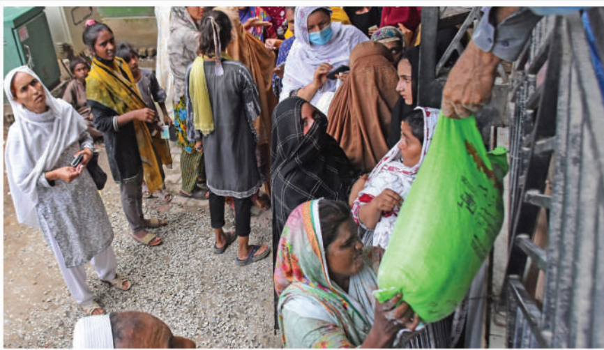
ISLAMABAD: A large number of the people are receiving flour from the utility store at Sitara Market as due to the extremely high inflation, common people are suffering a lot across the country.

but a core priority in district development schemes." This pioneering initiative is seen as a necessary step towards gender equality in education. Intezar Khalid, Chairman of the Neighborhood Council and member of the Capital Metropolitan City Govt, expressed his support for the program, stating, "A nation cannot truly progress unless its girls are empowered. Prioritizing and monitoring the allocation of funds in their budgets. This initiative by Blue Veins and Pakistan Education Champions Network (PECN) offers a viable path to achieving this goal." Blue Veins and the PECN initiative reaffirm their commitment to the cause of girls' education and present a replicable model that can be employed by local government bodies across the country.—APP