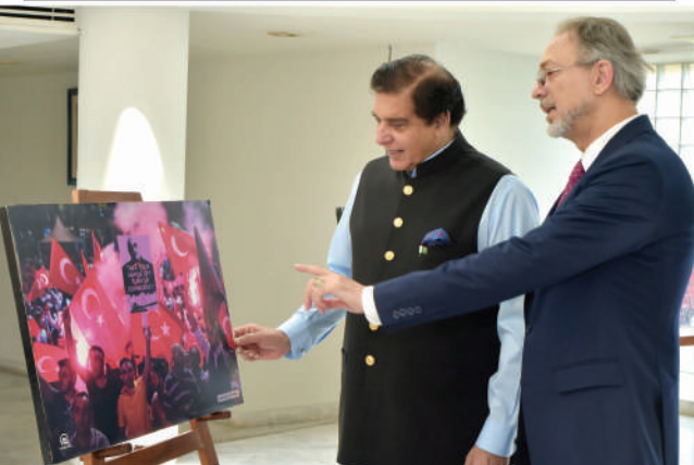
ISLAMABAD: Speaker National Assembly Raja Pervez Ashraf witnessing Turkiye Art Exhibition displayed on the occasion of Turkish Democracy and National Unity Day. - DNA

ISLAMABAD: To counter the dissemination of fake news and propaganda, the government has decided to amend the Prevention of Electronic Crimes Act of 2016 (PECA), and relevant laws are being studied.