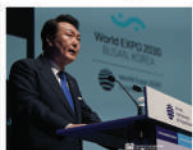
President Yoon Suk Yeol on June 20 makes a speech in English to promote Busan's bid for the 2030 World Expo at a presentation during the 172nd general assembly of the International Bureau of Expositions (BIE) in Paris

In his speech titled 'Promise of the Republic of Korea for World Citizens and Future Generations,' President Yoon expressed the nation's strong intent to host the expo in Busan.