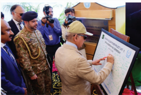
MIANWALI: Prime Minister Muhammad Shehbaz Sharif signing a commemorative board during the ground-breaking ceremony of the 5th unit of Chashma Nuclear Power plant (C-5) in Chashma, Mianwali.

largest construction project ever completed by INL in Pakistan. Implemented by the UN Development Program (UNDP), the completion of this project has enabled the training center to increase its training capacity to 1,700 personnel at one time. The project constructed 75 buildings, including academic buildings, a health unit, men's and women's hostels, and a multipurpose hall. Ambassador Blome and Inspector General of KP Police Hayat also signed an agreement to deliver $13 million in life-saving armored vehicles, bulletproof vests, and helmets to the KP Police. At the event, Ambassador Blome stated, "This investment will have a lasting positive impact. The strengthening of law enforcement presence and the writ of government in remote and under-governed areas of Khyber Pakhtunkhwa will lead to increased security and prosperity."