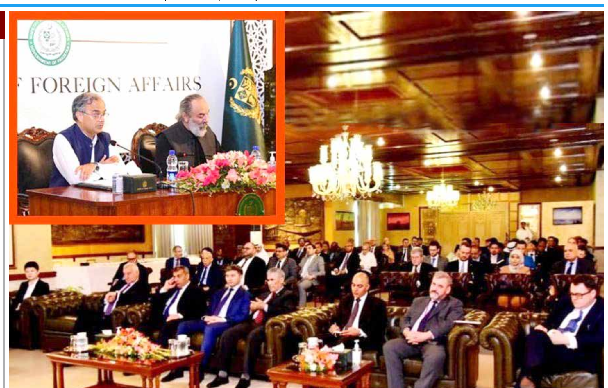
ISLAMABAD: Ahead of 'Youm-e-Istehsal' on 5 August 2023, the Foreign Secretary briefed the Islamabad-based diplomatic missions on the latest developments in Indian Illegally Occupied Jammu and Kashmir. He highlighted the legal, security and human rights dimensions of the situation in IIOJK.