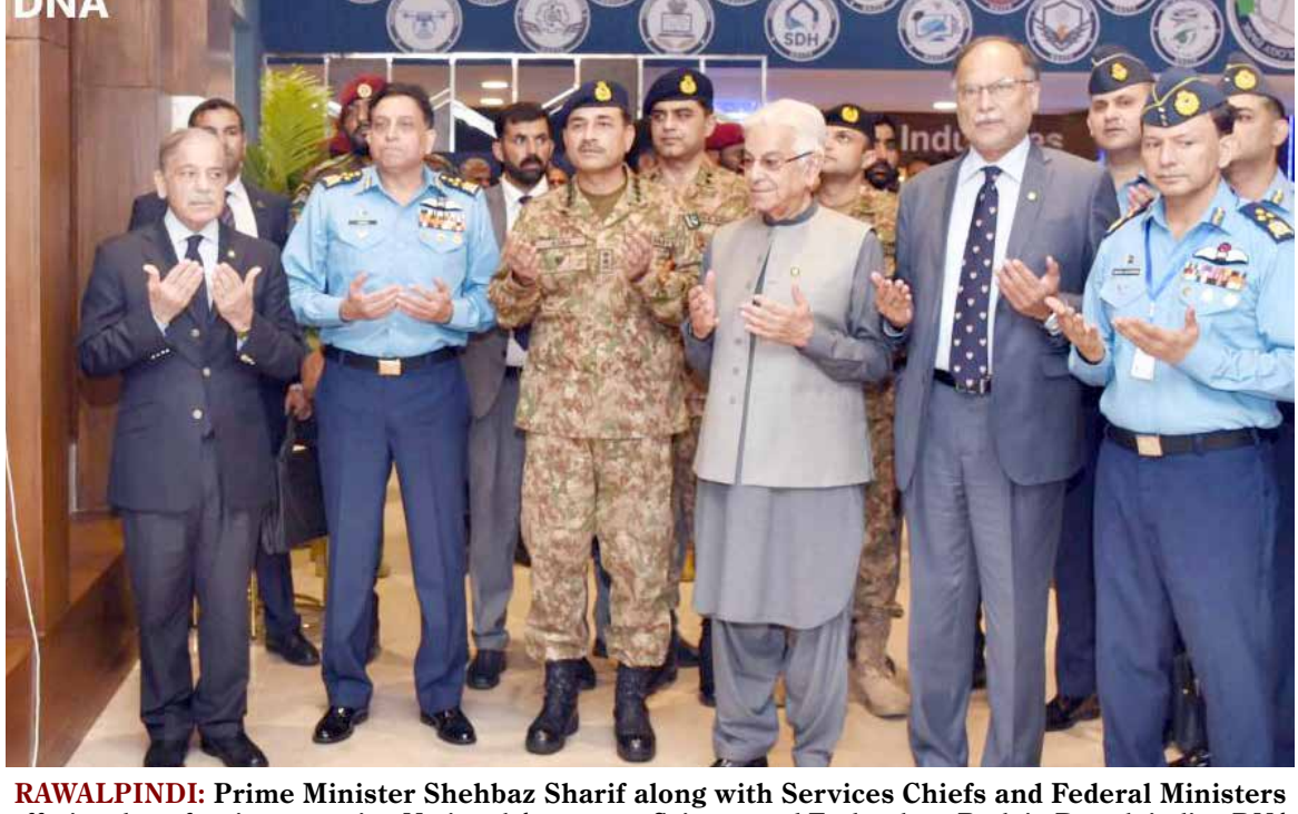
offering dua after inaugurating National Aerospace Science and Technology Park in Rawalpindi.