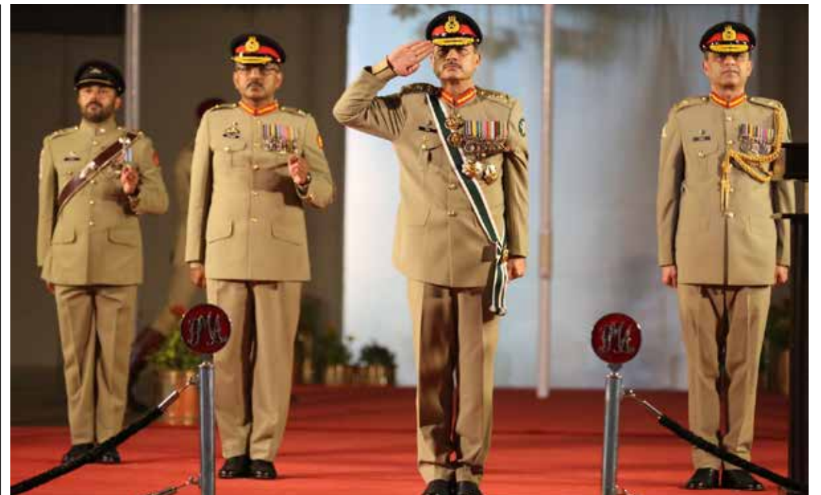
KAKUL: Chief of Army Staff General Asim Munir reviews parade at PMA Kakul on the occasion of August 14.

ISLAMABAD: On August 13th, a convoy carrying Chinese citizens was attacked near the port of Gwadar in Balochistan, Pakistan. The incident caused no casualties on the Chinese side, and the relevant personnel have been properly placed in safety. The Chinese Embassy in Pakistan strongly condemns this terrorist act. The Embassy and the Consulate General in Karachi launched emergency response immediately, requesting the Pakistani authorities to conduct a thorough investigation on the attack, severely punish the perpetrators, take practical and effective measures to prevent similar incidents from happening again. China will continue to work with the Pakistani side, to jointly counter the threats of terrorism and earnestly protect the safety of Chinese personnel, institutions and projects in Pakistan. Given the current security situation, the Chinese Embassy reminds Chinese citizens in Pakistan to be vigilant and take preventive measures against security risks, to ensure the safety of their lives and property.