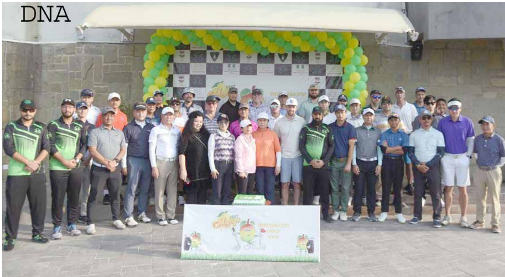
ISLAMABAD: Diplomats, defence attaches and other players posing for a group photo on the occasion of Mango Fest Diplomatic Golf Cup.

Sources explained that previously too Nusrat had remained admitted at a London hospital, and now would fly to the UK capital after getting a clearance from doctors. The former prime minister had dashed to Lahore yesterday immediately after nominating Anwaarul Haq Kakar as the country's caretaker prime minister.