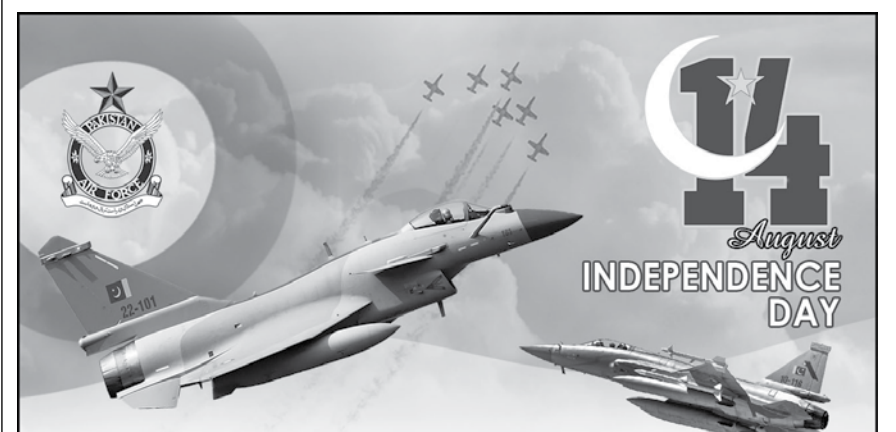
On the auspicious occasion of Independence Day of Pakistan, I extend my heartiest felicitations to all fellow citizens.

Punjab and other cities of the country through vehicles and motorcycles that also confiscated. Shabbaz, son of Muhammad Ayub, the leader of another gang involved in the robberies, was also arrested and the stolen mobile phones and Rs 80,000 in cash were also recovered. The accused belongs to an organized band of robbers who are involved in stealing cash, including valuable mobile phones, from citizens on the way. The SP disclosed that eight criminals were arrested during the crackdown against criminals involved in murder, attempted murder and other serious crimes, including other criminal elements. All the arrested criminals have admitted their involvement in various crimes during preliminary investigation.—APP