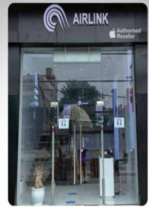
AIR LINK FLAGSHIP STORE WINDIA MALL LAHORE