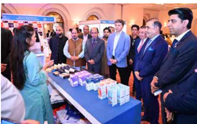
countries seeking affordable healthcare solutions, they added. The topics for the panel discussion includes Medical Care and Challenges in the Modern Era, Development of Health Care Equipment in Pakistan, Biological and Vaccine Development in Pakistan, Industry-Academia Linkage & Research in the Healthcare Sector in Pakistan, Health Tourism etc.