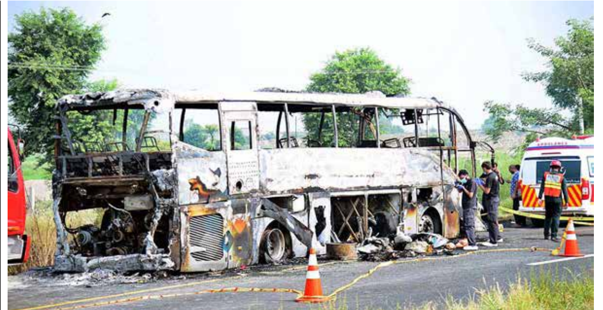
SARGODHA: A view of burned bus after incident in which eighteen people lost their lives.