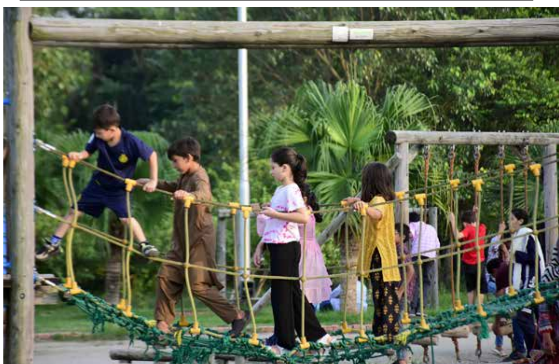
ISLAMABAD: Aug 20 - Children are enjoying Sunday Holiday at Japanese Children Park in Federal Capital.

at least 145 alleged miscreants, including two prime suspects, out of total 1,470 persons who had been booked in connection with the incidents of violence. The vandalism and arson sparked nationwide outrage, with various religious clerics strongly condemning the incident and urging exemplary punishment to be given to the perpetrators.