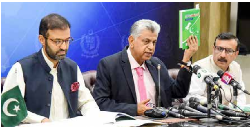
ISLAMABAD: Law Minister Irfan Aslam and Information Minister Murtaza Solangi addressing a press conference.