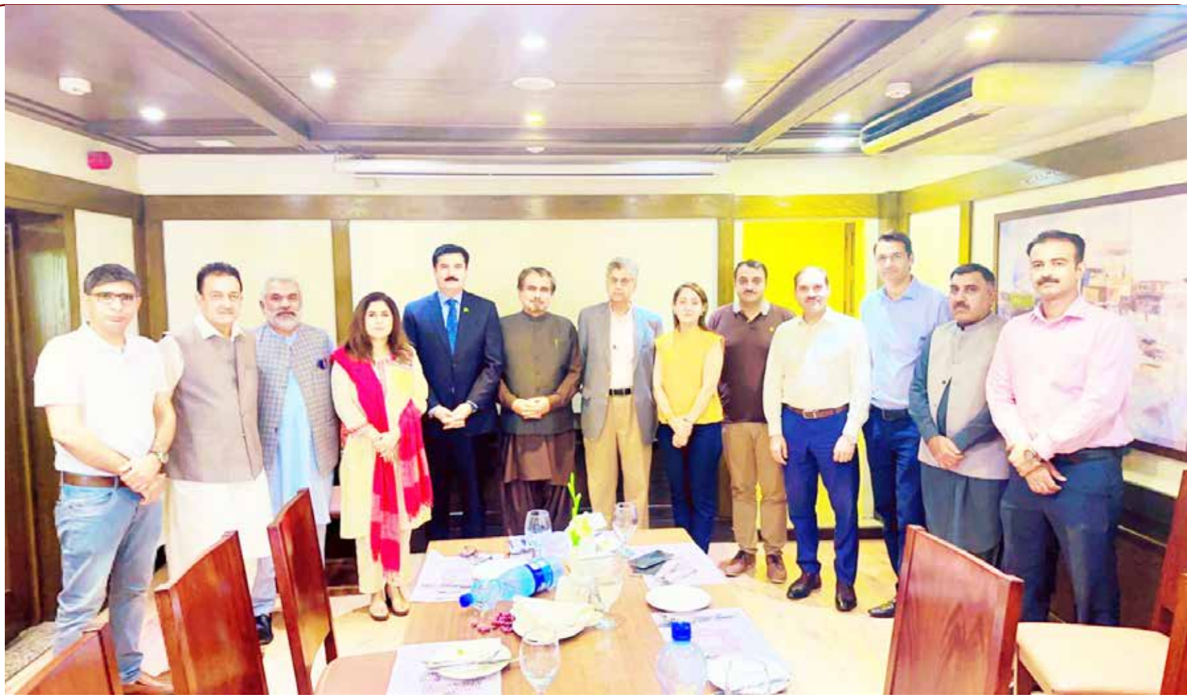
ISLAMABAD: Federal Minister for Information Murtaza Solangi, Federal Culture Minister Jamal Shah and senior journalists posing for a picture during a media interaction.