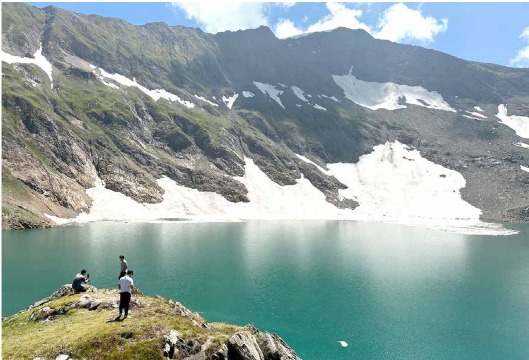
KASHMIR: Tourist are enjoying at the beautiful Patlian lake of the Neelum Valleys as the kashmir is the best tourist attraction in Pakistan.

FROM PAGE 01 In London to decide that PML-N supremo will return to Pakistan in mid-October. Previously, media reported that Nawaz will return to Pakistan by mid-September; however, there has been a change of plan in the last few days after the Election Commission of Pakistan (ECP) announced that elections are not possible within 90 days. The sources said that Nawaz's return has been delayed till mid-October, not because of the ECP announcement but over the advice of party loyalists that September is too hot and severe for large-scale political gatherings, making mid-October a better time for return. The decision to return around mid-October was taken after Shehbaz held two meetings with the PML-N supremo in London. Shehbaz arrived in London last Sunday after handing over the reins to Caretaker Prime Minister Anwar-ul-Haq Kakar. "It's the severity of weather that is being kept in mind in deciding the return date of Nawaz Sharif. There could be a further change but for now, the date of 15th October is final, and further discussions will take place around it," shared the trusted source.