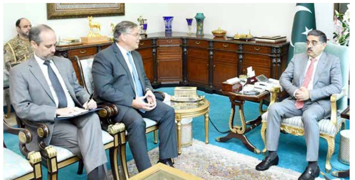
ISLAMABAD: US Ambassador to Pakistan Donald Blome called on the caretaker Prime Minister Anwaar-ul-Haq Kakar in Islamabad.