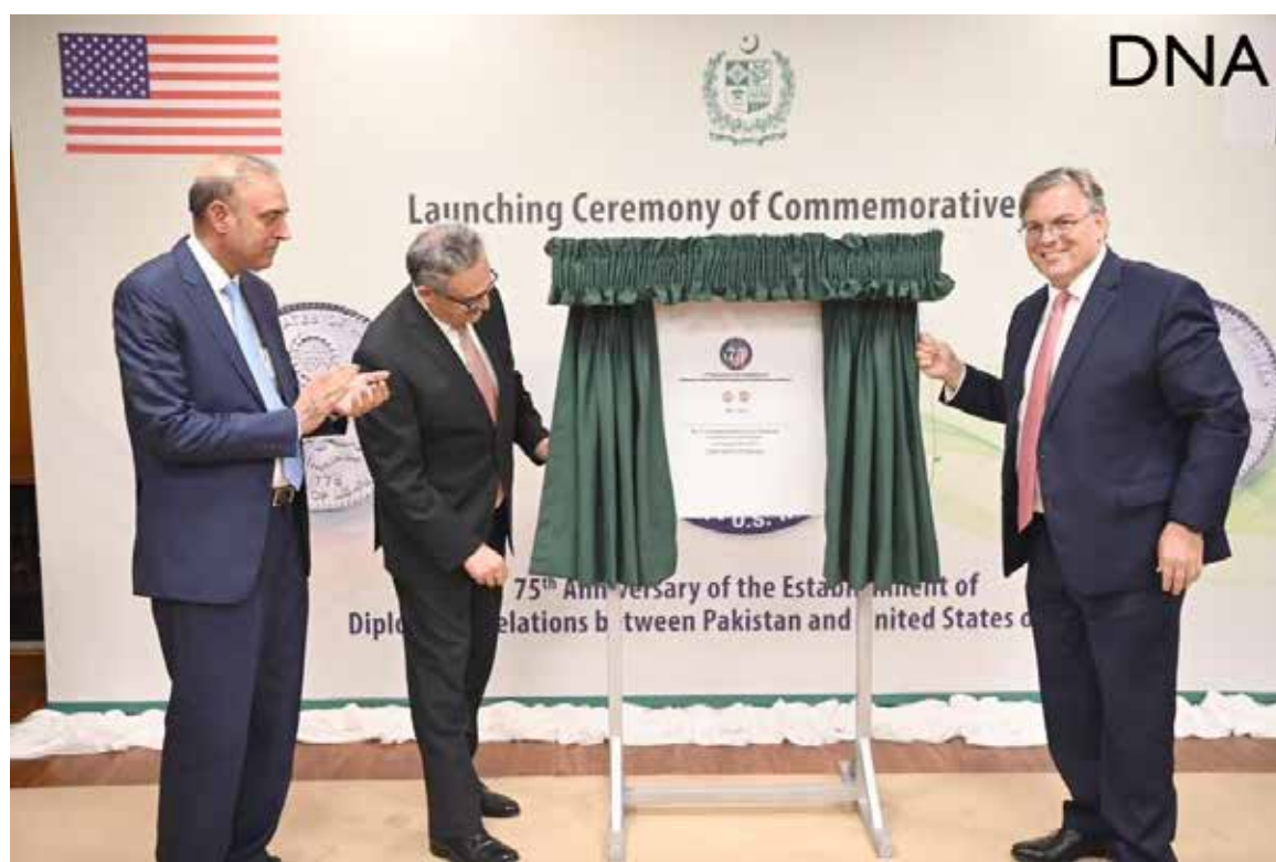
ISLAMABAD: Foreign Secretary Syrus Qazi attended the launch ceremony of commemorative coin marking the 75th anniversary of Pak-US diplomatic relations organized by State Bank. The coin signifies historic Pak-US relationship embedded in democratic values, mutual cooperation and common interests.—DNA