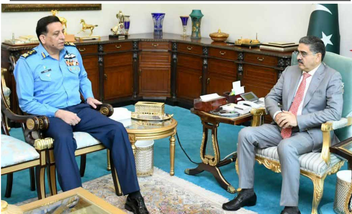
ISLAMABAD: Chief of Air Staff Air Chief Marshal Zaheer Ahmed Babar called on caretaker Prime Minister Anwaar-ul-Haq Kakar in Islamabad.