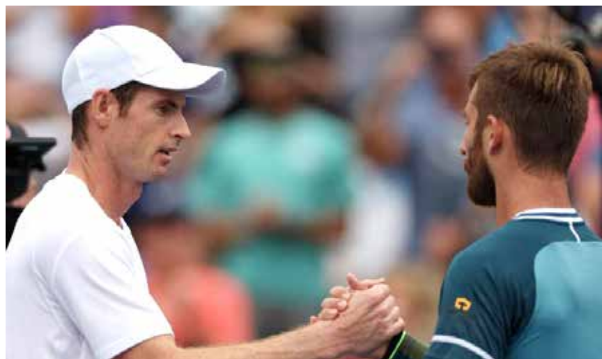
The Swedish umpire being unable to see the replays on her personal screen "It took about four minutes to make a decision," said Murray

"If the video is not available on the chair umpire's tablet, the original call on the court stands. "Immediately following the match, the malfunctioning tablet was repaired." Technology has been a key part of tennis for many years to decide line calls but it is the first time the umpires have been able to access a video-assist review. The US Open introduced the system for chair umpires to be able to immediately check incidents - double bounces, hindrance and a player touching the ball or the net - if they are challenged by a player. "I knew there is VR, I don't know how they use it," said Murray, who levelled at 30-30 after the decision and went on to serve out the match in the same game. "Maybe it wasn't on the umpire's tablet but it was on the big screens where they are showing multiple different angles and it is pretty clear from the second angle it had bounced twice. "I don't know who makes the call because she said it wasn't available to her so went to the original call. "I'm pleased the original call stood and I got the point."