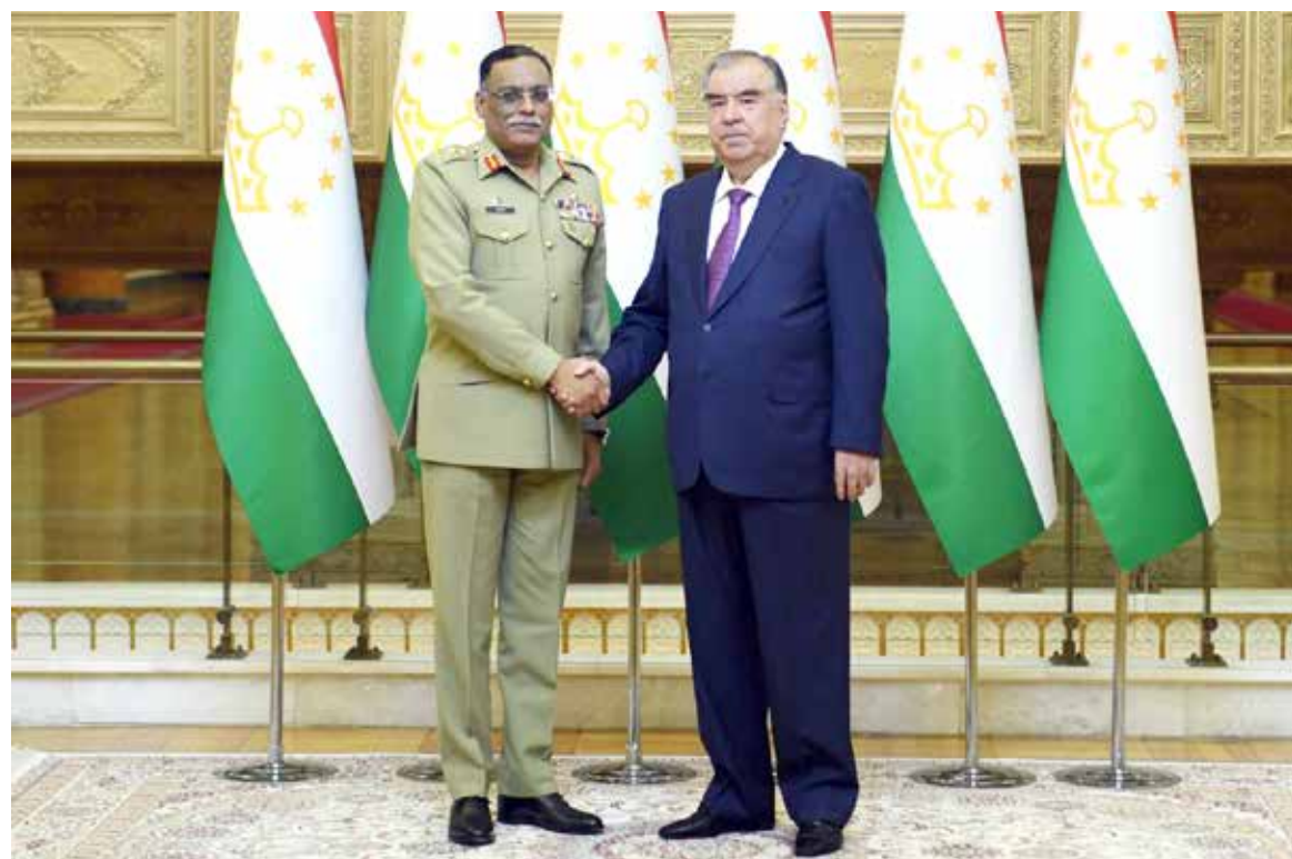
DUSHANBE: General Sahir Shamshad Mirza, CJCS, who is on official visit to Tajikistan, calls on Emomali Rahmon, President of Tajikistan. Chairman JCSC also had separate meetings with other government and military officials during which matters of mutual interests were discussed.