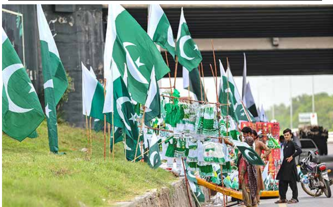
ISLAMABAD: vendors displaying National flags along Islamabad Expressway to attract customers as nation starts preparation to celebrate Independent Day in befitting manners.

the past decade, CPEC has made such tremendous achievements, which not only promoted the socio-economic development of Pakistan and created a large number of jobs, but also further enhanced the 'iron iron' friendship between China and Pakistan, and is a 'game changer' in Pakistan and South Asia.