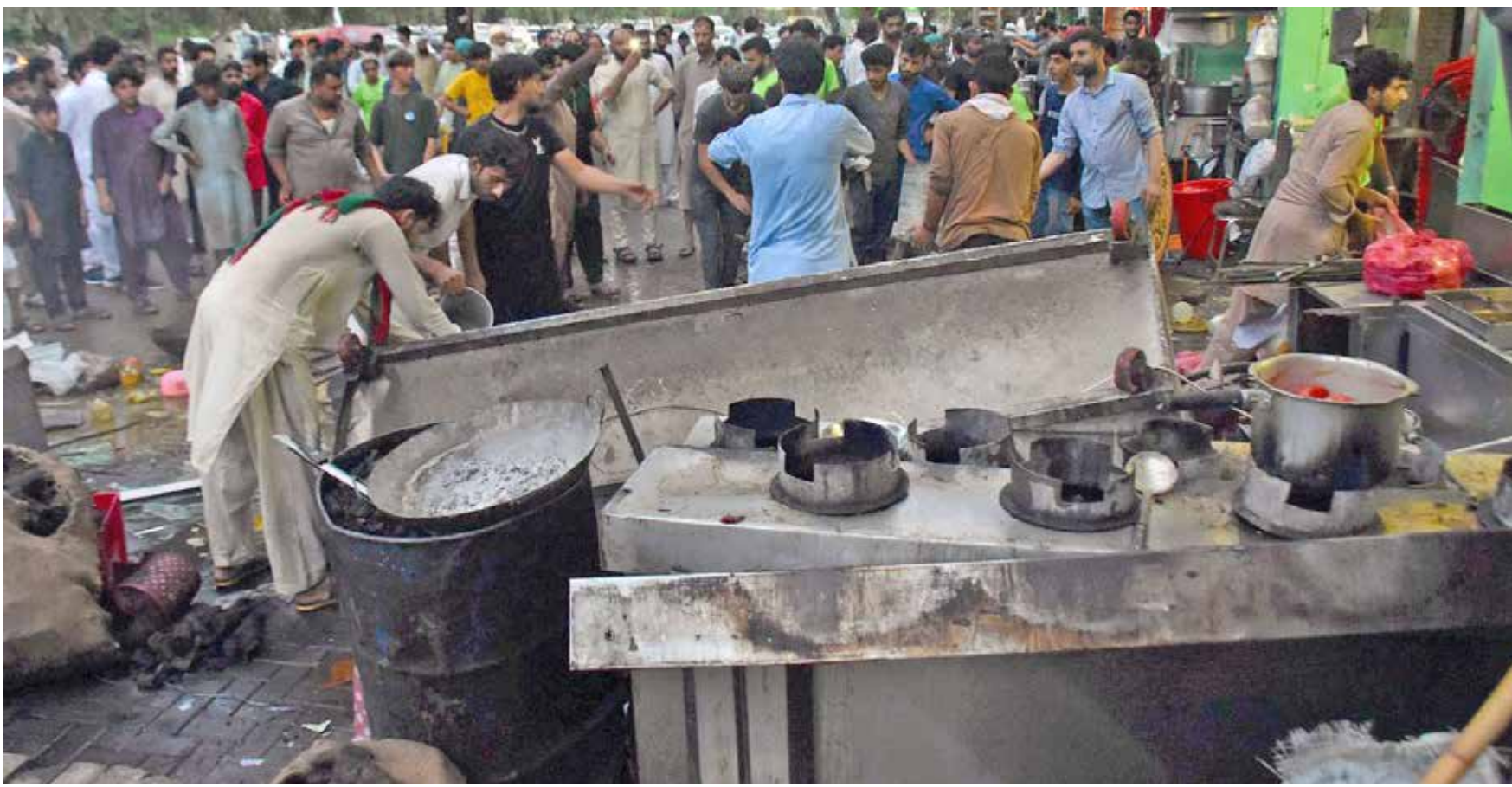
ISLAMABAD: Workers of Anti Encroachment Cell of CDA clears the encroachments of restaurants on footpath at G-8 Markaz during Anti Encroachment Operation in Federal Capital.