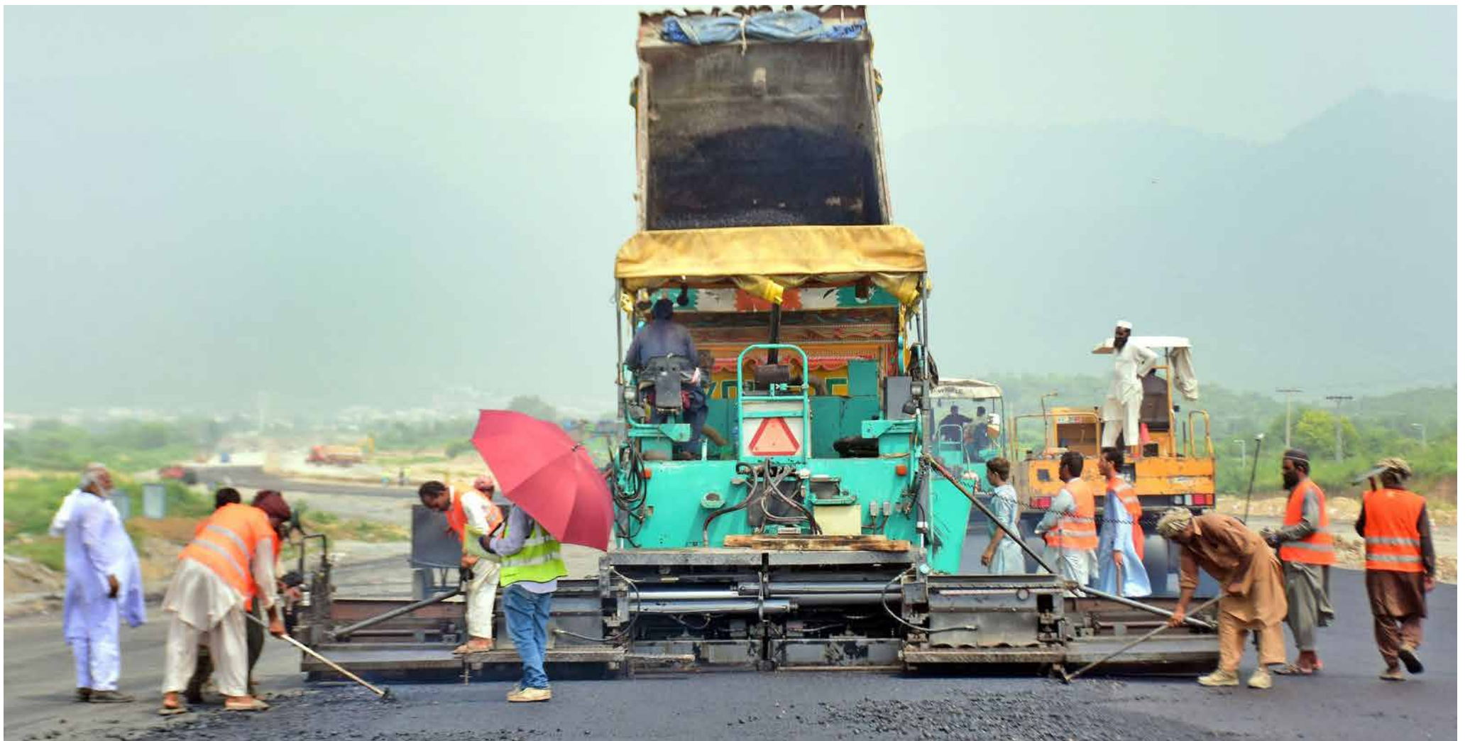
ISLAMABAD: Laborers are busy in carpeting of the road during the construction of E-11 Flyover in Federal Capital.