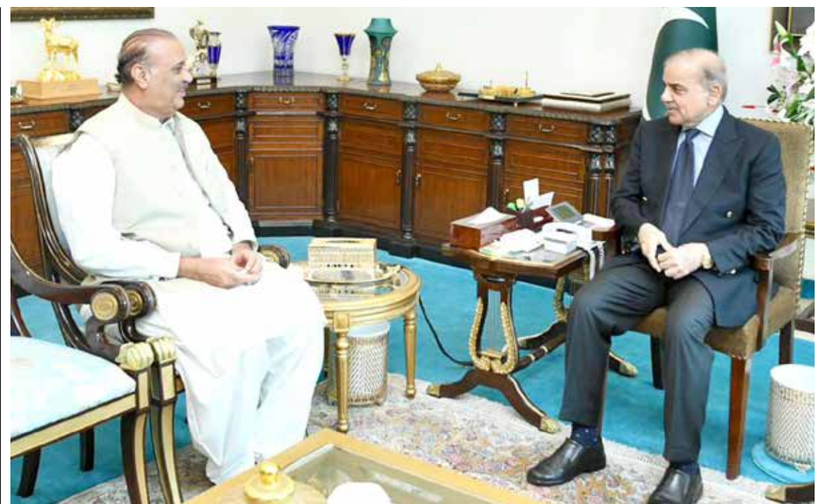
ISLAMABAD: Prime Minister Shehbaz Sharif meets outgoing Opposition Leader in the National Assembly (NA) Raja Riaz.