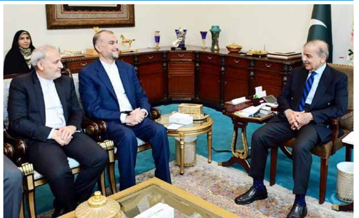
ISLAMABAD: The Foreign Minister of Iran, Hossein Amir Abdollahian, calls on the Prime Minister, Muhammad Shehbaz Sharif, Iranian Ambassador is also present on the occasion.