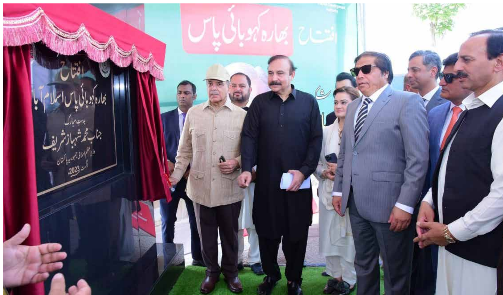
ISLAMABAD: Prime Minister Muhammad Shehbaz Sharif receiving a briefing regarding Barakahu Bypass which was inaugurated.

He said people were well aware that elections on new census could not be held without amendment to the constitution by a two-thirds majority. But the day they (rulers) revealed the truth to the people, would prove to be their last day in power, he said. "Their days in power are numbered so they should make preparations for their departure. They (rulers) have a previous record of fleeing the country on a Rs 50 stamp paper," stated the AML chief.