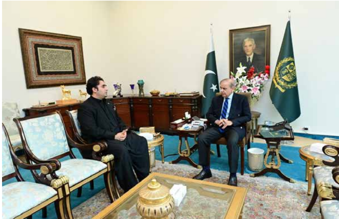
ISLAMABAD: Foreign Minister Bilawal Bhutto Zardari calls on Prime Minister Shehbaz Sharif.

Capital Territory, and the Federally Administered Tribal Areas and seats reserved for women and non-Muslims, as specified in Article 51 of the Constitution. The ECP will annually publish disaggregated data of registered men and women voters in each National Assembly and Provincial Assembly constituency highlighting the difference in number of registered men and women voters, he said. The law minister said that the Presiding Officer may at any stage on the polling day during or after the polling, prepare and send a special report to the Returning Officer and to the commission if he has reason to believe that women voters have been restrained from exercising their right to vote based.—APP