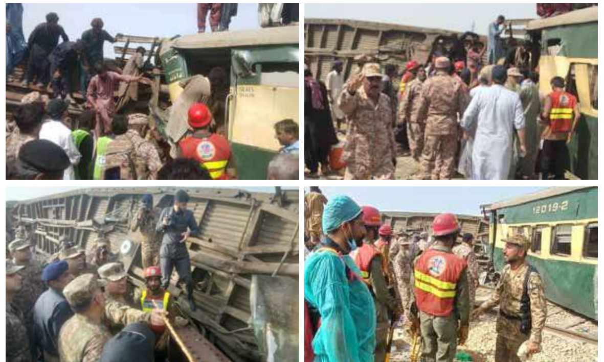
NAWABSHAH: Pictures from deadly train accident in Nawabshah; Army and Rangers personnel are assisting civil administration in relief efforts.