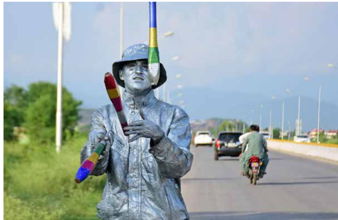
ISLAMABAD: A man is wearing silver color dress and performing his skills alongside a road.