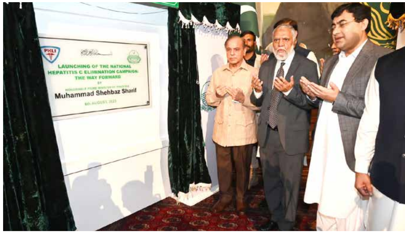
LAHORE: Prime Minister Shehbaz Sharif launches National Hepatitis C elimination campaign. - DNA

FLORIDA: Prosecutors in Donald Trump's upcoming trial have asked for limits on what the ex-president can publicly say about the case, after he shared a threatening message online. In a filing late on Friday night, the prosecutors said they feared Mr Trump might disclose confidential evidence. They justified the move citing a post by Mr Trump shared on Friday, saying it targeted people involved in the case. But Mr Trump's team insisted the post was directed at political opponents. On the Truth social network Mr Trump wrote "IF YOU GO AFTER ME, I'M COMING AFTER YOU!" on Friday afternoon, just a day after he pleaded not guilty to four charges in the alleged election fraud case. The charges - which include conspiracy to defraud the US, tampering with a witness and conspiracy against the rights of citizens - stem from the former president's actions in the wake of the 2020 election, including around the 6 January Capitol riot.