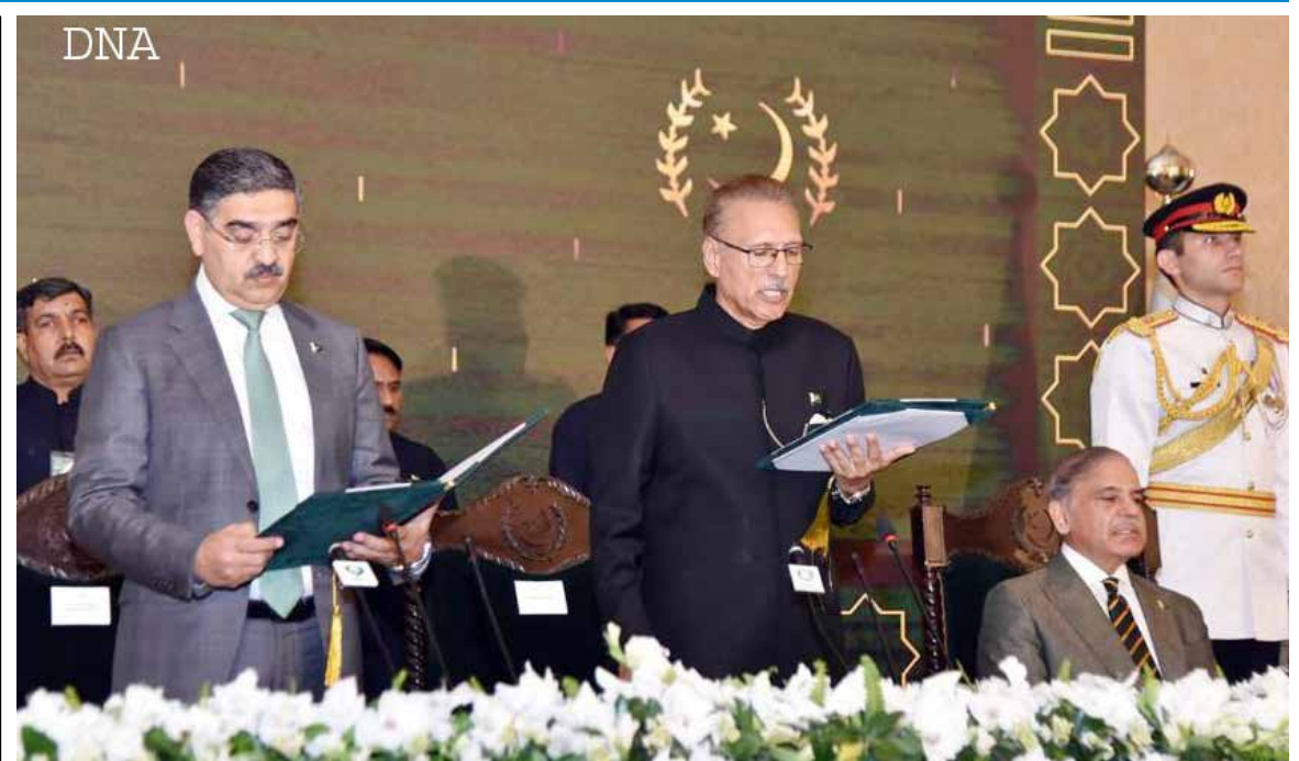
ISLAMABAD: President Dr Arif Alvi administering the oath of office to Mr Anwar-ul-Haq Kakar as the caretaker Prime Minister of Pakistan, at an oath-taking ceremony held at Aiwan-e-Sadr, Islamabad.