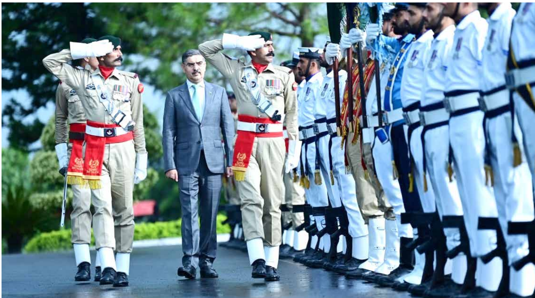
ISLAMABAD: Caretaker Prime Minister Anwaar-ul-Haq Kakar being presented Guard of Honor at Prime Minister's House, Islamabad.

DNA LONDON: UK Prime Minister Rishi Sunak blames the "criminal gangs" facilitating small boat Channel crossings for the "horrific" weekend deaths of at least six migrants, his spokesman said Monday. Six Afghan men died and dozens more required rescuing after a small vessel bound for the southeast English coast from France sank in the Channel in the early hours of Saturday. "The blame for the tragedy we've seen in the Channel in recent days lies squarely in the hands of criminal gangs who are exploiting people's lives for profit," Sunak's spokesman told reporters.