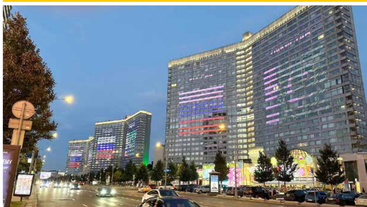
MOSCOW: A view of three tallest buildings located in the heart of Moscow Arbat, displaying digital flags of both Pakistan and Russia on the occasion of the Independence Day of Pakistan.