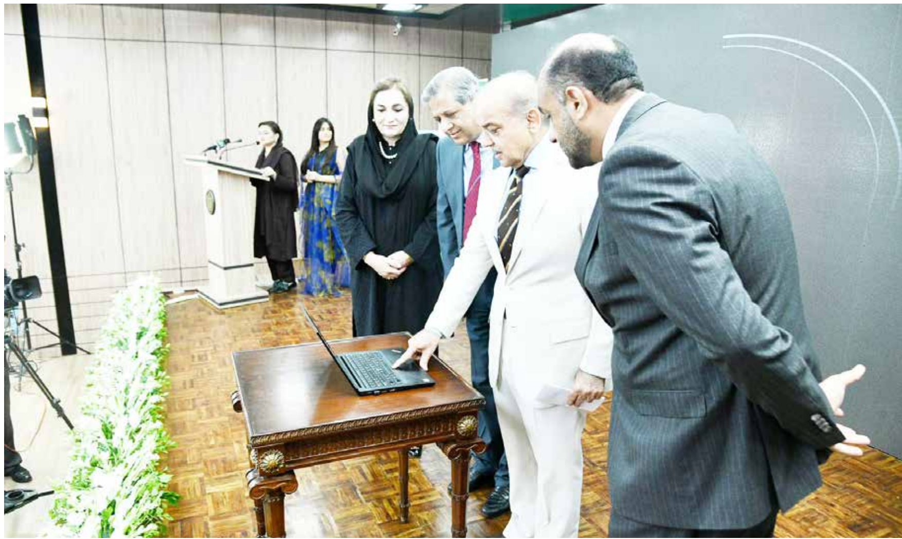
ISLAMABAD: Prime Minister Muhammad Shehbaz Sharif launching the website and APP "Pakistan Code" in Islamabad.

RAWALPINDI: Anti-Narcotics Force (ANF) while conducting three operations across the country managed to recover over 207 kg drugs and arrested five accused, said an ANF Headquarters spokesman here on Tuesday. He informed that in an operation, a raid was conducted on Motorway Toll Plaza Islamabad and ANF recovered 14.4 kg opium, 21.6 kg charras from secret cavities of two cars and also rounded up five drug smugglers, residents of district khyber. In another operation on RCD Highway Lasbela near Al-Aziz Hotel, 162 kg charras was recovered from a bus. Charras was concealed in fuel tank of the bus. In third operation, 9.6 kg charras was recovered from secret cavities of a vehicle intercepted on University Road Peshawar. Separate cases have been registered against the accused while further investigations are under process, he added. —APP