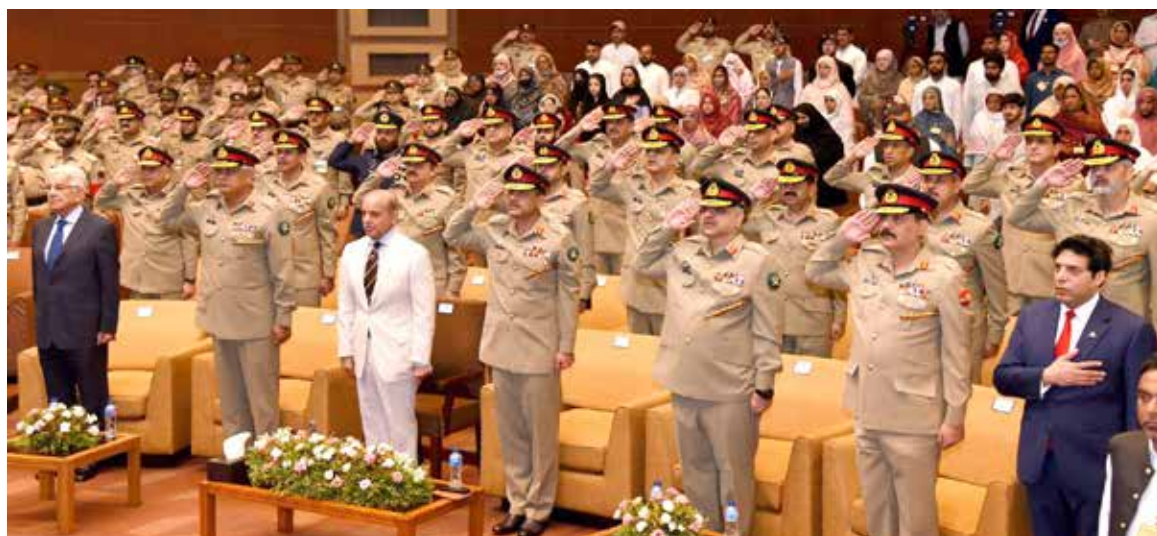
RAWALPINDI: Prime Minister Shehbaz Sharif and Army Chief along with the senior civil and military leadership, pay tribute to Martyrs.