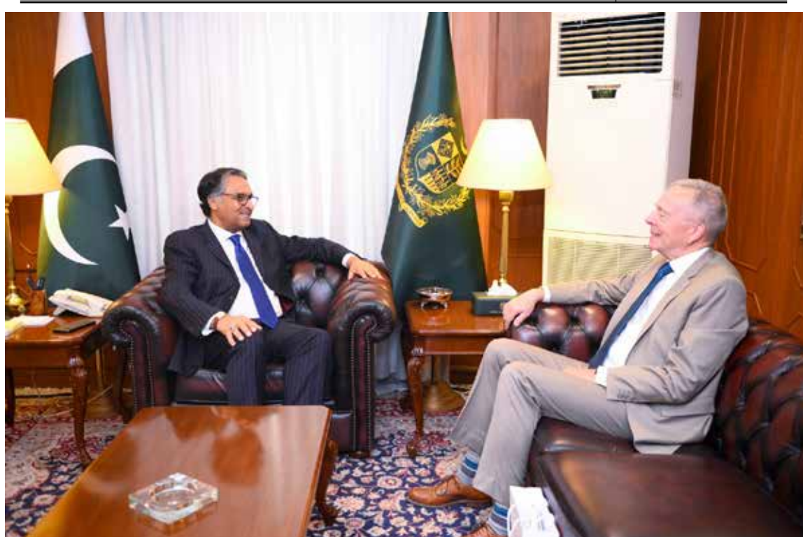
ISLAMABAD: Ambassador of Czech Republic Tomáš Smetánka called on FM Jaiil Abbas Jilani.