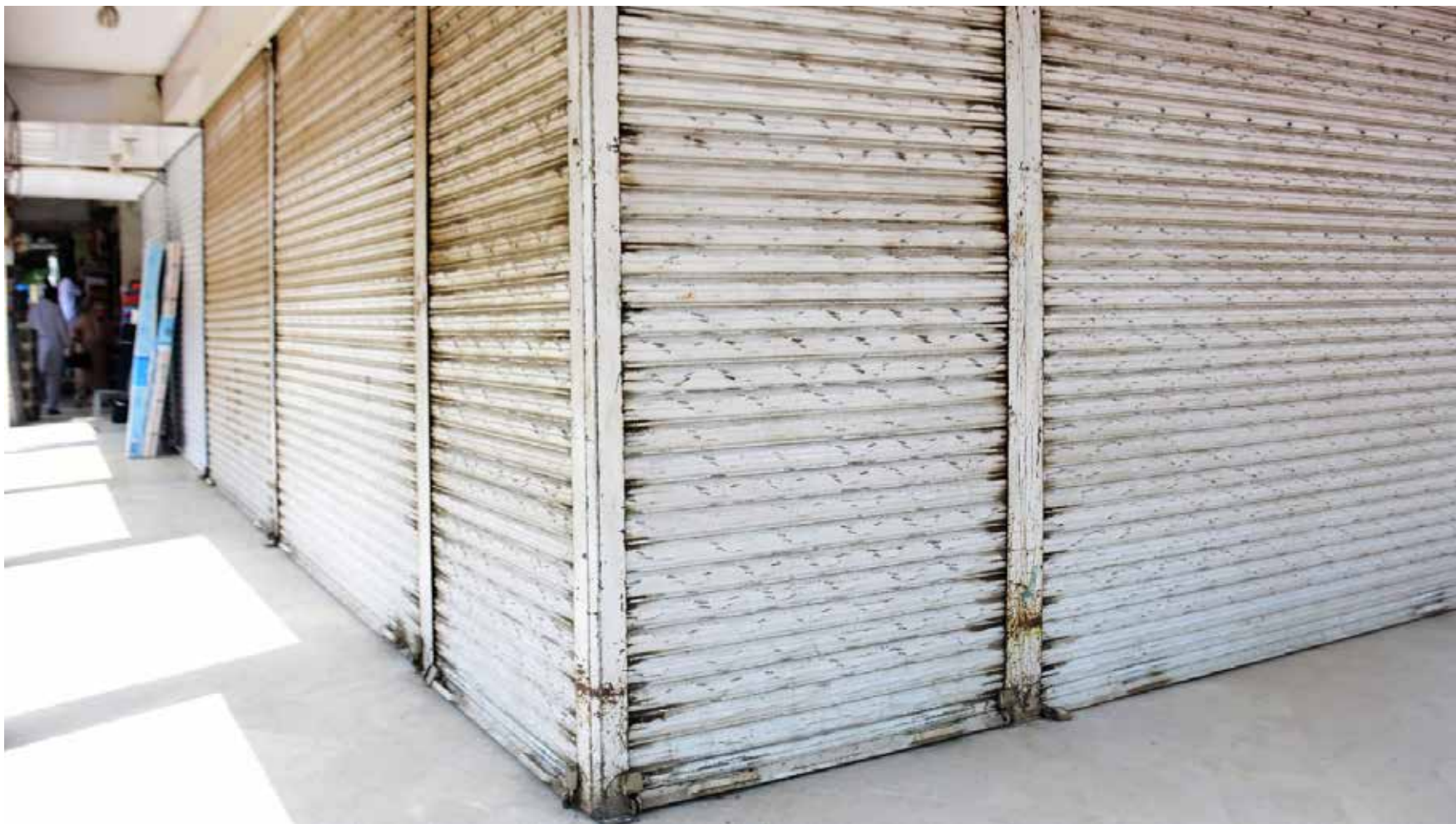
ISLAMABAD: A view of the closed shops at Aabpara Market during the protest by the Traders Action Committee of Aabpara Market against the unjust price hike of the electricity and unbearable inflation.

despite the accounts being restored last month." According to a PIA spokesperson, the freezing of the national carrier's bank accounts would not affect its flight operations. "There is contact at the government level. PIA's accounts would be restored soon," the spokesperson added. It should be noted that on July 27, the FBR had frozen all bank accounts of the PIA over non-payment of taxes, sources had told Geo News. Subsequently, on July 28, the accounts were restored following the settlement of issues between the FBR and PIA, according to sources. In recent years, mismanagement of funds, a rise in operating costs and a surge in fuel prices have led to financial difficulties for the national carrier. The PIA also faces scrutiny over its compliance with international safety standards, leading to temporary bans and restrictions on Pakistani airlines in various countries. The national flag carrier, in response, had claimed that its flights continued uninterrupted despite the tax bureau freezing its accounts. The sources in the FBR said the PIA had not deposited the FED of Rs4 billion, which it had collected through plane tickets.