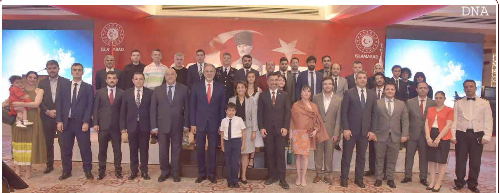
ISLAMABAD: Ambassador of Turkiye Mehmet Pacaci and embassy staff posing for a picture on the occasion of the Victory Day celebrations.