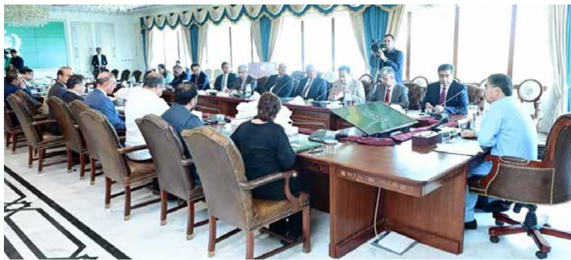
ISLAMABAD: Caretaker Prime Minister Anwaar-ul-Haq Kakar chaired a meeting on Pakistan's economy in Islamabad.

its commitment to finish the delimitation process by December and hold elections by mid-February. Last week the PML-N's delegation backed the election organising authority to hold polls after carrying out delimitation of constituencies based on the new census. As per the election watchdog, the Nawaz Sharif-led party informed the ECP that the Council of Common Interest (CCI) had unanimously given the approval for the publication of census results. "All political parties agreed that 2023 elections should be held as per the new census. The delimitation schedule issued by the Election Commission is in accordance with the Constitution and the law." The PML-N informed the ECP as per the watchdog.