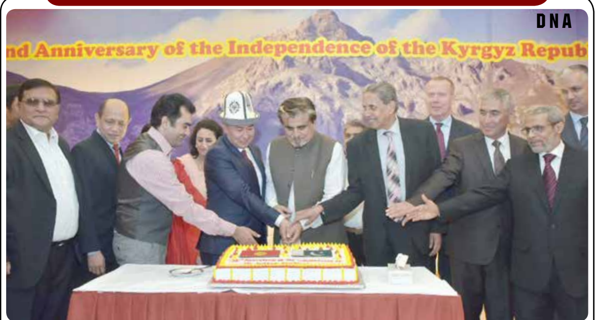
ISLAMABAD: Chief guest Jamal Shah Federal Minister for Culture, Ambassador of Kyrgyz Republic Ulanbek Totuiaev and others cutting cake to celebrate the 32nd Anniversary of the Independence of Kyrgyzstan.