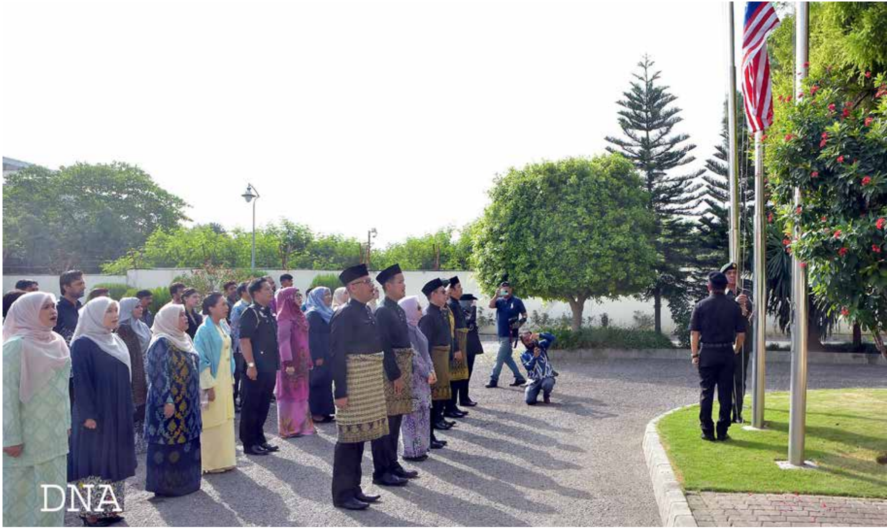
ISLAMABAD: High Commissioner of Malaysia Azhar Mazlan along with embassy staff witnessing the flag hoisting ceremony on the occasion of the 66th Independence Day of Malaysia. (News and another picture on the Back Page).