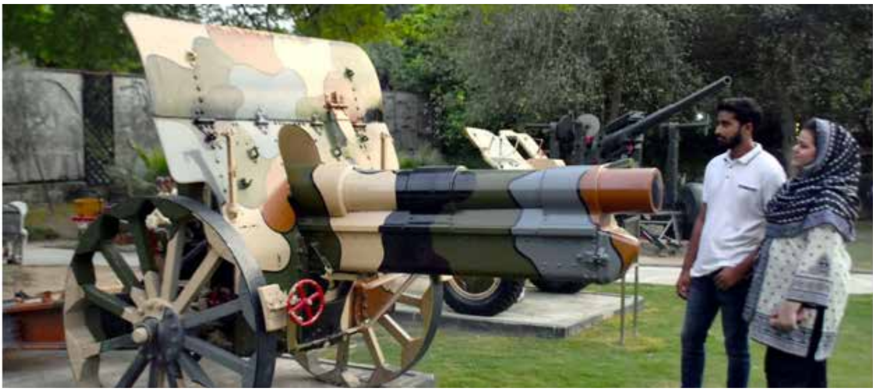
RAWALPINDI: Families are taking interest in the models of the armor tanks and vehicles (Used in September War 1965) at Ayub National Park, on the eve of the "Defense Day" in City.