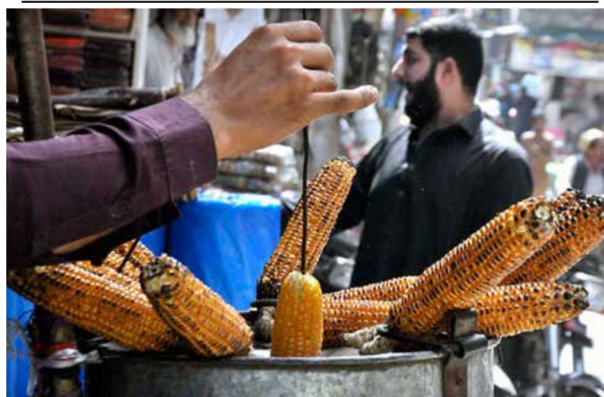
RAWALPINDI: Street vendor selling roasted Corn cob at roadside.