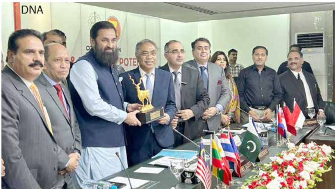
BUREAU REPORT / DNA

Ambassador Tugio also highlighted the cultural charm, demography and bio diversity of ASEAN region that makes it popular tourism destination with tremendous investment and innovation opportunities in hospitality and food industry