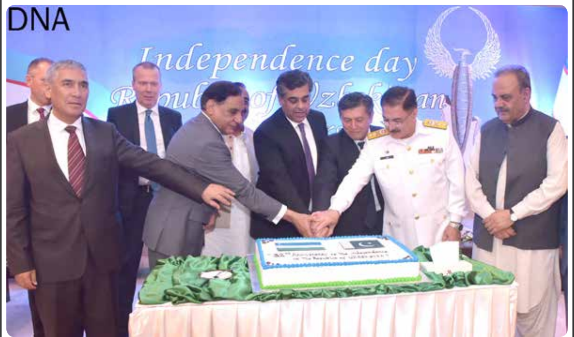
ISLAMABAD: Federal Minister for Commerce Gohar Ijaz, former DG ISI Lt. Gen Ihsan ul Haq @, Ambassador of Uzbekistan Aybek Osmanov and other cutting cake to celebrate the 32nd Independence Day of Uzbekistan.